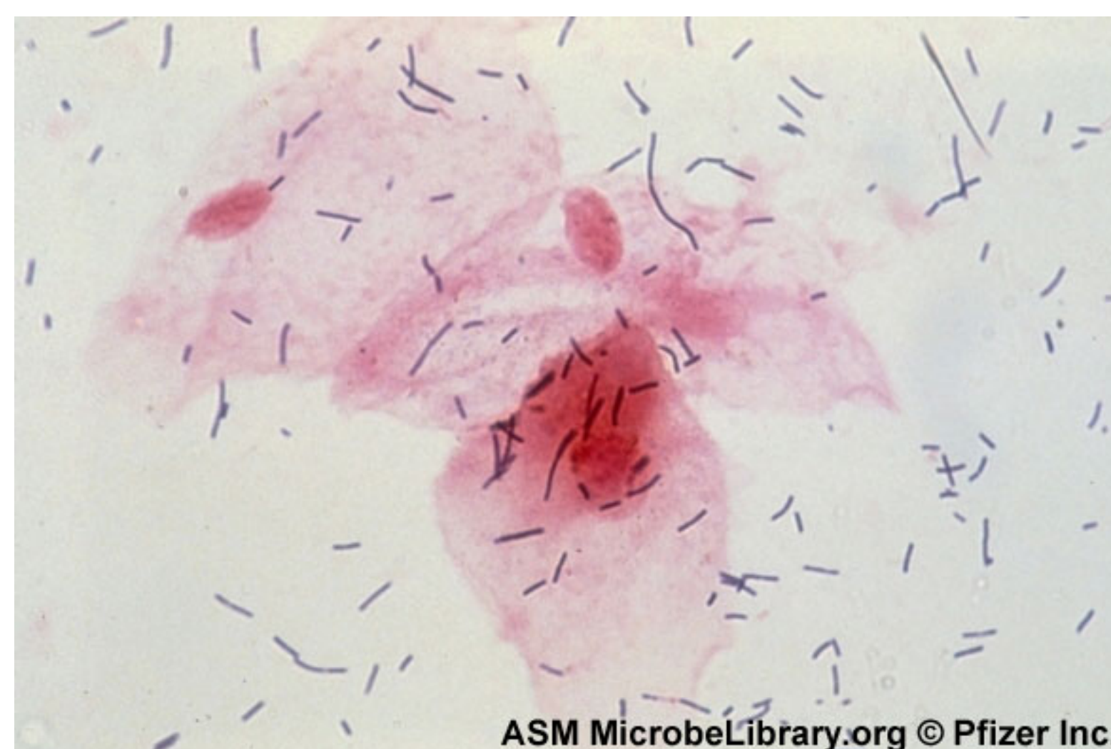
Figure 1: Squamous epithelial cell with lactobacillus. Buxton, Rebecca. University of Utah Pathology Department