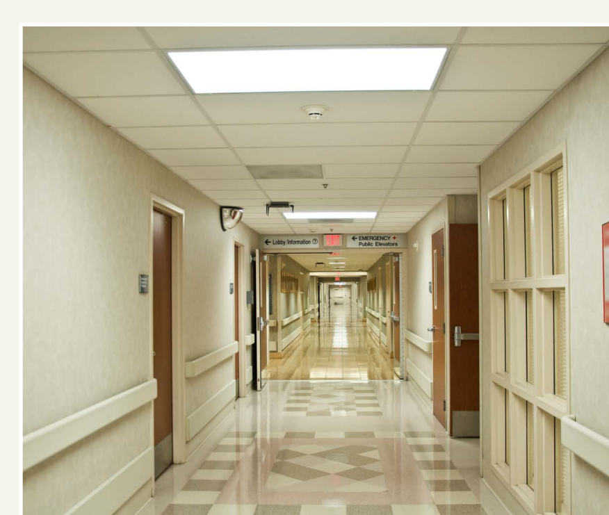
Clinical experience in Pauley Heart Center

Clinical groups comprised of ten senior level baccalaureate nursing students participated in the following activities over the course of one or two days: