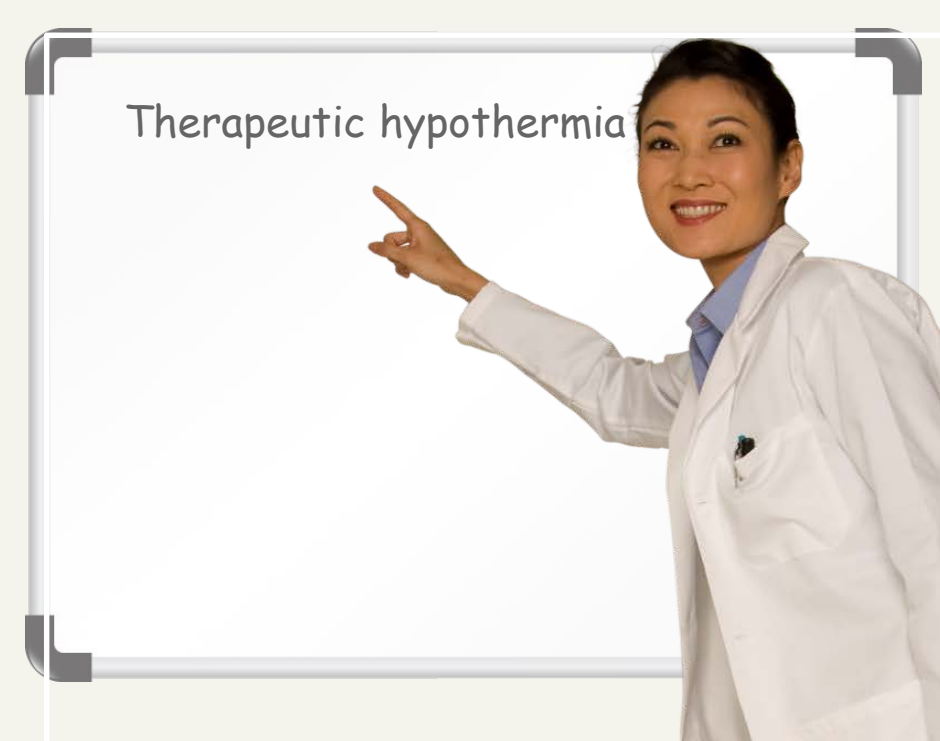
Interactive didactic session with therapeutic hypothermia expert