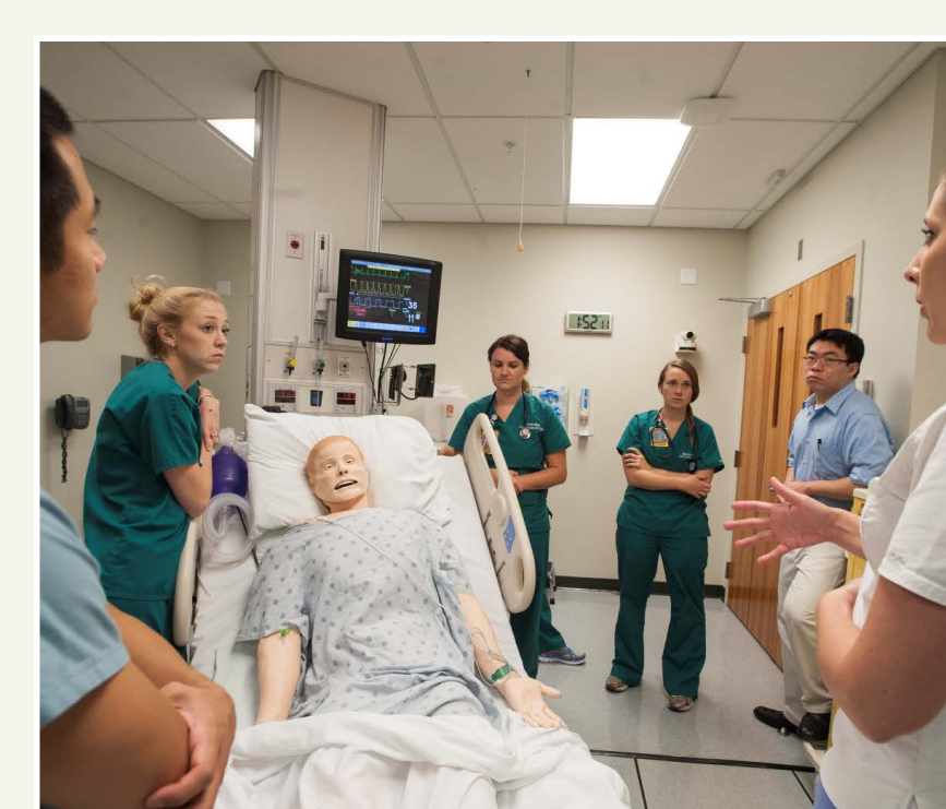
High fidelity ACLS code simulation