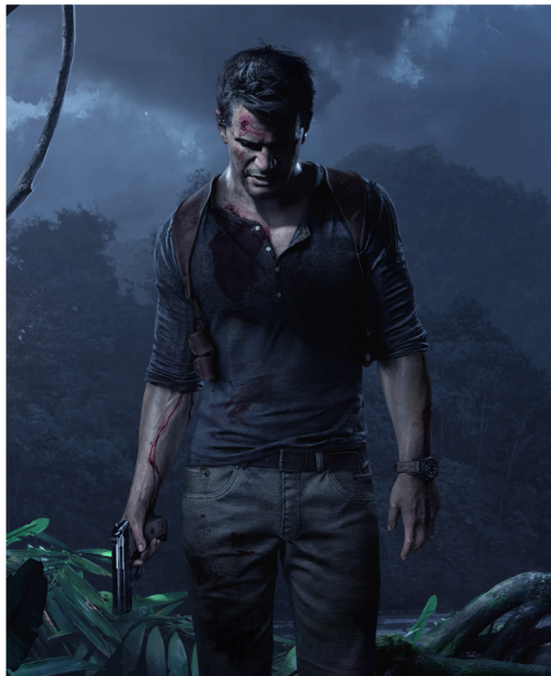
Figure 3. Nathan Drake from Uncharted 4: A Thief's End (Naughty Dog).

is much smaller than the upper body, as the legs are too narrow to be proportionate with the rest of the body. The lack of proportion of the figure and lack of muscular tone make this figure seem unrealistic and cartoonish, as Martins et al. suggested, possibly reducing the possibility of adolescent boys viewing the figure's larger body type as an ideal to attain (Figure 1).