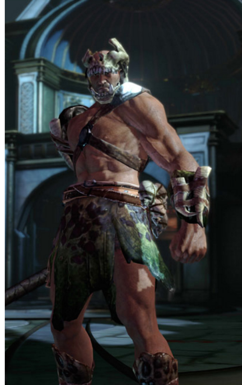
Figure 2. A character from God of War: Ascension (Santa Monica Studios).