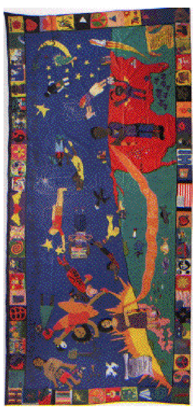
Figure 1. The Tallahassee Mural, Kids' Guernica, 25' x 12', July 1995, The Florida State University, USA.