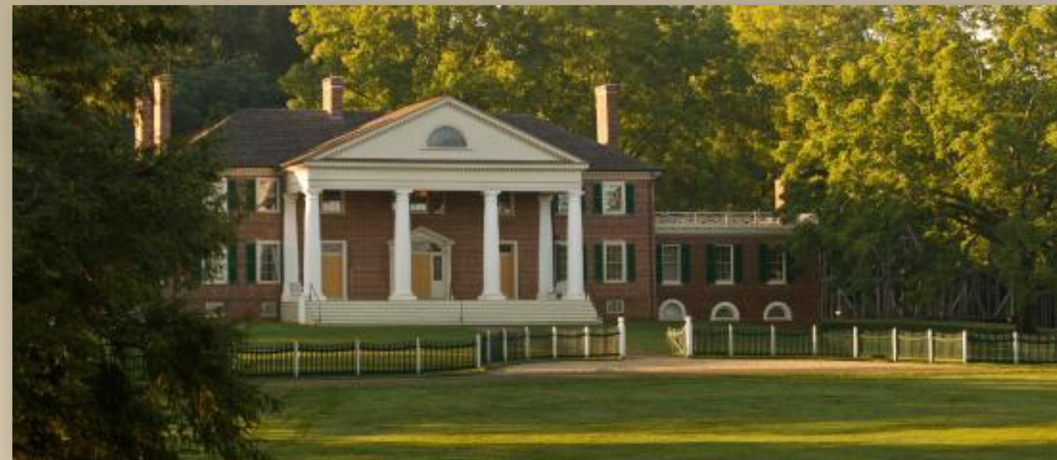
Figure 1: James Madison's Montpelier