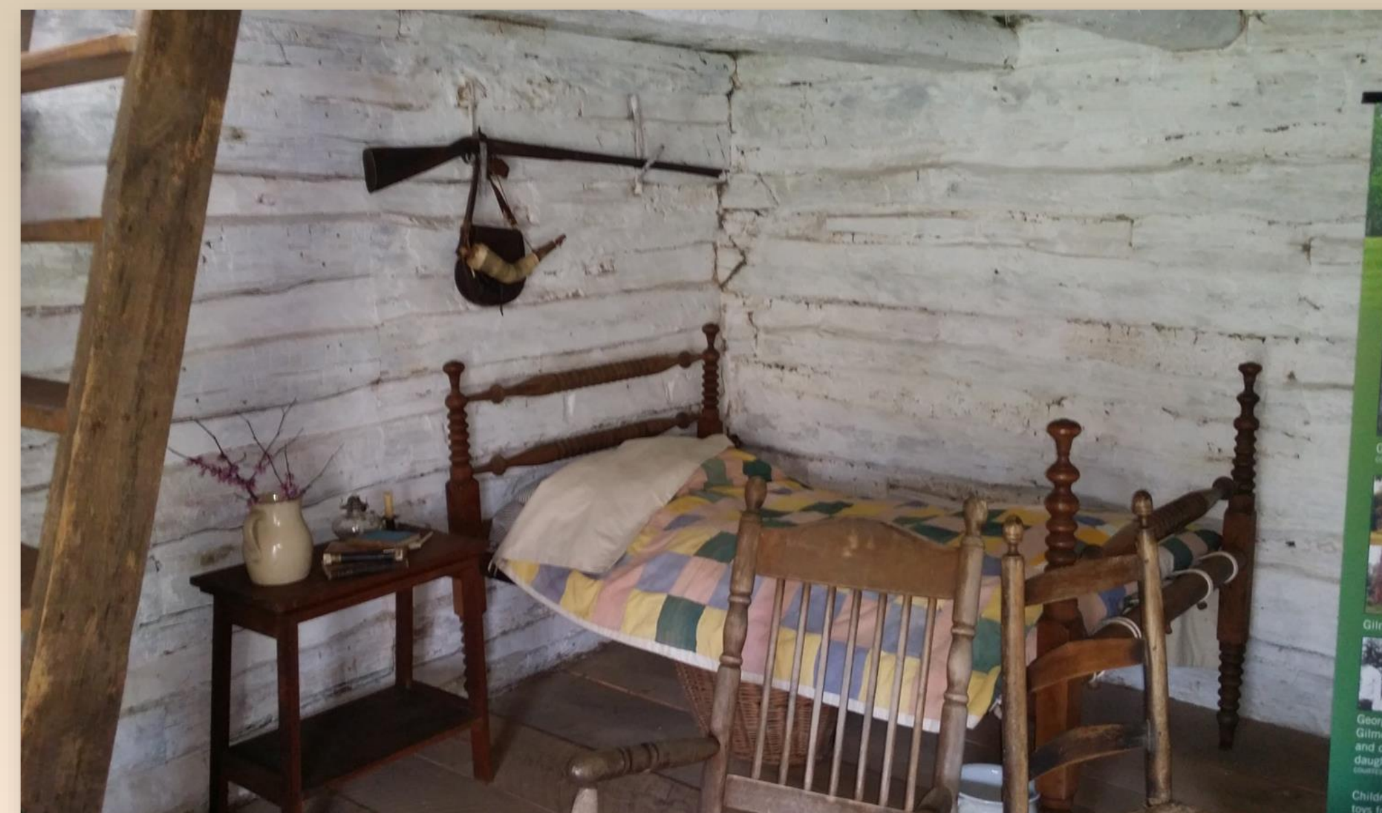
Figure 4: Gilmore cabin, interior

In the current economic system, labor is often forced through manipulation of employers, unpaid and underpaid work, physical and, or, mental labor not outlined or explicitly agreed upon. Members of the lower economic class, such as labor workers or unskilled trade workers are commonly susceptible to this treatment in the modern Western economic system (Yeoung 2013). In more extreme cases, individuals may be trafficked through physical force or intimidation and enslaved with no predictable chance of independence (American Civil Liberties Union 2017).