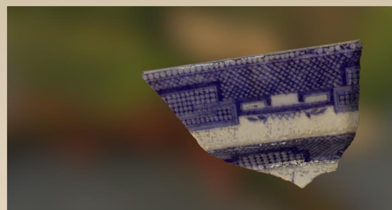
Figure 2: Blue Willow Rim, Virtual Curation Lab, VCU