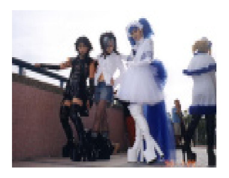
Fantasy Appropriation and Reproduction

into different shapes that can be barely recognized. Japanese comics, animations, and video games are dominating the texts, contents, and values of the fantasy world; they shape its social contexts, and direct its marketing flows. Its dominance has been drawing subcultural communities in Taiwan's popular culture closer to the Japanese comic/anime world than the one we live. It is also true that many adolescent fans tend to identify themselves with the comic/anime subculture rather than the mainstream culture. As Jenkins (2001) notes in his book Textual Poachers , the traditional notions of "culture" and "community" defined by classic anthropology is problematic and should be reconsidered from accounts of fan culture.