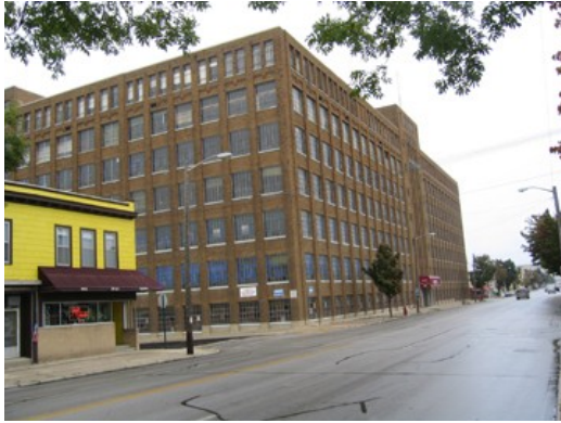
Former Mirro Main Plant sold for $200.00. Over 1,000,000 Sq. Feet

I was a visitor/voyeur in my own hometown. I drove around and documented industrial wastelands within the city limits. Former aluminum factories (on multiple sites), cement companies, shipyards, foundries were eerily quiet, ghosted testimonies to a rich working past. The former Mirro main factory in the center of the city sporting over 1,000,000 square feet had been empty for years and had been recently sold for $200.00. My hometown had the second highest unemployment rate in Wisconsin. Even churches were closing and consolidating. Former ways of doing economics and religion created ghosted neighborhoods. 4 My heart sank as I drove around. My hometown was just another one of those dying factory towns.