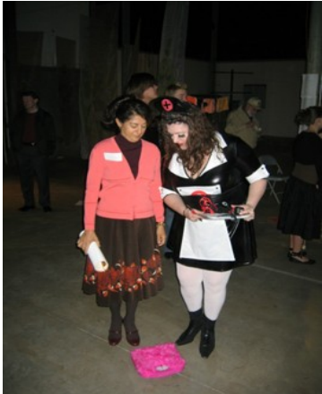
Genderland Performance, 2006

her with her scale. Dressed as an alternative nurse, she wrote their compliments on a nametag with size-positive websites and gave a piece of candy (a red hot) as medicine.