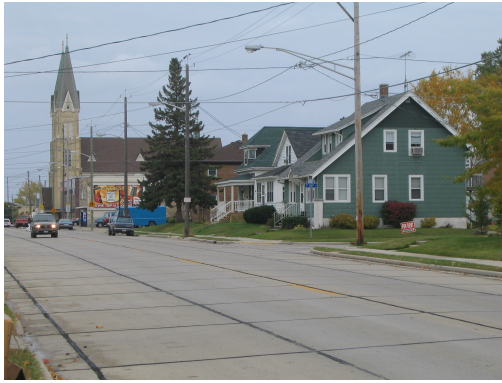
St. Mary's and my old neighborhood