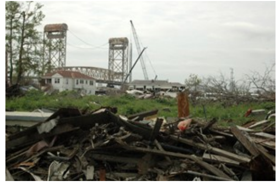
The Ravaged Lower 9th Ward 14" x 11"