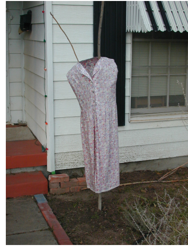
Sun Dress or In Honor of Working Class Women , 2002, 72" tall, mixed media installation

As an artist, I tried to capture some essence of white working class joy and struggle in the pieces Domestic Saints (2002) and Sun Dress (2002). In Domestic Saints , I honored with glitter sainthood to working class women in my life. Powerful and wise, they raised families and participated in local and church organizations. These women were matriarchs in their families, kitchens, basements and laundry rooms, in their sewing circles, raising children, and working outside their homes. Domestic Saints reveals the joys of friendship and community, in all places a kitchen. In Sun Dress or In Honor of Working Class Women , I used traditional fabric materials that would wear, tear, fade and disappear just like the lives of millions of working class women who remain nameless, invisible or forgotten. Physical and emotional struggle were never far from their lives. 5