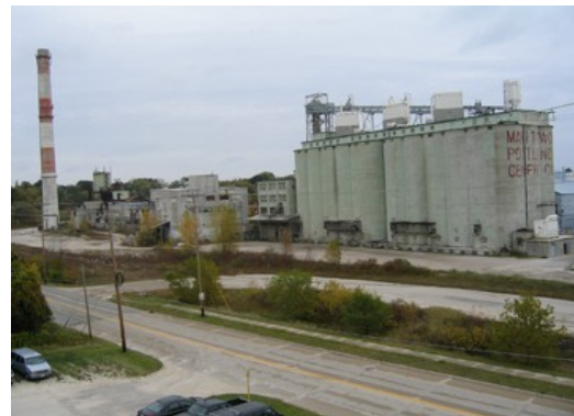
Former Portland Cement/Industrial Wasteland