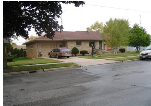
Uncle Newphrey's, Carpenter