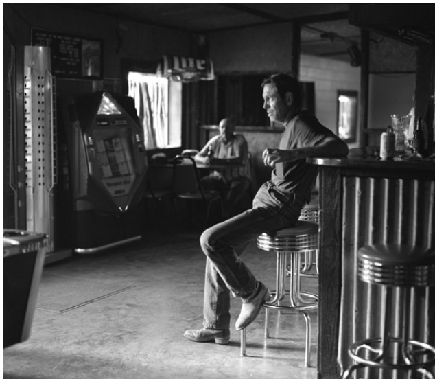
Charlie , 2006, 11" X 14," Silver Print

libraries and museums and especially academe. I recall political candidates in the 2008 national election addressing the struggles and hardships of the middle classes, as opposed to working-poor and working class groups that were truly struggling. Zinn (2007) reminds workers that “...both parties represented the classes that held most of the power in the country” (p. 147) and continue to do so today. If the United States had proportional political systems, there might be labor parties in this country. Oftentimes, labor unions and workers organizing are linked to mobs and mischief by the popular press. In schools, labor histories are often ignored or maligned. In September of 2009, when I asked an Introduction to Visual Studies class what Labor Day was, only one out of sixteen students knew. Most of the students thought it was a holiday to not work and shop. 6