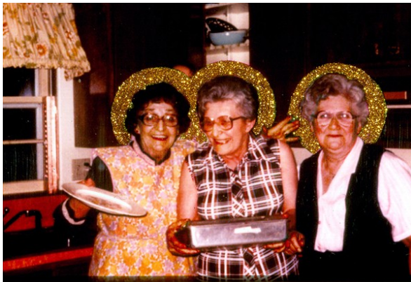
Domestic Saints , 2002, 5" X 7," collage