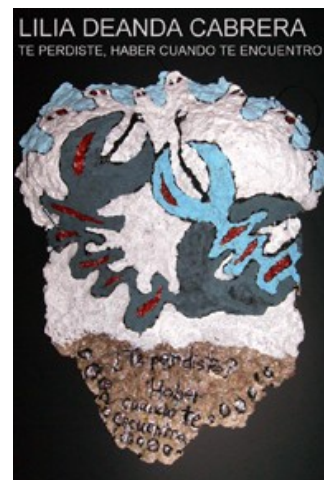
Te Perdiste, Haber Cuando Te Encuentro (You've been lost, hope to find you one day), 2008 Mixed Media: (Handmade paper cast of a woman's upper body), 18" X 22"

But it's been hard working and living in middle class environs where much is taken for granted. As colleagues return from summer research or holidays, they nonchalantly ask