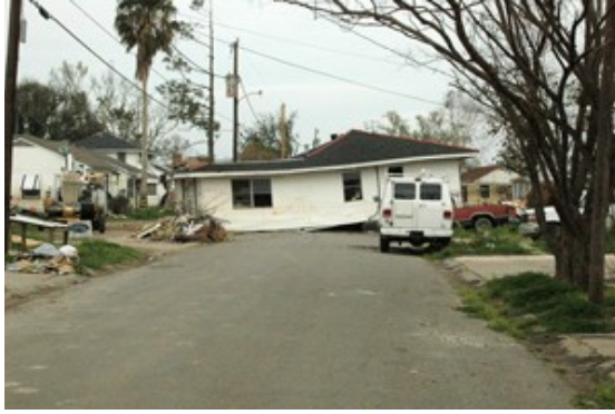
A Devastated Neighborhood 14" x 11"