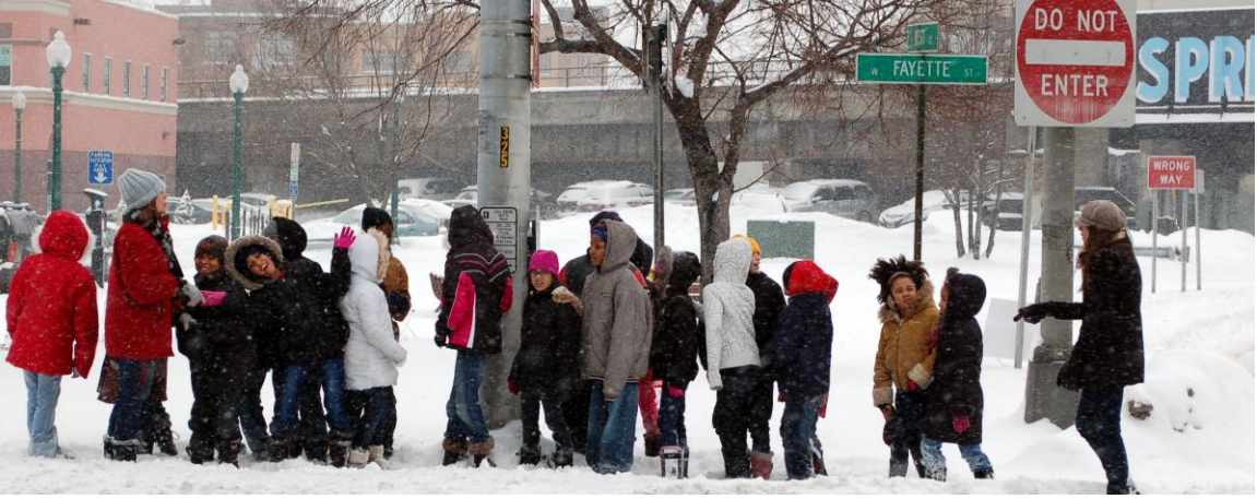
Figure 1. Body of possibilities.

The streets were not plowed. It was one of those lake effect blizzards that frightened school administrators enough to announce cancellations of afterschool activities before the school day was half over. Eighteen third grade bilingual (Spanish language) students and teachers climbed over snowdrifts and inched single-file through deep and narrow paths for a twentyminute journey to the art gallery. They were in the middle of exciting research and solidarity as they confronted the storm that transformed the group into a lumpy-butsinuous body of possibilities (See Figure 1). Their study involved an exhibit by contemporary artist Rigo 23, whose unique alpha-numeric name they might not remember, but whose work was all about the controversial life and imprisonment of American Indian Movement activist Leonard Peltier. They were working closely with community teaching artists to better understand how an artist was able to tell a life story and formulate a portrait without making traditional art objects like paintings or sculptures of his own. Rigo 23 organized information about Leonard: photos, newspaper clippings, some of Leonard's own paintings, and he synthesized the information over the framework of a timeline. He invited people to come into the gallery space and create their own artifacts, messages, and conclusions about American history and social justice.