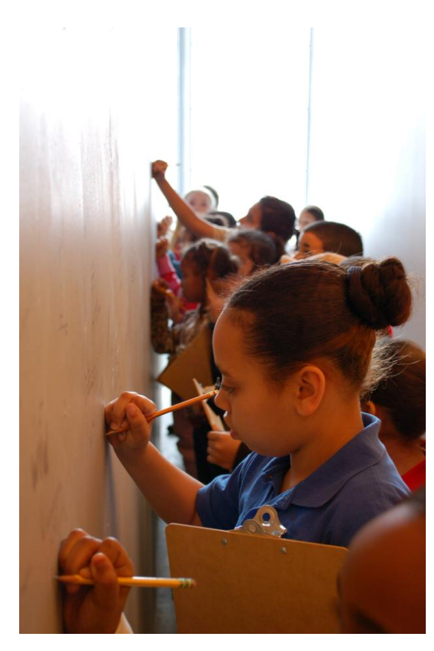
Figure 3. Sociocritical body.

Back at the gallery with the work of Rigo 23 and Leonard Peltier, everyone learned, not by performing as learners or artists, teachers or researchers alone, but by bringing shared and solo histories into the tiny and cramped space of an artistically reproduced prison cell (See Figure 3). They gathered visual, emotional, historical, and personal data in the traditionally privileged space of an art gallery. They walked together and constructed a relational timeline of events. The adults and children alike developed their own images of injustice and perseverance while they posed problems about fairness, race, poverty, and difference. Together they hatched theories about how someone can change the world from behind bars. Some students expressed concern and love for people who were unable to travel freely. Some adults confessed ignorance and fears about foreign places and practices. The roles of artist, learner, teacher, and researcher were juxtaposed and swapped, and an ecosystem of understanding was formed and unbound at the same time.