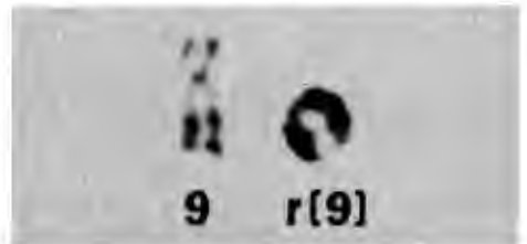
Figure—(Top left) Pedigree of the proband. (Bottom left) Proband's karyotype, showing the ring chromosome (9) (arrow). (Top right) Photograph of proband and mother. (Bottom right) Partial karyotype of proband's mother, showing the familial ring (9) (Chromosome magnification, \times 4000 ).

the rarity of familial ring chromosomes. De novo ring chromosomes have been described in all chromosome groups in man, 1 but familial transmission of rings has been limited to chromosome 17, 2 chromosome 18, 3 chromosome 21, Palmer et al 4 and by E. Engel, MD (oral communication, May 1977), and a G-group chromosome not identified by banding analysis. 5