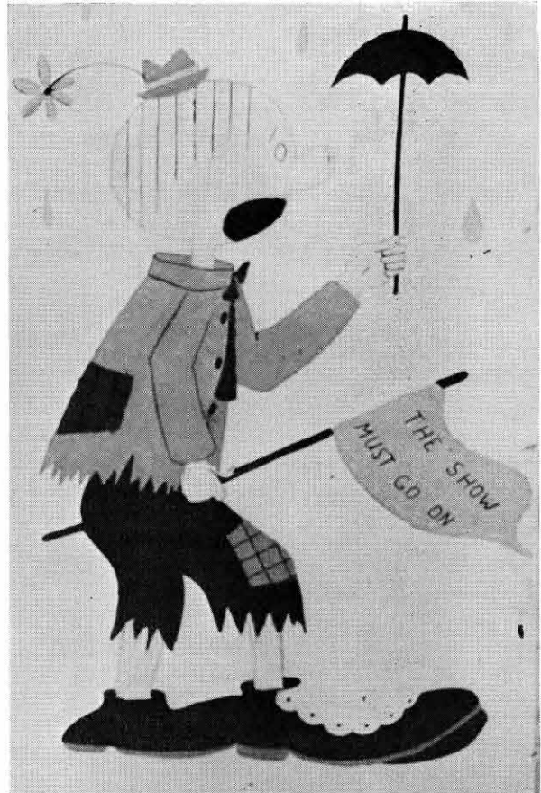
Fig 8—Drawing by a patient with Hodgkin's disease. Note the message on the flag; hope is important.