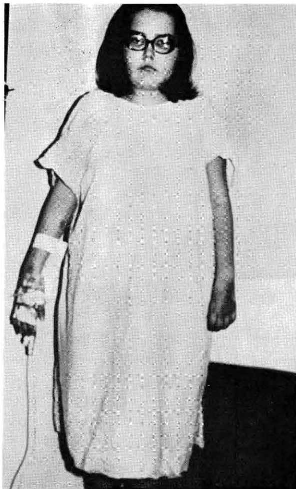
Fig 5—Prednisone therapy causing cushinoid appearance in girl with leukemia.

Death is a very personal matter and yet the patient must feel his physicians will not abandon him—will not let him suffer pain or isolation. Many want to be at home in familiar surroundings, and members of the staff visit them at home. Many have asked that their bodies be donated to science and feel that in some way they have contributed through their ordeal of