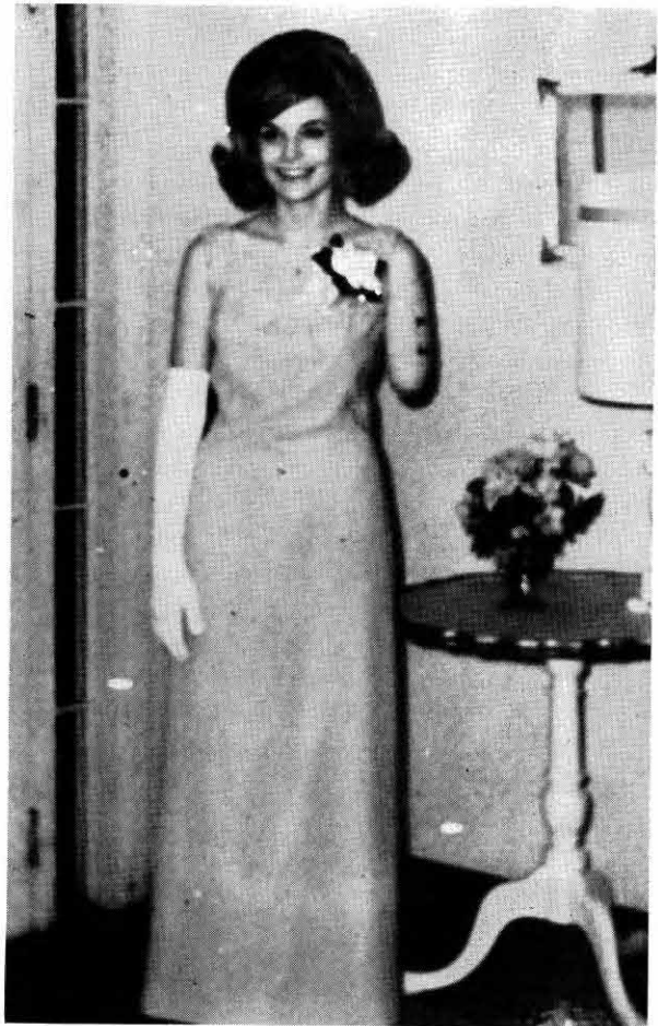
Fig 3—17-year-old girl with both hair loss and amputation. She made an excellent adjustment, with help from her family and boyfriend, and is shown with her wig, on the way to the Senior Prom.

The attitude of the parents may be reflected in the adolescent's attitude toward his illness—the well adjusted parents who are eager to aid the physician in the total care versus the frightened or overprotective parents. Pre-existing distrust between the patient and parents or other authority figures may manifest itself in rebellion and resistance to staff and therapy. In general the adolescent must realize his physician is honest, interested, available and willing to spend time talking and listening. We should find out what is "bugging" these patients the most. Often other symp-