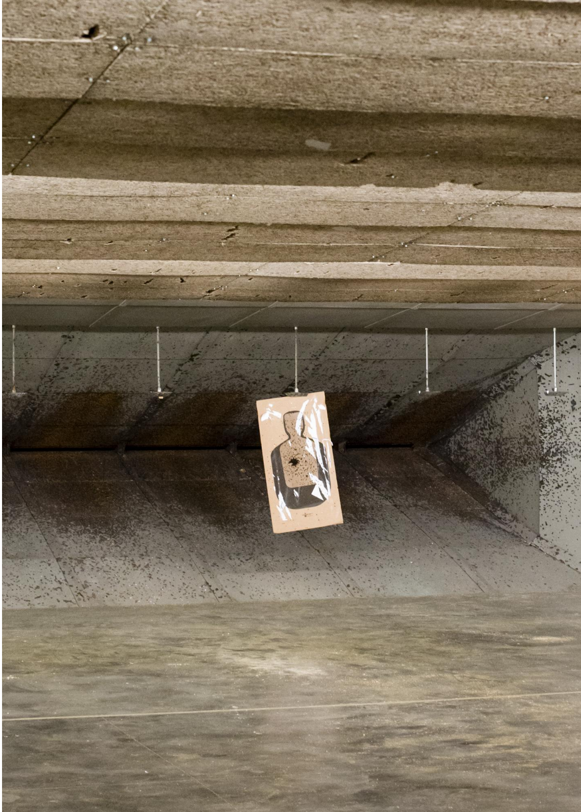
Fig. 5: Alex Matzke, Confirmed kill , 2015. Archival inkjet print. 26.5x38 in.