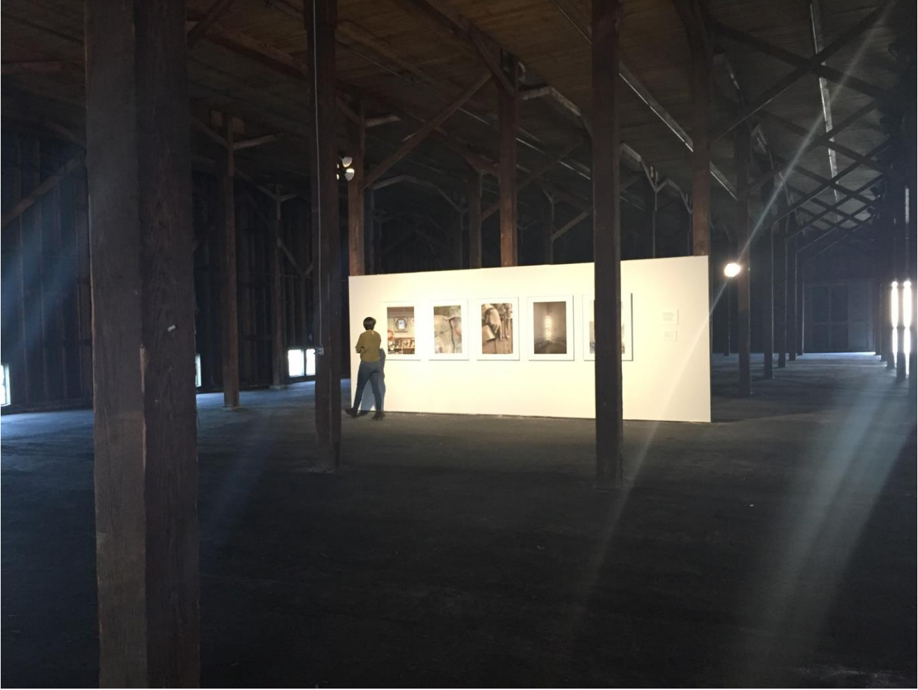
Fig. 9: Alex Matzke, Candidacy installation. 2015. Drywall, wood, and finishing materials, 8x19 ft.