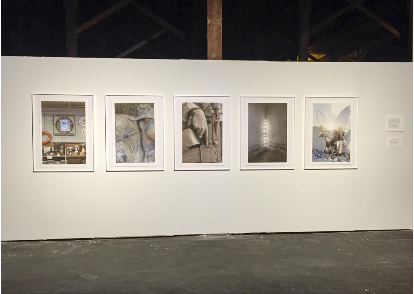
Fig. 8: Alex Matzke, Candidacy installation. 2015. Archival inkjet prints, 24x30 in.