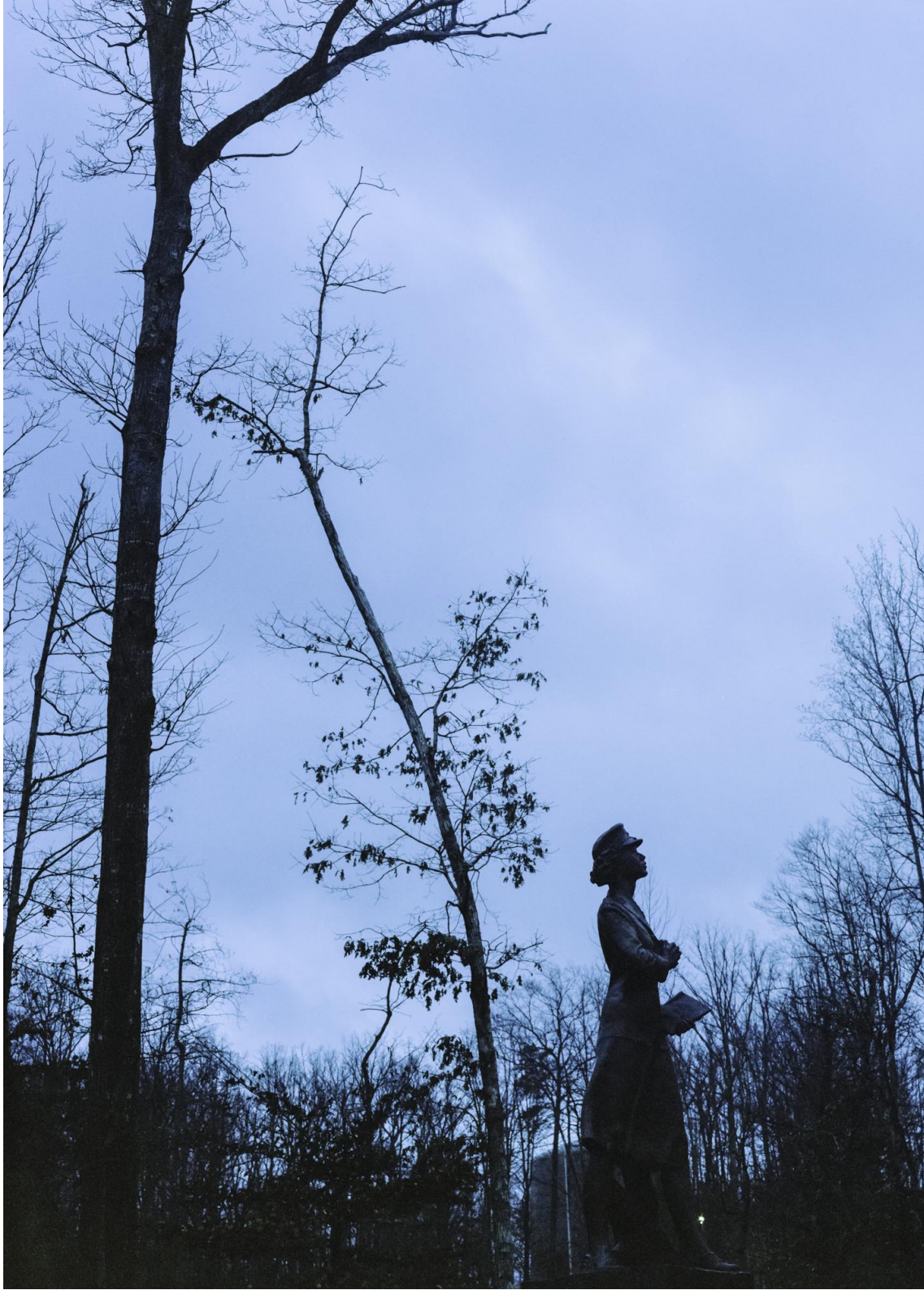
Fig. 7: Alex Matzke, Molly the Marine , 2015. Archival inkjet print. 26.5x38 in.