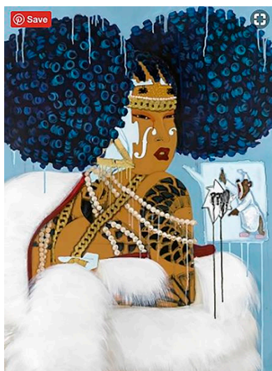
Figure 2. Rozeal. Untitled. 2016.

identities (Abiko 2003; Anderson 2007). Utamaro's work differed from others of that time, featuring women in active roles and having a level of agency (Anderson 2007). Some of Rozeal's paintings mirror specific paintings by Utamaro, and like Utamaro, depict women as determiners of fashion, engaged in personal activities (Anderson 2007). Rozeal expands on the theme of women as independent subjects of the art, rather than depicting women in service to men, showing female subjects, often in quiet moments with other women (Figure 2).