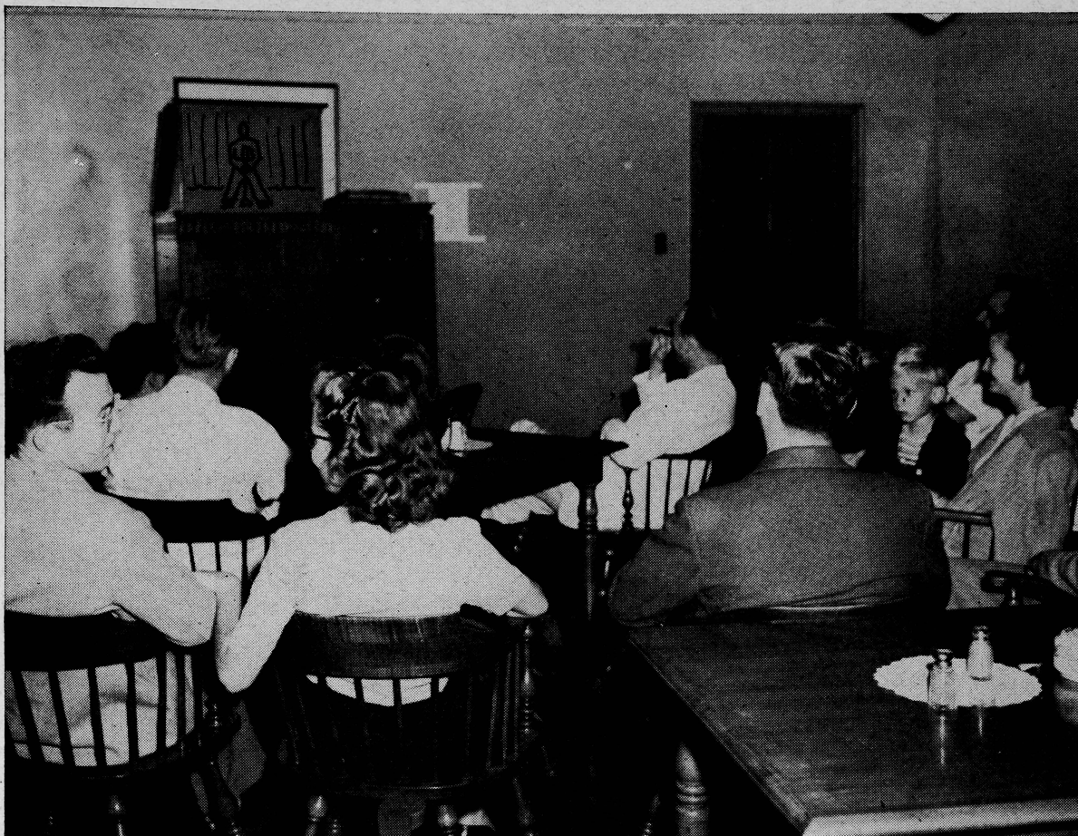
Members of the house staff and their families are enjoying the new television set recently installed in Hunton Hall. In addition to providing their favorite televised programs, it furnishes delightful dinner music in the dining hall, since it is also a combination radio-phonograph.