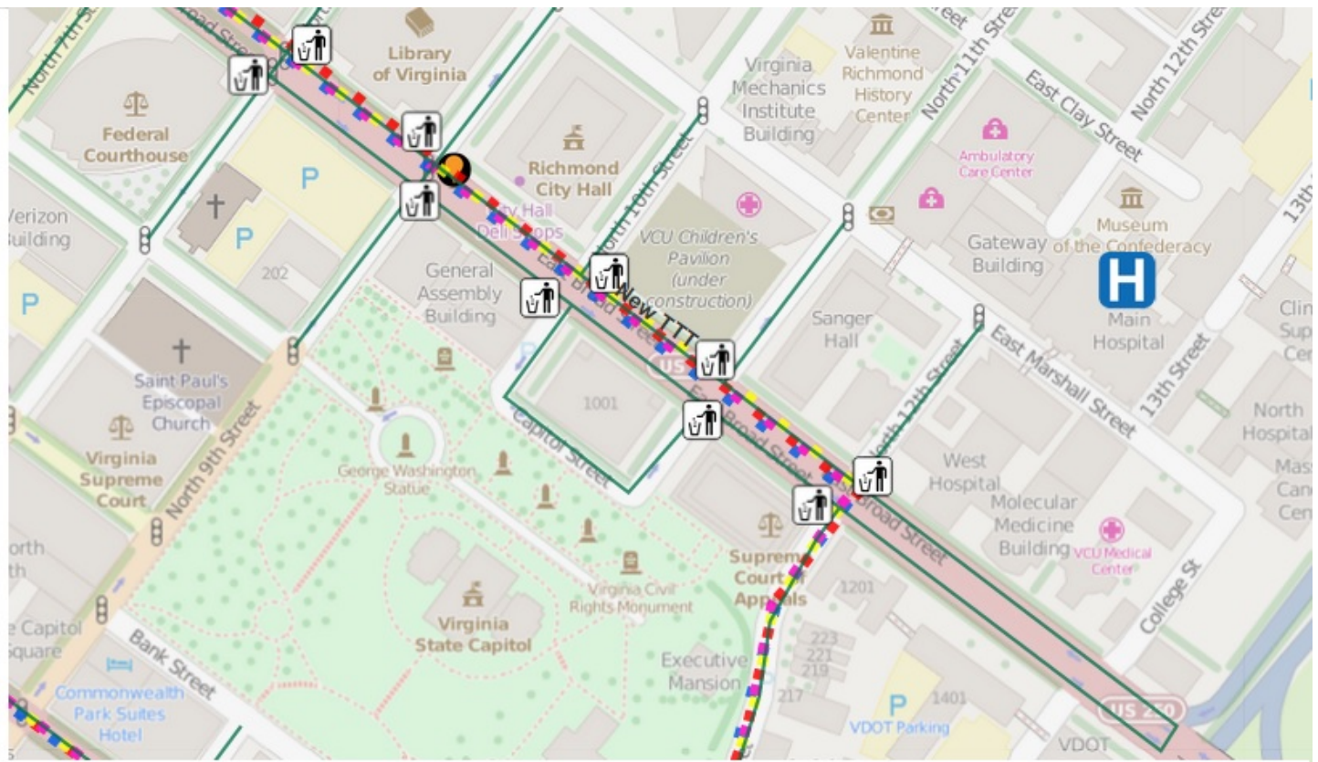
ArcGIS MAP Image 1 : The pictured image displays data sets regarding established fan zones, street closures, the location of Eco-stations and emergency service, as well as the cyclist's course specific to the day's event.