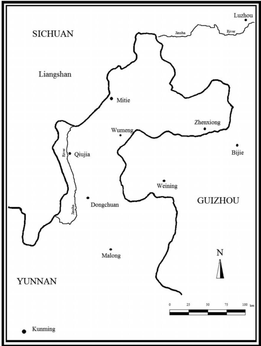
Northeast Yunnan, ca. 1730