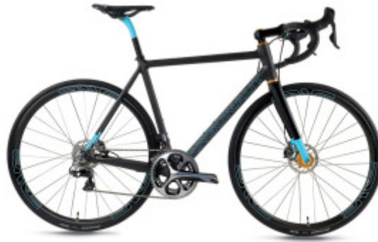
Argonaut Spacebike 2.0 ($13,720)

Still I would like to hope that there will at least be a little more diversity in the crowd of spectators. This is a great opportunity to bring people in from different parts of the US and to show of Richmond, not just to the world, but also to the US population. I hope the crowd will have lots of people from different parts of the country enjoying the race and the festivities that will be going on. I hope that the international crowd will enjoy it too. I think that the plethora of Western Europeans coming will at least be able to appreciate and enjoy the many preserved historical sites in and around Richmond. I genuinely hope the crowd will be more diverse than what I expect, but we'll see once the BIG race starts.