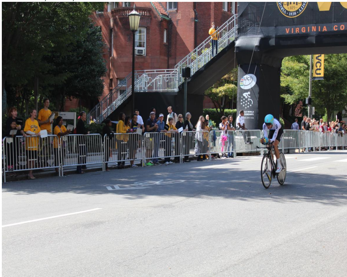
Look at all those people not there.

Classes being cancelled was a good call. I think, perhaps, it would've been too crowded if everyone had stayed and tried to go to class like normal. Parking for sure would've been a nightmare. But scaring people into making like a tree and leaf-ing was probably too extreme of a reaction. It was nearly always empty up by campus (most of the action was from 5th to Governor's along Broad) and the day VCU tried to hold an event to get students to come out and crowd along Franklin Street it, well, looked like this: