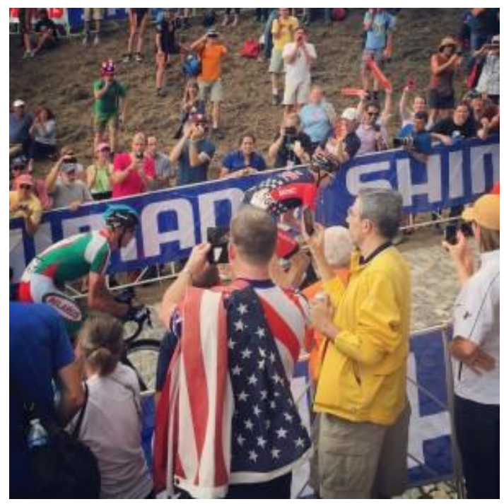
Posted on October 1, 2015

attention than the trial runs and competing juniors. Another factor that is important to recognize, is that a lot of the attention for the race is based at the finish line. From what I was able to see, a good amount of people were watching along the course, but I feel that its safe to assume the biggest crowd was located down by the finish line at 5th street in downtown. Something I didn't think about until just now that most likely explains the reason for the low amount of people I witnessed initially is the few locations I chose on those specific days. Some of the locations I chose in the beginning, when I didn't see as many people, were not as popular as the places I went to later on in the race, for example like Libby Hill.