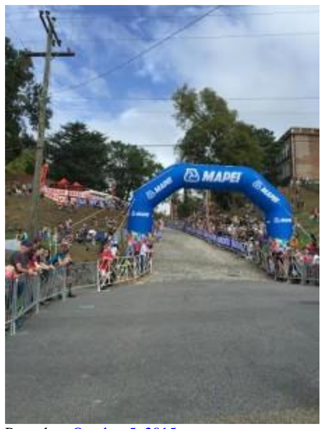
Posted on October 5, 2015

interview and data collection process. So what initially started as something that gave me anxiety, ended as an insightful and positive experience.