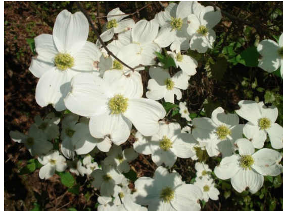
Each tree’s reproductive output was measured based on seed production.

“...It is imperative that we continue to raise awareness about the importance of maintaining the plant diversity within the city as it continues to grow. We do not want to destroy our beautiful ecosystem as we grow as an urban epicenter,” she said.