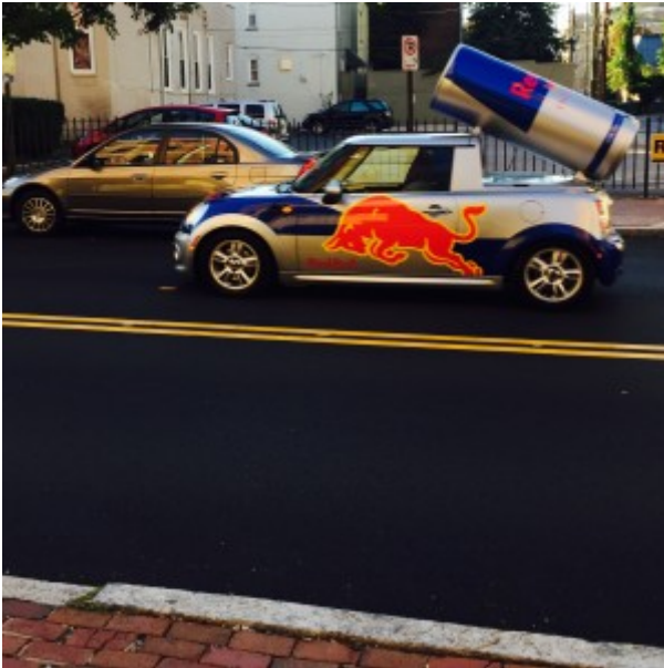
The Red Bull Car driving down Harrison Street on the VCU campus on September 17th.