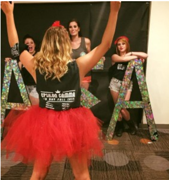
Some of the sisters of Alpha Sigma Alpha, Epsilon Gamma Chapter, having fun before Bid Day to welcome their new Fall 2015 pledge class.