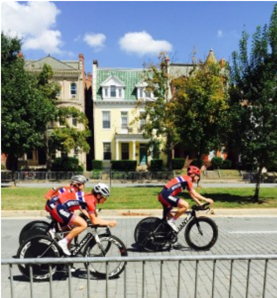
On Monument Avenue, cyclists ride by the whimsical row houses and get a taste of what Richmond is like.