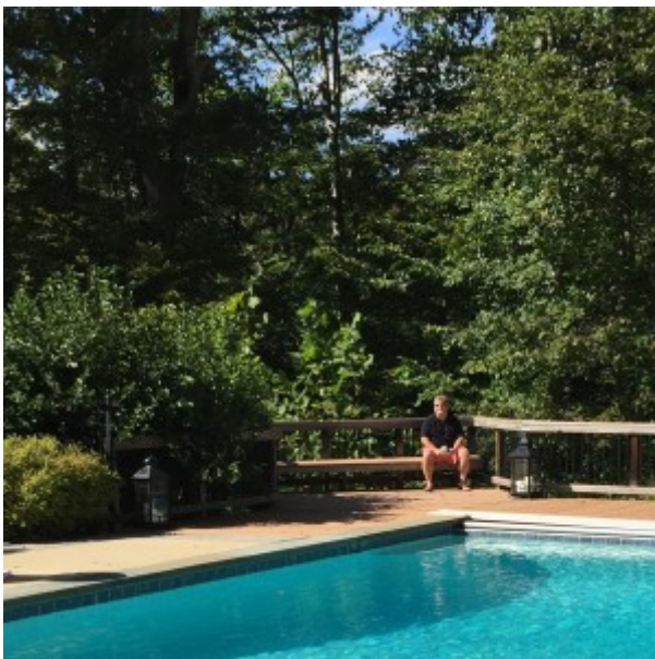
Donald Cairns relaxing by a family friends pool on Sunday, September 13, 2015.