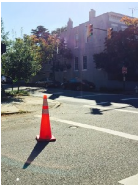
Blocked off streets and construction have become the norm in the City of Richmond due to the upcoming UCI World Championship Bike Race beginning Friday, September 18.