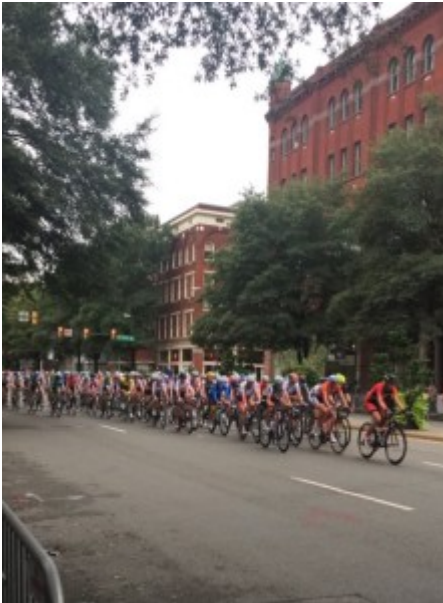
In front of the VA Repertory Theatre on Broad Street, cyclists go by for the spectators to enjoy on one of the last days of the race.