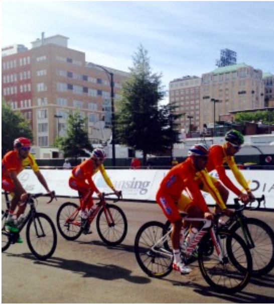
On Broad Street, cyclists can be seen riding along with the skyscrapers in the background.