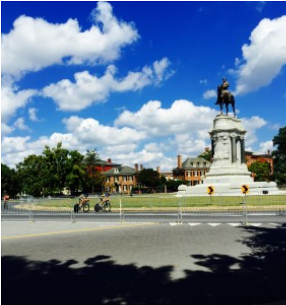
Cyclists riding in front of the Robert E. Lee statue on Monument Avenue.