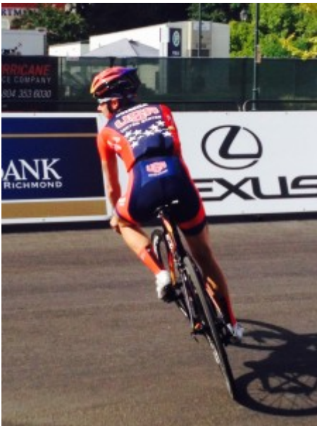
A member of the USA Women's bike team poses out on the race course.