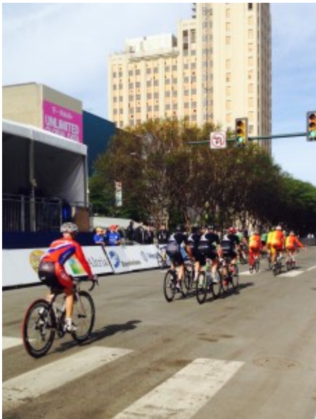
Broad Street was one of the main drags for the bike race as you can see cyclists riding down it with their teams.