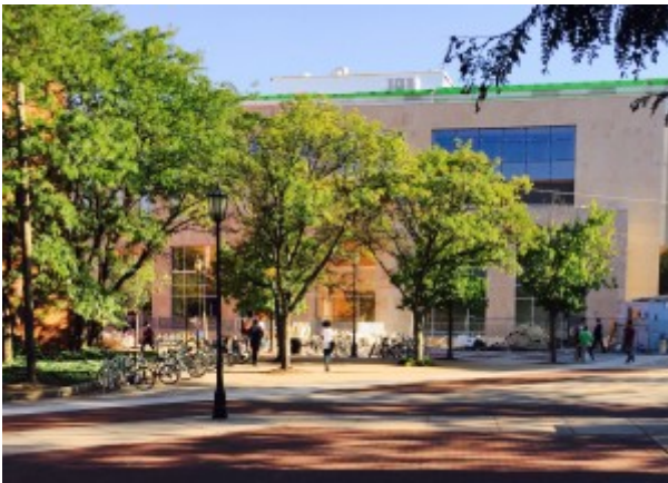
The view from The Knoll, outside of the VCU Singleton Performing Arts Center, over looking the Cabell Library.