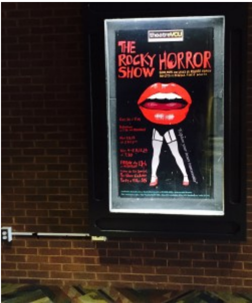
Inside the Singleton Performing Arts Center Lobby, The Rocky Horror Show's poster is up outside of the Hodges Theatre promoting it's performance dates. The show opens Halloween weekend and runs until mid November.