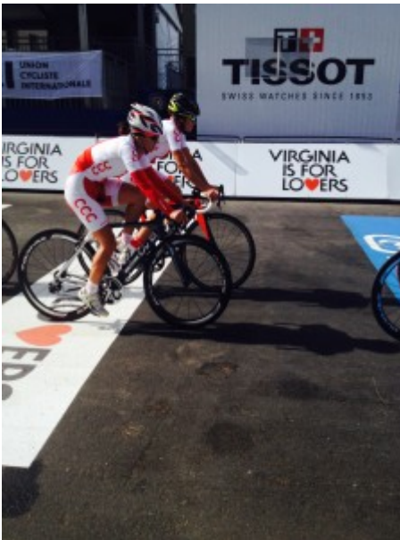
Cyclists from the CCC team ride together on Broad Street during the time trials.