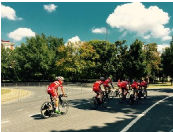
Teams practice together on the first day of the bike race, feeling out the track on Monument Avenue.