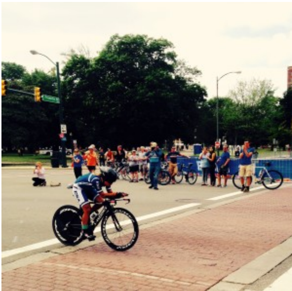
A lone cyclist rides by patrons of the bike race as they cheer them on.