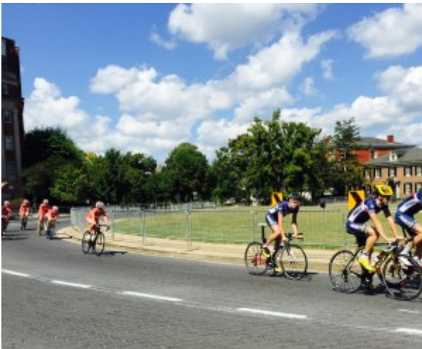
Cyclists during the team training on September 19th come up behind one another on Monument Avenue.