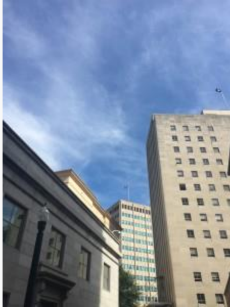
Buildings along the Capitol Square before the area is flooded with people for the bike race.