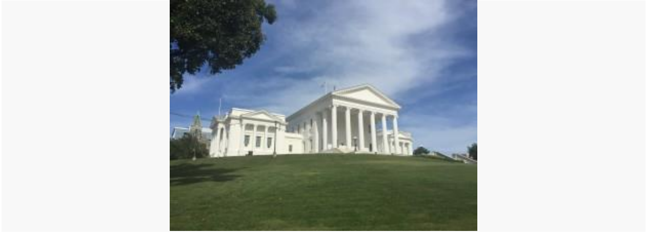
The Virginia State Capitol building as the city prepares to be invaded for the bike race