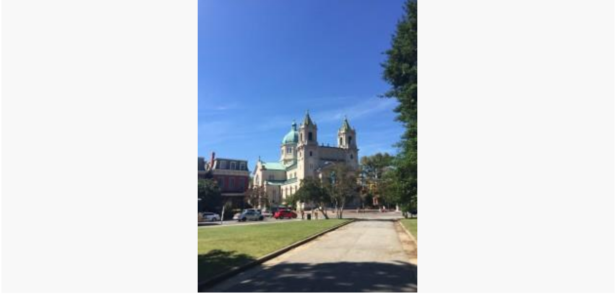
The Cathedral of the Sacred Heart as seen walking through Monroe Park