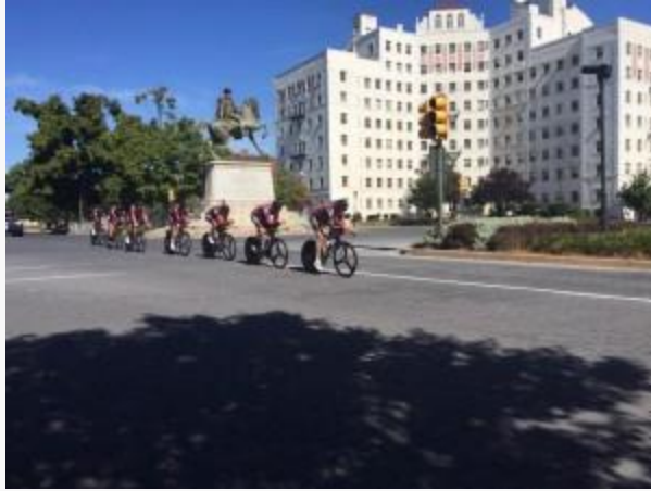
The BMC Racing Team training for the Team Time Trial along Monument Ave