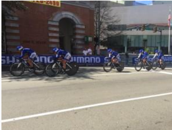
The Women's United Healthcare cycling team passing down Main St. during the Team Time Trial