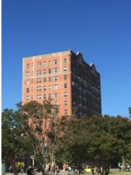
Johnson Hall Towers above its surroundings as seen from Monroe Park