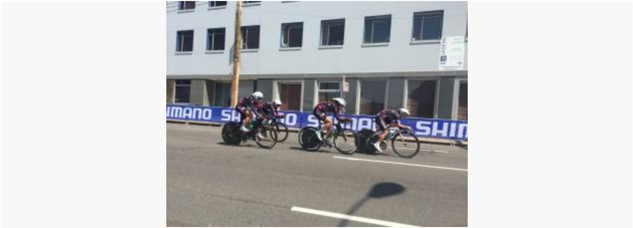
BTC City Ljubljana rolling down Main St. during the Team Time Trial