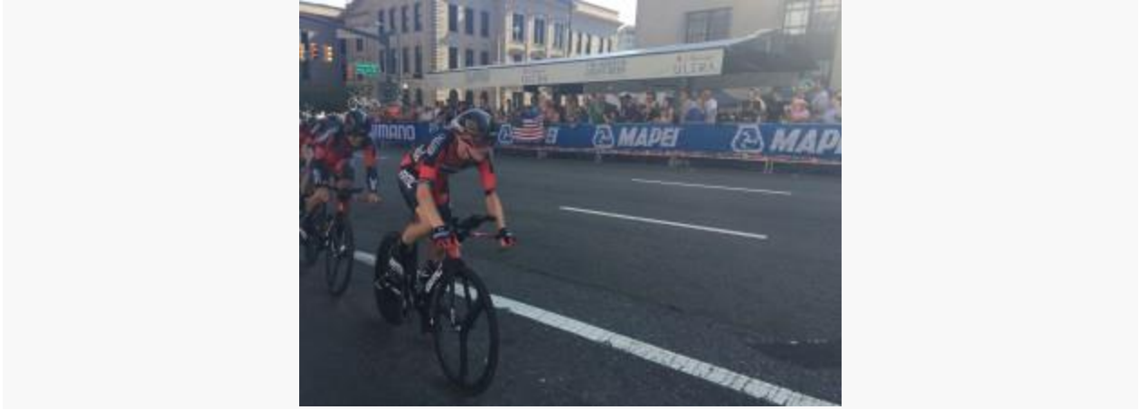
The BMC Racing Team turning off Governors St. onto the home stretch