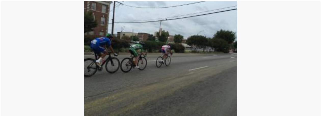
(From left to right.) Davide Martinelli, Eddie Dunbar, and Jose Luis Rodriguez ride down Belvedere during the Under 23 Road Circuit