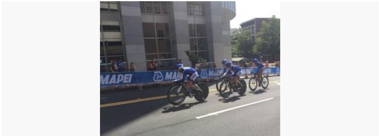
The Women's United Healthcare cycling team starting the climb up Governors St. during the Team Time Trial