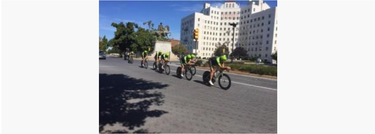
The Cannondale-Garmin racing team training for the Team Trial along Monument Ave