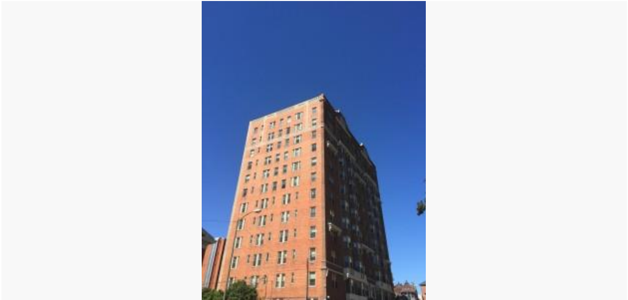
Johnson Hall Towers above its surroundings