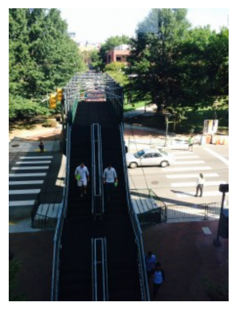
Great for those ambulating on two feet. Wheelchair crossings are designated elsewhere on the course.