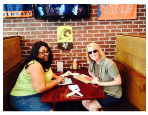
Other things Richmond hopes all visitors enjoy include the city's noted restaurants,