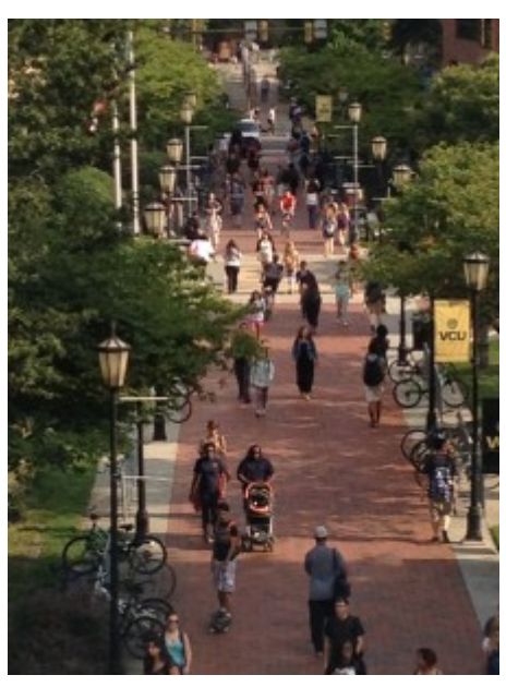
Pedestrian traffic flows on Linden St. near the Student Commons.