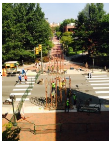
Ciao for now.