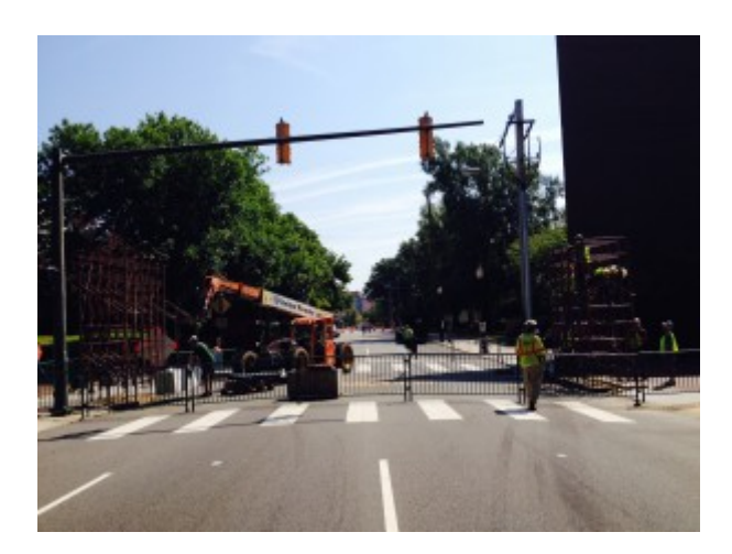
West Main Street is closed to traffic for two days so a pedestrian bridge can be assembled.