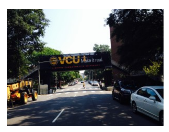
The VCU logo on the bridge is something the city hopes all visitors notice.