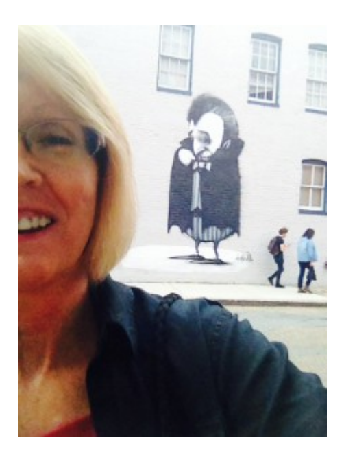
the city's street art, and