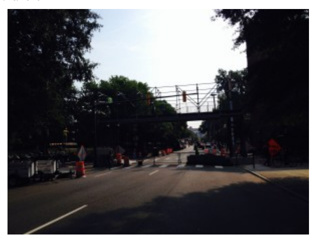
Day two of pedestrian bridge construction shows is underway.