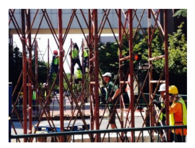
Workers assemble the framework for the pedestrian bridge over West Main Street.