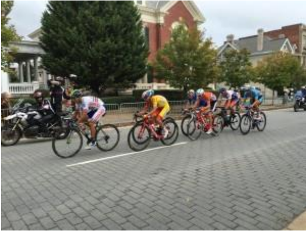
The lead group with 2 laps to go