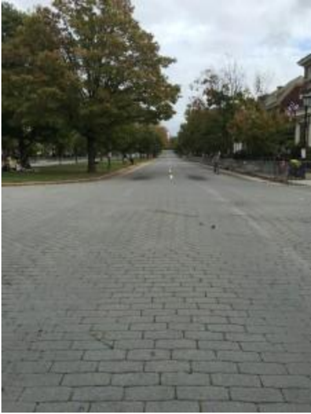
Monument looked cool so empty