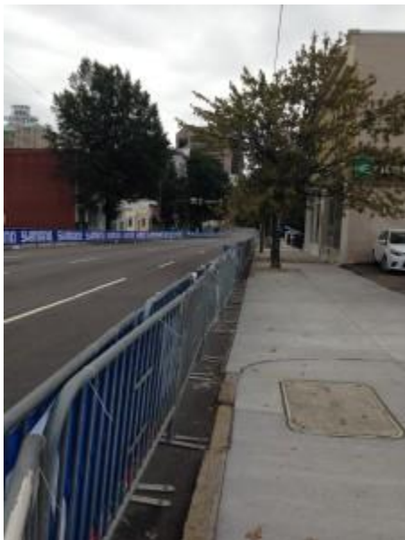
Main Street looking super cool ready for the racers