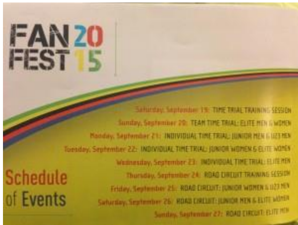
Schedule of events