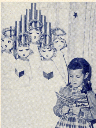
Christmas Party on Pediatric Floor MCV Hospital.