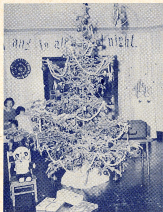
Christmas Party on Pediatric Floor MCV Hospital.