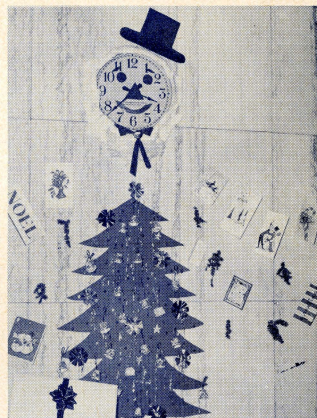
Novel Christmas Decoration on the Fifteenth Floor MCV Hospital.