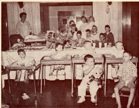
An Easter party on the ninth floor MCV Hospital was sponsored by the Thomas Jefferson Junior Woman's Club. This club has conducted a play-therapy program for hospitalized children for the past two years; it has been one of the outstanding contributions to the College.