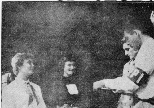
APPREHENSIVE RATS - Two rats look apprehensively at upper classmen who inspect them for violation of rules during Rat Week.