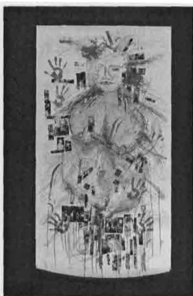
Wargoddess: Shock & Awe