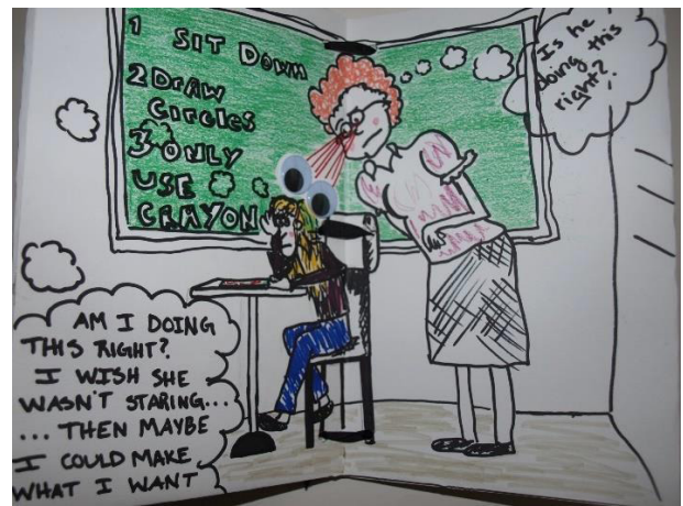
Figure 1. Pre-service student’s image of “who should I be?” vs. “who am I?” illustrated in early memory of artmaking.

I invited students to begin the autoethnography by telling their own stories of teaching by recalling a memory of art learning/making, including details of how the teacher positioned them as a learner and how they positioned the teacher. I used this autoethnographic approach of beginning with personal reflec-