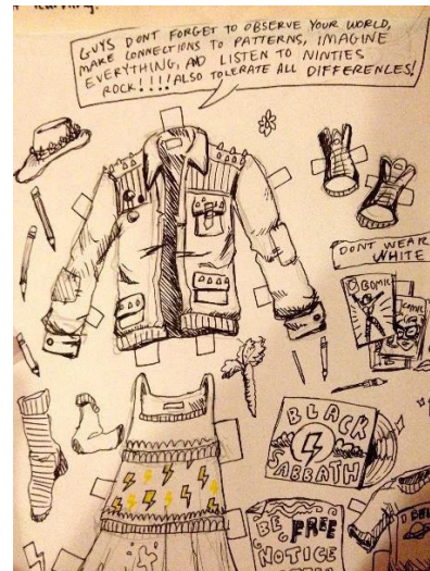
Figure 2. Pre-Service teacher paper doll celebrating self and other.

These choices in play, followed by the creation of their dolls, performed identities that would impact their role of teacher. Students could also undress themselves from fashions that impeded their abilities to see teacher and learners beyond stereotypical views. This interplay between revealed and concealed meanings enacted Derrida's (1993/1994) notion of "re-visiting, re-remembering, re-conceptualizing, and representing knowledge from the past...whereby someone or something invisible...becomes other than what we already know" (Derrida, 1993/1994, pp. 100-101). This is integral to autoethnographic research where self-study involves study with others because collage acted as a site to critically engage or deconstruct culturally held beliefs of what it means to be teacher. What follows are examples of dolls created by pre-service teachers and how their clothing and background created sites of resistance and possibility.