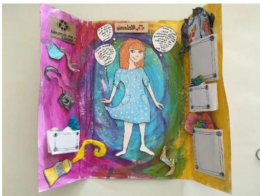
Figure 3. Pre-Service teacher paper doll featuring paint tube as a symbol for spirituality.

Some paper doll projects took the form of closet spaces, where dressing up meant a plethora of cloth-