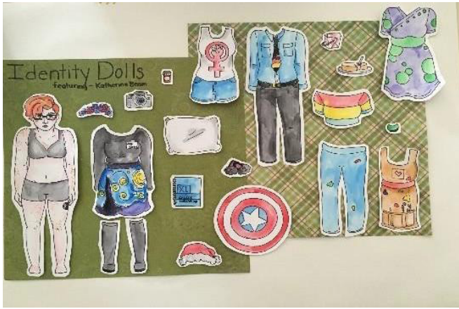
Figure 4. Pre-Service teacher paper doll featuring pillow related to depression and t-shirt on lesbian pride.

getting out of bed in the morning which is why a pillow is included in her piece. At other times, she would like to be home alone eating pie and Chinese food (see Figure 4). She is concerned about how her anxiety might impact the challenges of working with large numbers of students in a school setting.