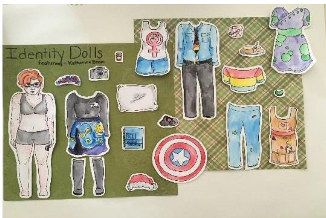
Figure 4. Pre-Service teacher paper doll featuring pillow related to depression and t-shirt on lesbian pride.

getting out of bed in the morning which is why a pillow is included in her piece. At other times, she would like to be home alone eating pie and Chinese food (see Figure 4). She is concerned about how her anxiety might impact the challenges of working with large numbers of students in a school setting.