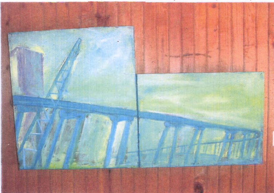
4. TO HATTERAS, OIL ON BOARD 23"x48", 2005