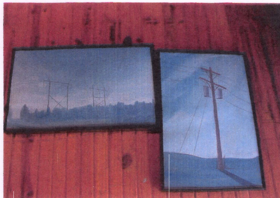
5. INTERRUPTED SKIES, OIL ON BOARD 28"x34", 2005