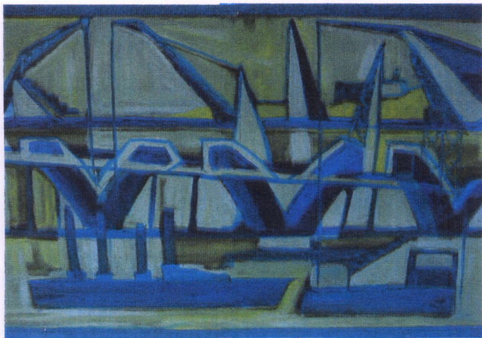
3. UNDER CONSTRUCTION, OIL ON CANVAS 24" X 36", 2005