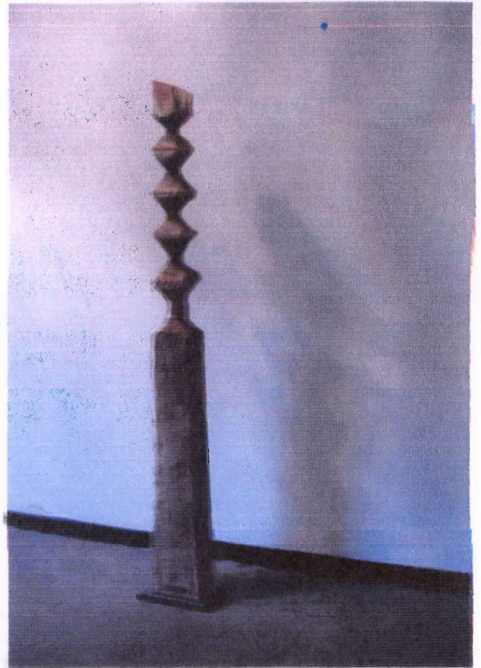
7. TO TIMBUKTU, CARVED WOOD AND COPPER, 16" X 87", 2005