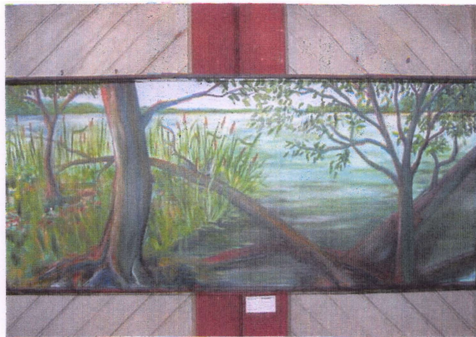
1. ON THE POTOMAC OIL ON CANVAS, 24"x48", 2004