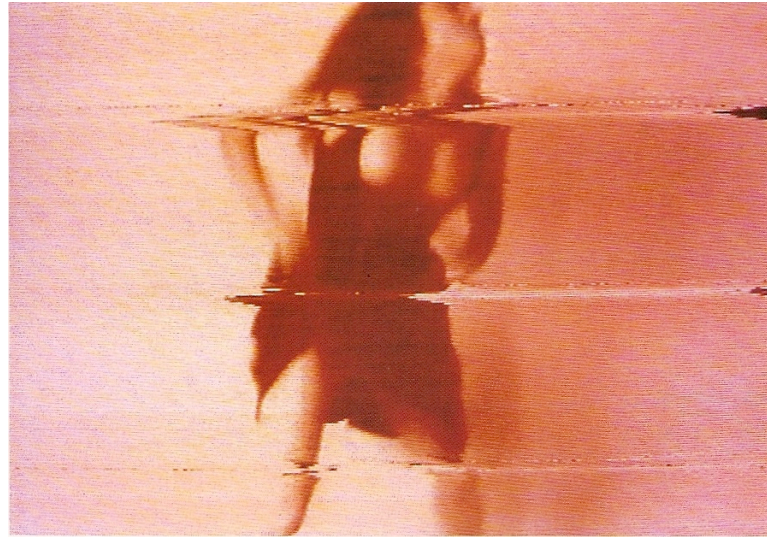
Figure 10: I'm Not the Girl Who Misses Much . Pippilotti Rist. video still. 1986

This body of work is hinged on my appetite for self-discovery. In the same way that Pippilotti Rist embraces self expression and exhibition by performing for the camera in I'm not the Girl Who Misses Much I have found through the recording and editing process, a place of expression allowing me to