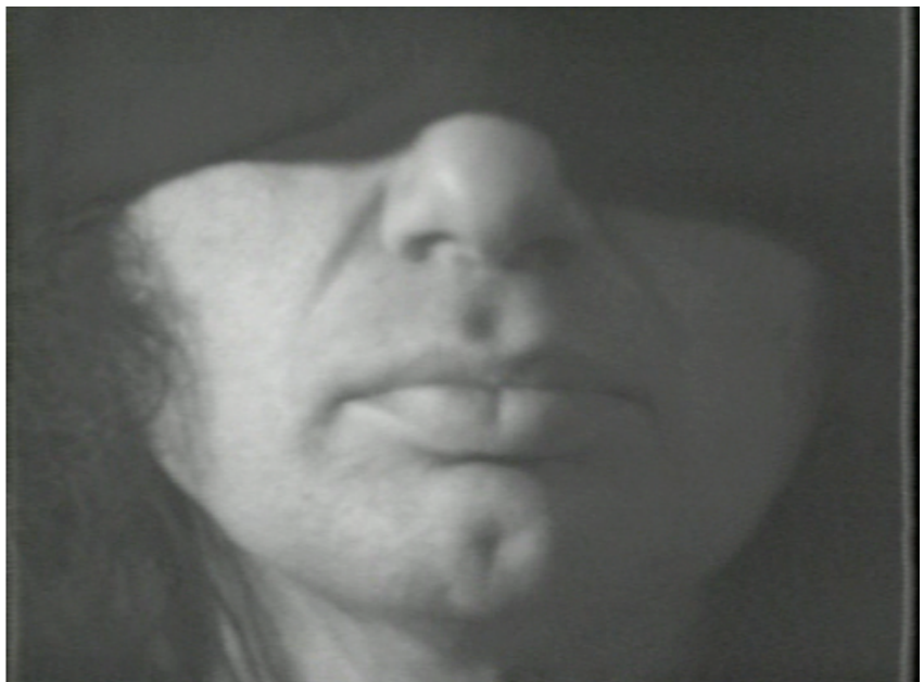
Figure 6: The Red Tapes . Vito Acconci. Video still. 1977

I look to the work of experimental film and video artists such as Vito Acconci, Joan Jonas and Ana Mendieta. These artists pioneered the use of video and sound in an art