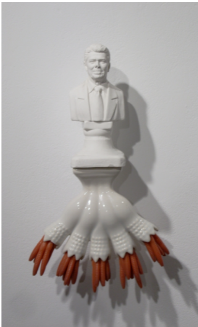
Figure 2: Trickle down . Found objects. 2008.