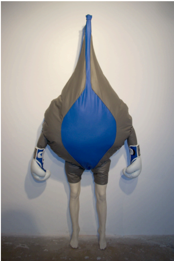
Figure 3: You are a Fighter . Vinyl, porcelain, boxing gloves, polyester. 2008

In my first winter of graduate school I continued making objects and began making casts of my body as well. I made molds of my legs and cast porcelain replicas. I used the legs as a symbol of insecurity and fragility paired with the extreme opposite, a boxer. I fired the porcelain to cone 5 (2185°F) causing the