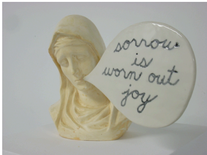
and Figure 1: sorrow is worn out joy . Found object, porcelain. 2008.

was accepted into this program with plans to continue exclusively using this medium. In the beginning I was determined to push myself with this medium in new ways. I assumed being in a new and different place would nurture new ways of focusing on experience, emotion, mediation and the human condition in my ceramic work. This graduate program did allow me to do that; however I realized that my work and my goals were being limited by my medium.