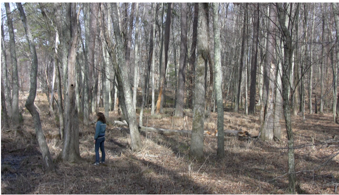
Figure 11: New . Video still. 2009

It is a confusing mental space and it is through my work in The Pocahontas State Park Series that I study my own psychology of consciousness in relation to physical surroundings, specifically a forest that is thought to be the land where in 1613, Pocahontas was held captive by the English. This series has been the documentation of a search for “self” and an examination of emotional confusion and development as it was happening in my personal life. Through recording and examining emotions and actions out of context I am creating experiences in which the tender and sincere attempt exists but it is ineffective, naive and pathetic. It is within the nebulous dynamic of this relationship that meaning and humor emerge.