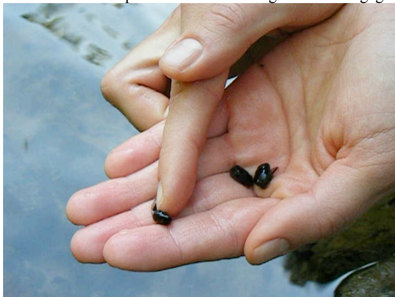
Figure 5: Tad . Video still. 2008

I continued making videos throughout the