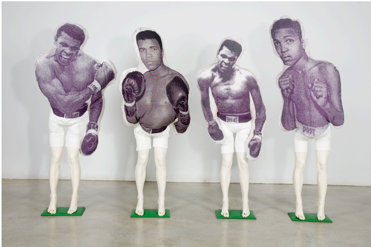
Figure 4: Self Portrait as Muhammad Ali #'s 1,2,3 and 4. Porcelain, vinyl, cotton, fabric dye, polyester, steel. 2008

For my candidacy exhibition I created four three-quarter sized figurative sculptures. I juxtaposed a soft, digitally printed, pillow version of boxer Muhammad Ali with hard porcelain casts of my legs. These pieces evoked my frenzied psyche at the time. My feelings were a mix of fragility, competitiveness, sensitivity, unaffectedness, boldness, greatness, insecurity and confidence. The Self Portrait as Muhammad Ali series was different from past work, not only in scale, but also in content. They represented specific sides of the fickle nature of personality, specifically, my personality. All of these "selves" could exist within me at any time. I began to reveal and literally expose myself within