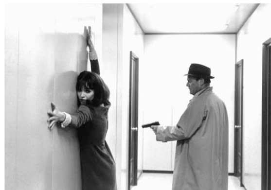
Figure 12: Alphaville . Film still. Jean-Luc Godard. 1965