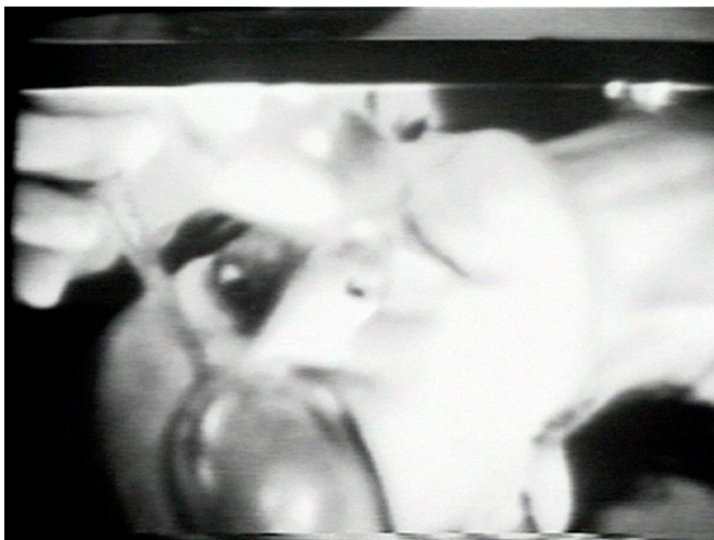
Figure 7: Vertical Roll . Joan Jonas. Video still. 1972

Jonas establishes her presence with her audience through the violent, repetitive, banging of a spoon. The sound seems to move the screen as the picture malfunctions and “rolls” to the top of the screen only to be replaced simultaneously by the same image of the live feed. By involving