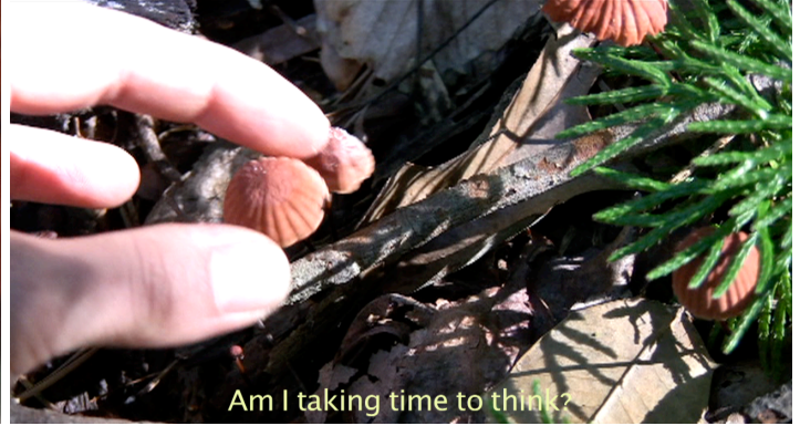
Figure 9: Questions Leaders Ask Themselves , video still, 2009

ribbed dome of the mushroom cap, shyly at first and then with more vigor, until I place it between my thumb and forefinger so it looks as though I am pinching a nipple. I am constantly surprised by the familiarity of the natural world on micro and macro levels.