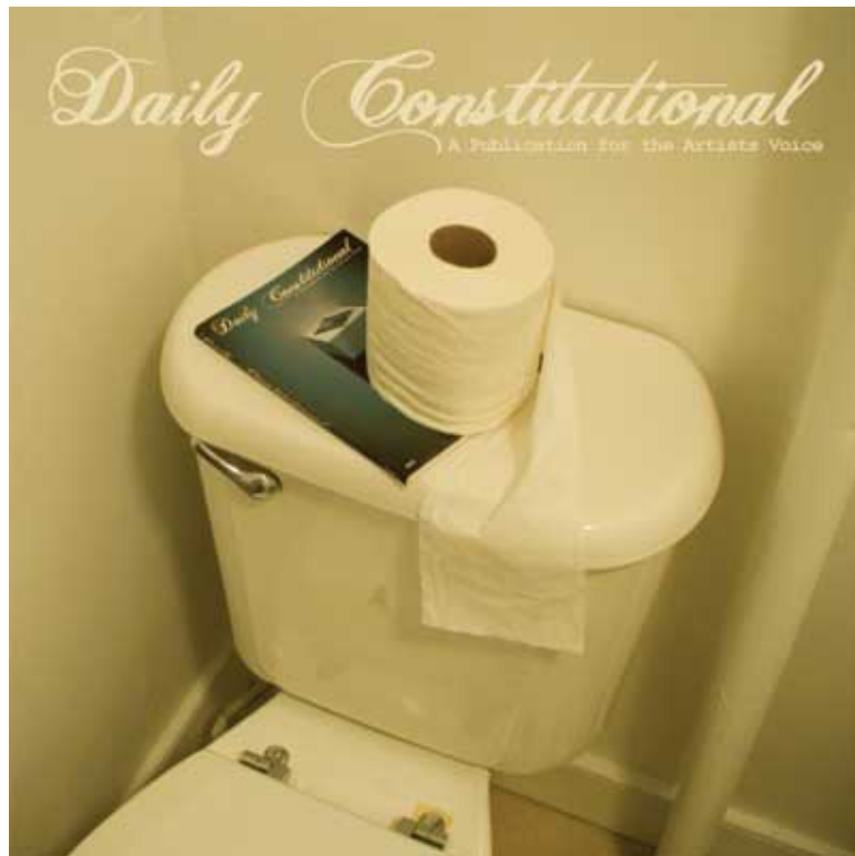
Daily Constitutional, Issue II, BETWEEN, Summer 2006

The written word relies on the mastery of language, mutual understanding