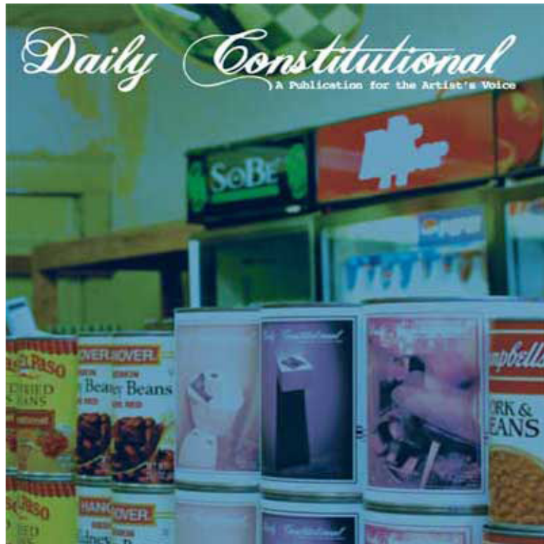
Daily Constitutional, Issue IV, Untitled, Summer 2007

First, it would be helpful to define what an opportunity is for an Artist. Perhaps it is a chance to share the results of one's fervent laboring in order to disentangle one from their thoughts. Depending on content and context, an opportunity might be a chance to speak to, or enlighten the masses, even if it may only be to the cultured mass. It might just be a call for the mingling of ideas by way of collaboration. Then again, maybe it really is just a chance to further a career through resume building and exposure. I may be nostalgic here, or perhaps outright naïve, but I still believe in what I do, more so than just the outcome.