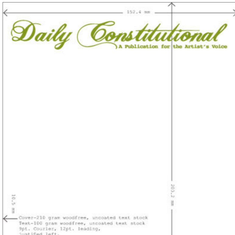
Daily Constitutional, Issue VI, By Proxy, Summer 2008