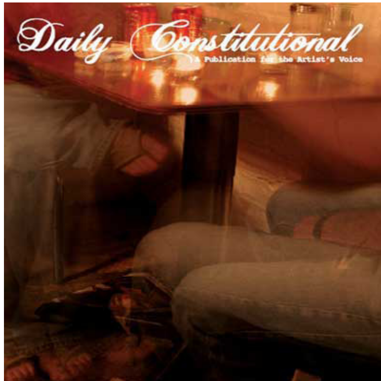
Daily Constitutional, Issue III, NYI, Winter 2007

It is difficult to answer a question over and over again when you