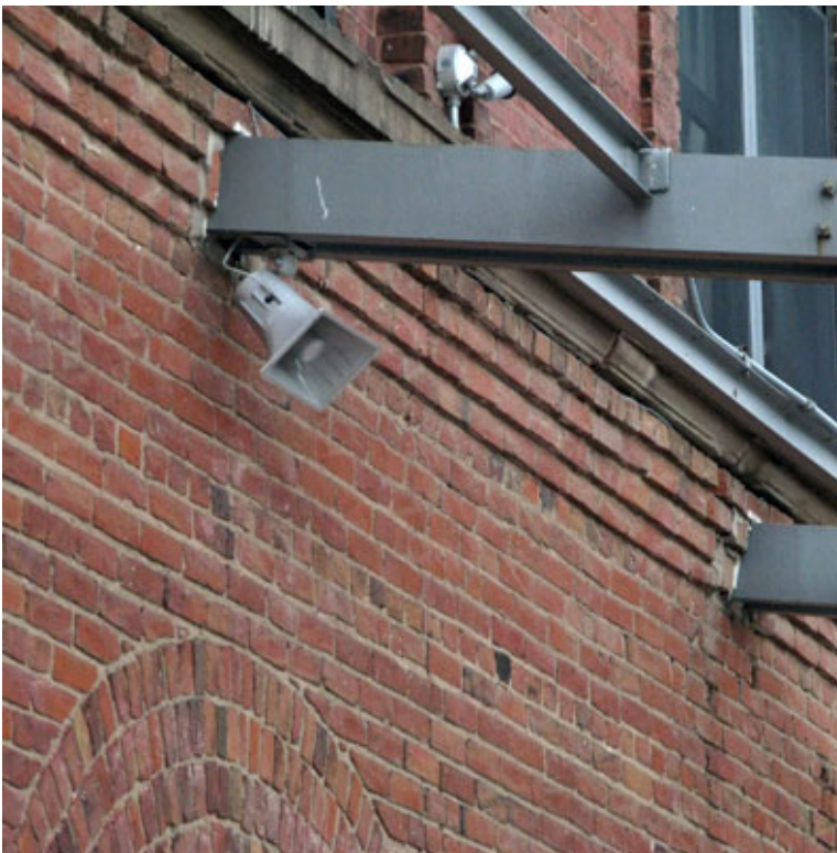
Unattended Ideas, 2008 - audio installation

This interaction between art and viewer is also seen as an opportunity for those that use their artistic endeavors to make commentary, in hopes of impacting the world around them. Artist as activist is not a new role. With an acute eye and adept mind for criticism, the artist is well suited to bring attention and insight to subjects sensitive to social and political awareness or interpretation, or even to the plight