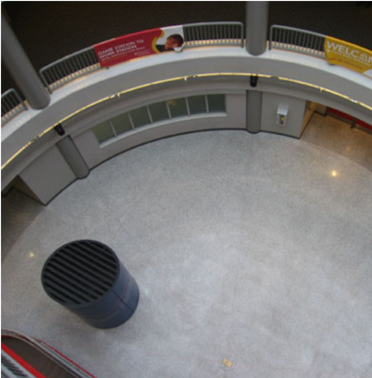
Lesson Plan #19, 2008 - audio installation

collaboration works: The submissions received from fellow artists are looked at in their entirety and once discussed, are used as sort of the 'raw material' (for the lack of a better word) for the collaboration. In return, the six artists, who make up the rotating editorial staff, chose from the submissions to use as building blocks in