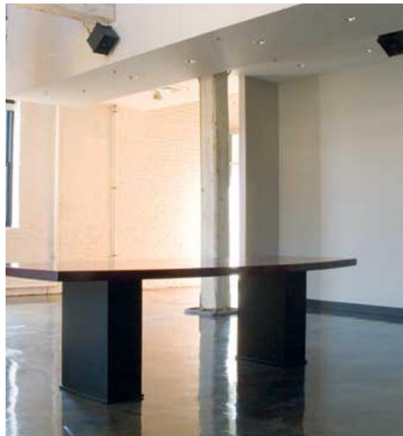
Bored of One, 2005 - audio installation

In order for one to choreograph a dance, they must first learn how to dance. Once learned, you will be able to visualize and feel the performance for yourself before sharing it with others. As an Artist, you too must take on this dual role, one of writer and reader, but not just a reader of any text, the reader of your own text. It is one thing to read quietly to yourself, but to really understand it, you must read it aloud. Stand up and project your voice until it can be heard. Let it resonate throughout the space we occupy.