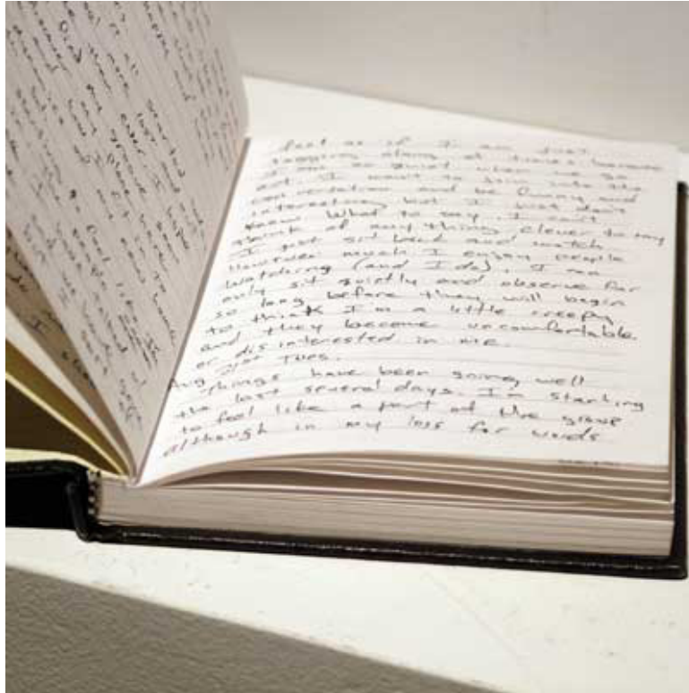
Diary, 2004 - audio installation

Artists are continually reading, writing and conducting research as a part of the creative process, especially now that the information age has made this process so much more accessible, and to a much larger audience. The Artist is looking for inspiration, ideas, influences, context or perhaps even originality in this process, but is seldom