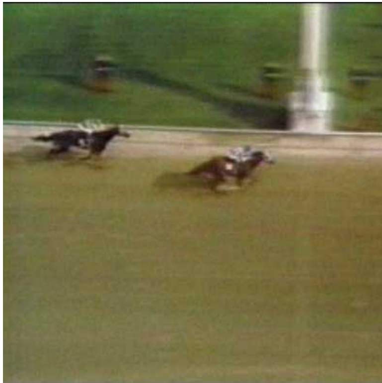
Simulcast, 2007 - audio installation

After considering all the possibilities for opportunity, why has the motto 'I got mine' been adopted into the mantra of the artist? As I look around me, the culture of the art world is beginning to resemble that of the business world, not one that is fueled by a free flow of ideas. The individual artist's attention has become focused on the next big show, or how to get gallery representation, rather than creating work from inspiration and ideas, all this in the name of becoming a part of an art market. When the artist begins to value a career based on fame and monetary gain, over one founded on content, ideas and beliefs, an entire society suffers.