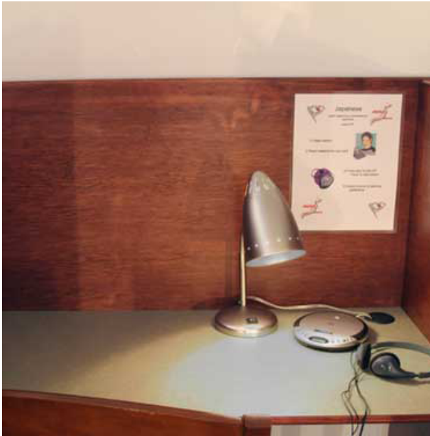
Language Lab, 2006 - audio installation

and the amount of imagination the reader brings to a text. It is self-doubt of my own level of proficiency, which makes writing such a personal chore. I have been working with text, language and dialogue in my work for over ten years now. With pen in hand, I am still overwhelmed with fear and anxiety, every time I pull out the yellow legal pad or sit down in front of the computer.