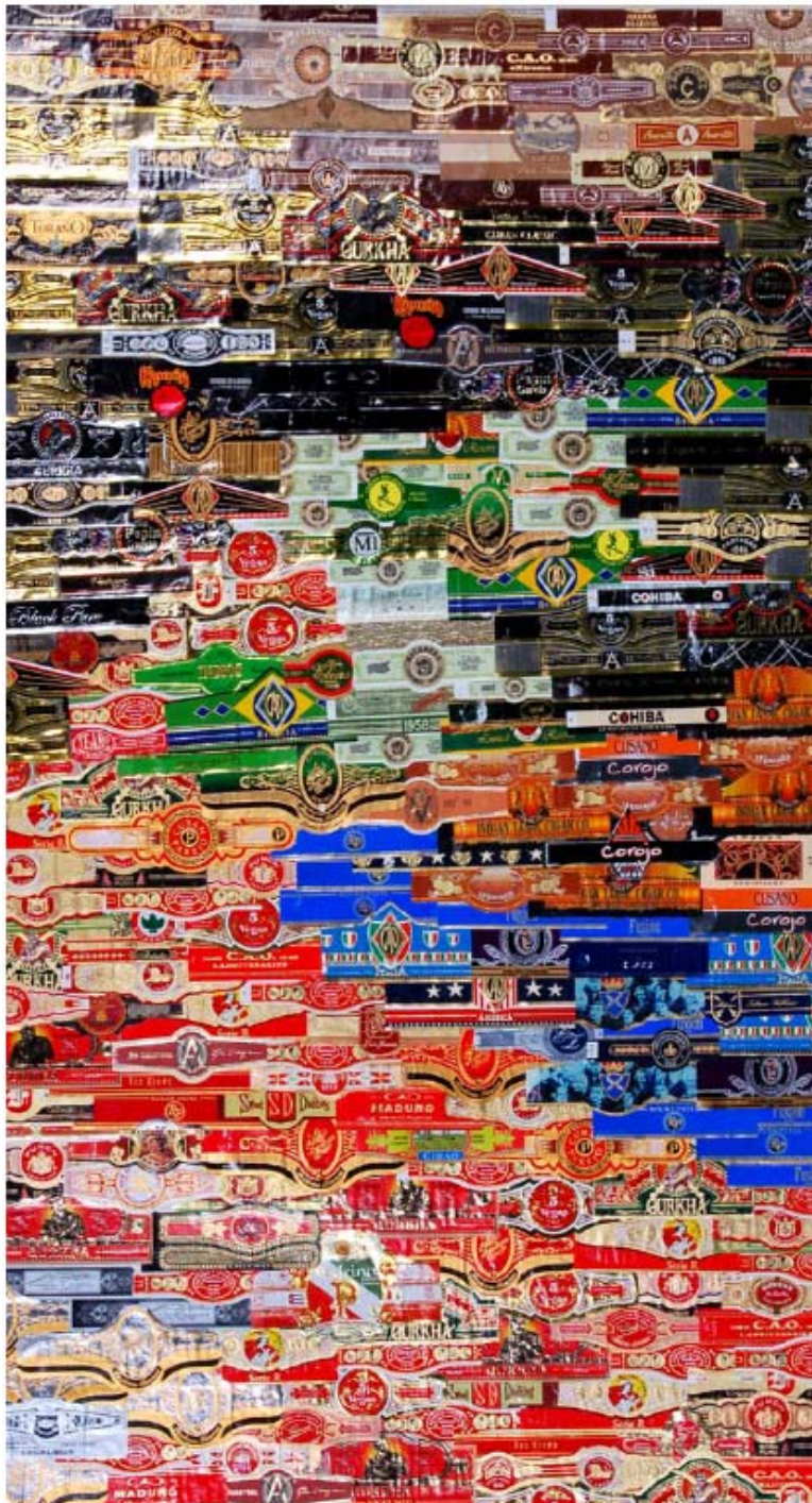
Figure 1. Color Field of Labels I , Paper Collage, 32"x24", 2008.