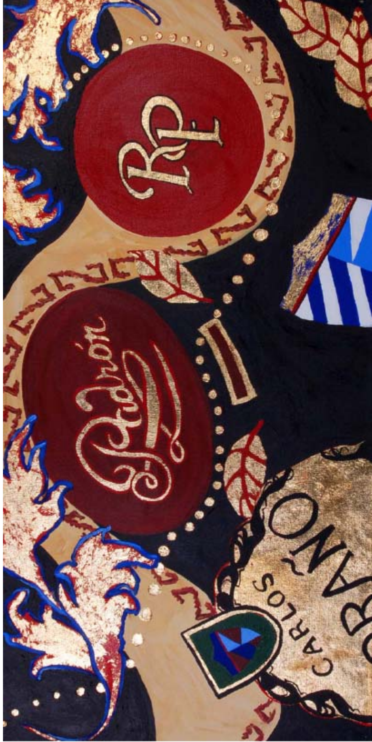
Figure 10. Latin American Medley, Acrylic on Canvas, 18"x36", 2009.