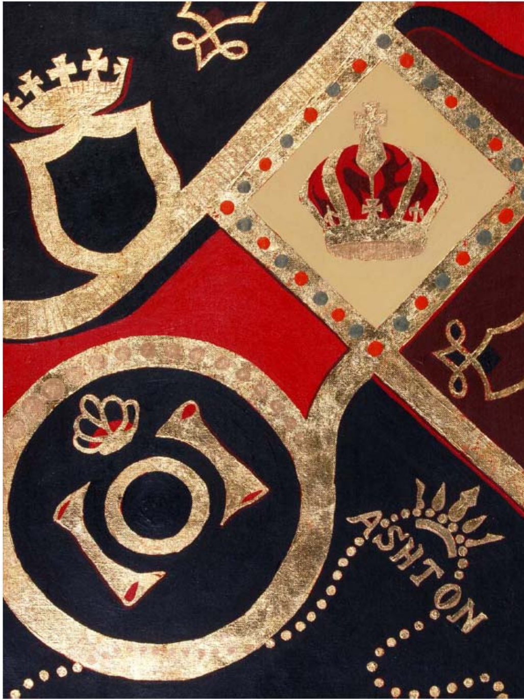
Figure 7. Four Crowns in Gold and Red , Acrylic on Canvas Board, 24"x18", 2009.