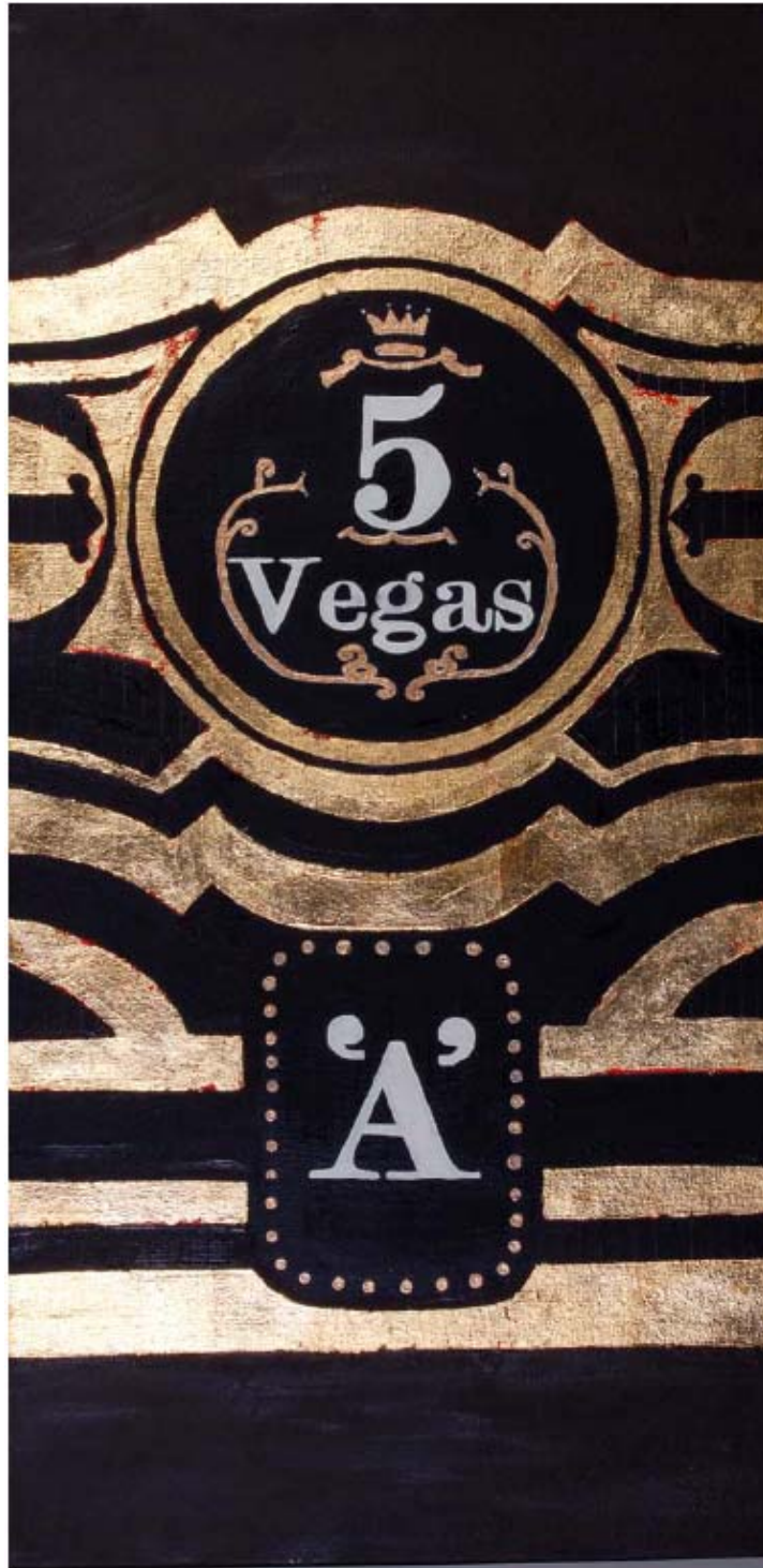
Figure 3. Cinco Vegas , Oil on Canvas, 36"x18", 2007.