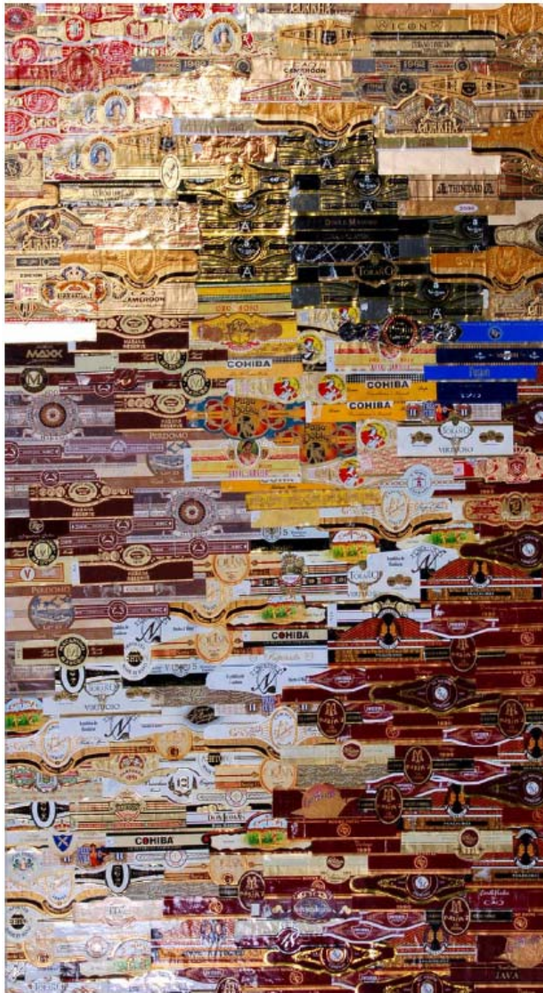
Figure 2. Color Field of Labels II , Paper Collage, 32"x24", 2008.