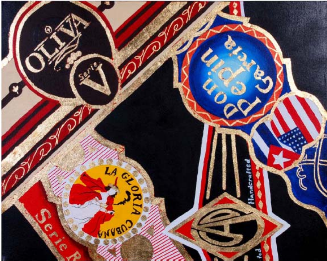
Figure 5. Four Bands , Acrylic on Canvas, 24"x30", 2008.