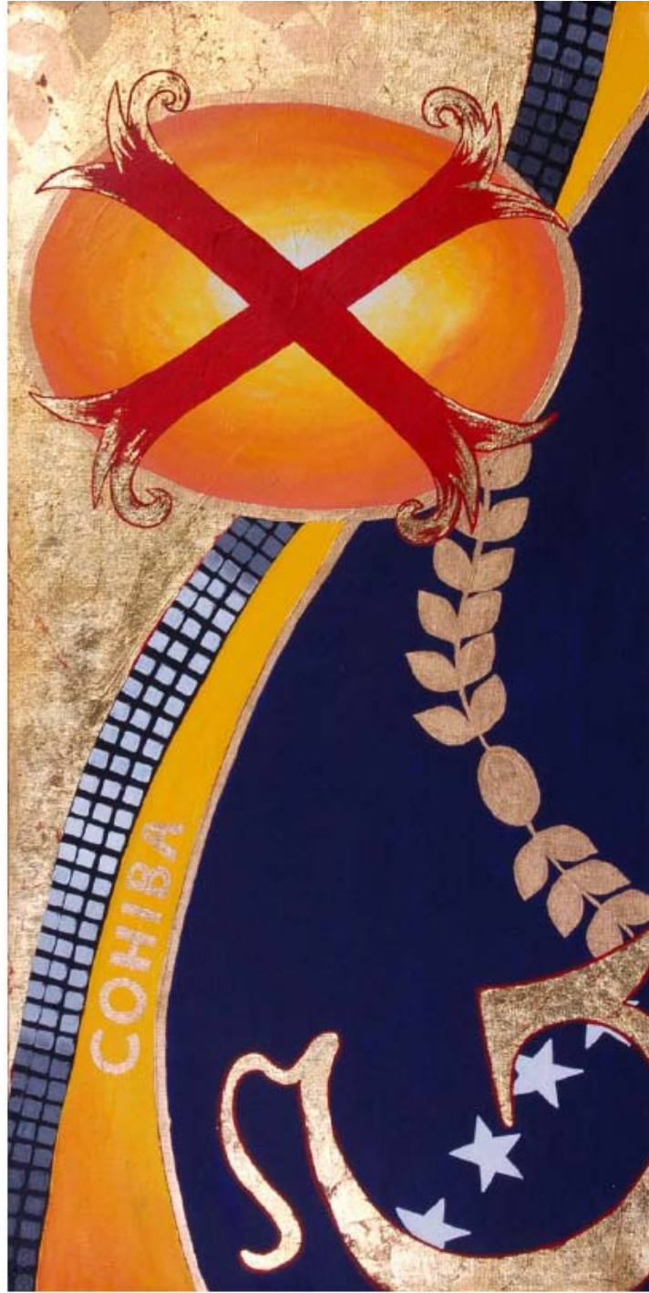
Figure 6. G-X Cohiba, Acrylic on Canvas, 18"x36", 2009