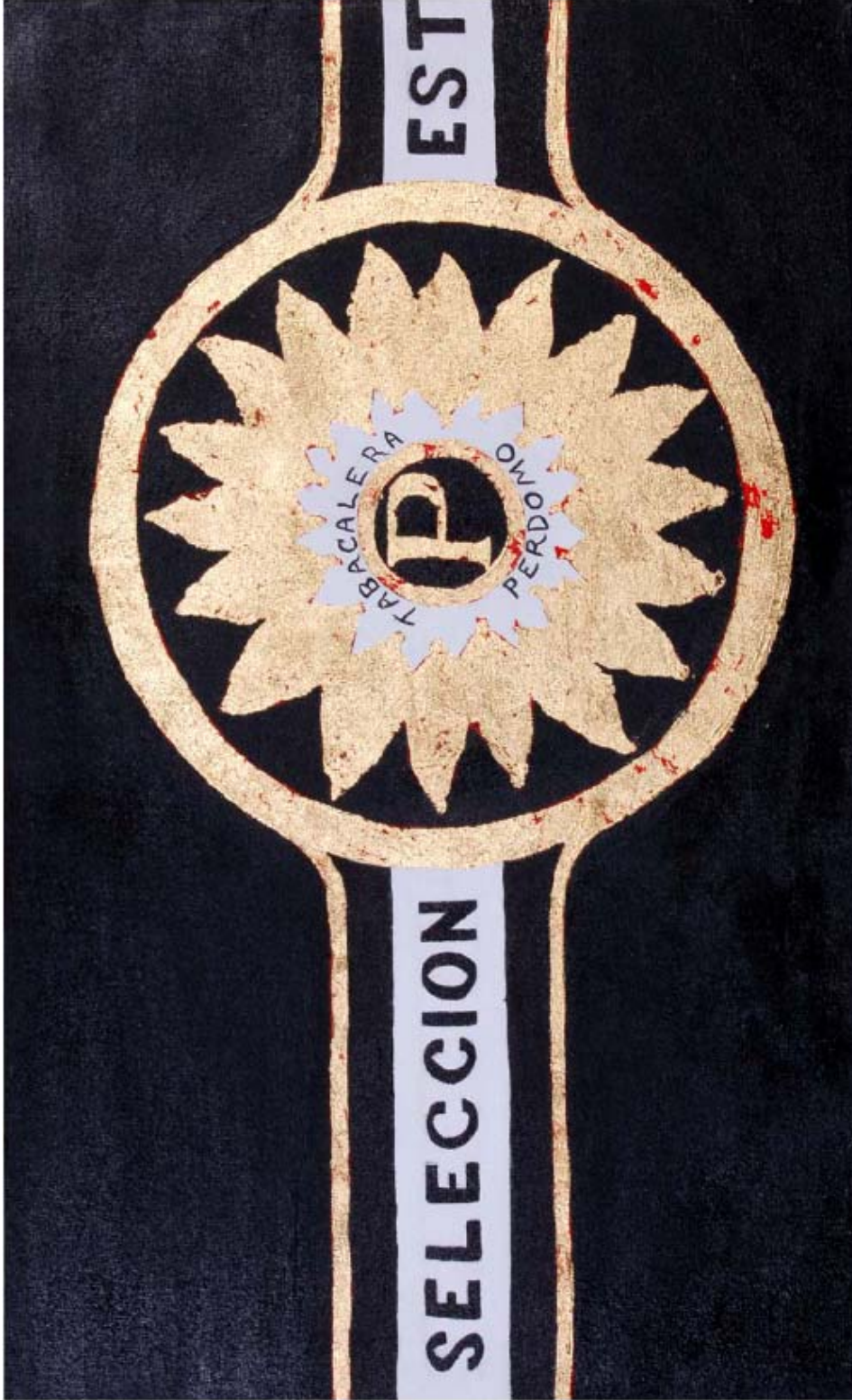
Figure 4. Perdomo Sun, Acrylic on Canvas, 16"x26", 2009.