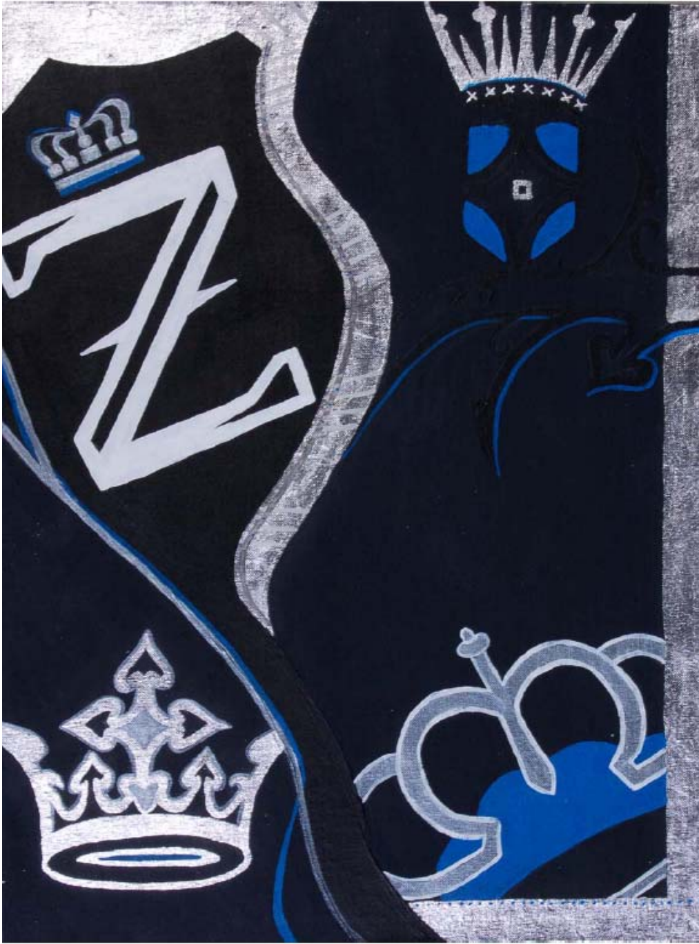
Figure 8. Four Crowns in Silver and Blue , Acrylic on Canvas Board, 24"x18", 2009.