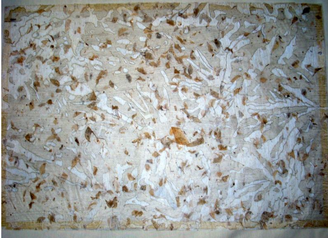
Figure 6. White Drawing , colored pencil, grease pencil, brown paper, 22"x28", 2008.