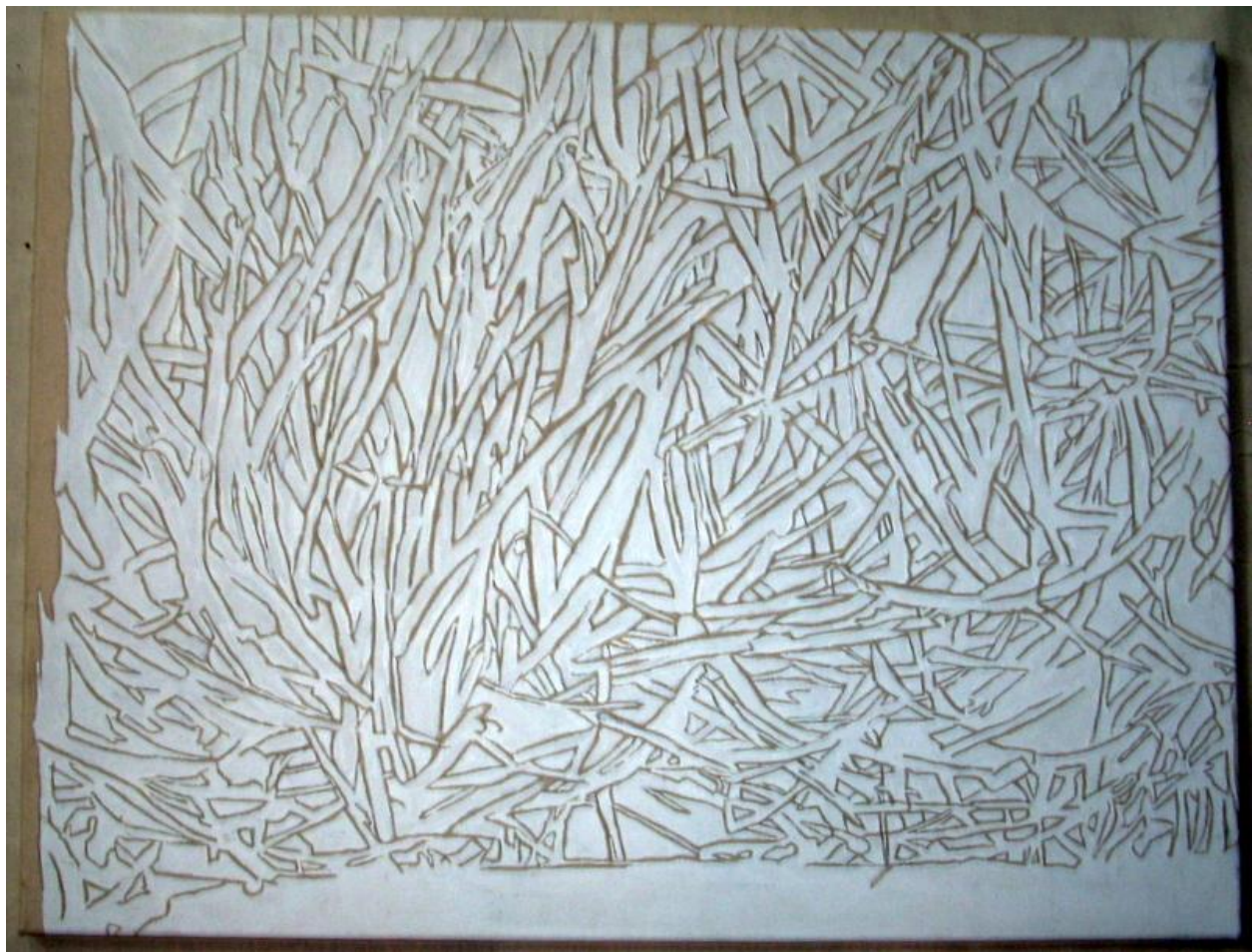
Figure 4. Liriopscape , gesso, raw canvas, 20"x26", 2006.