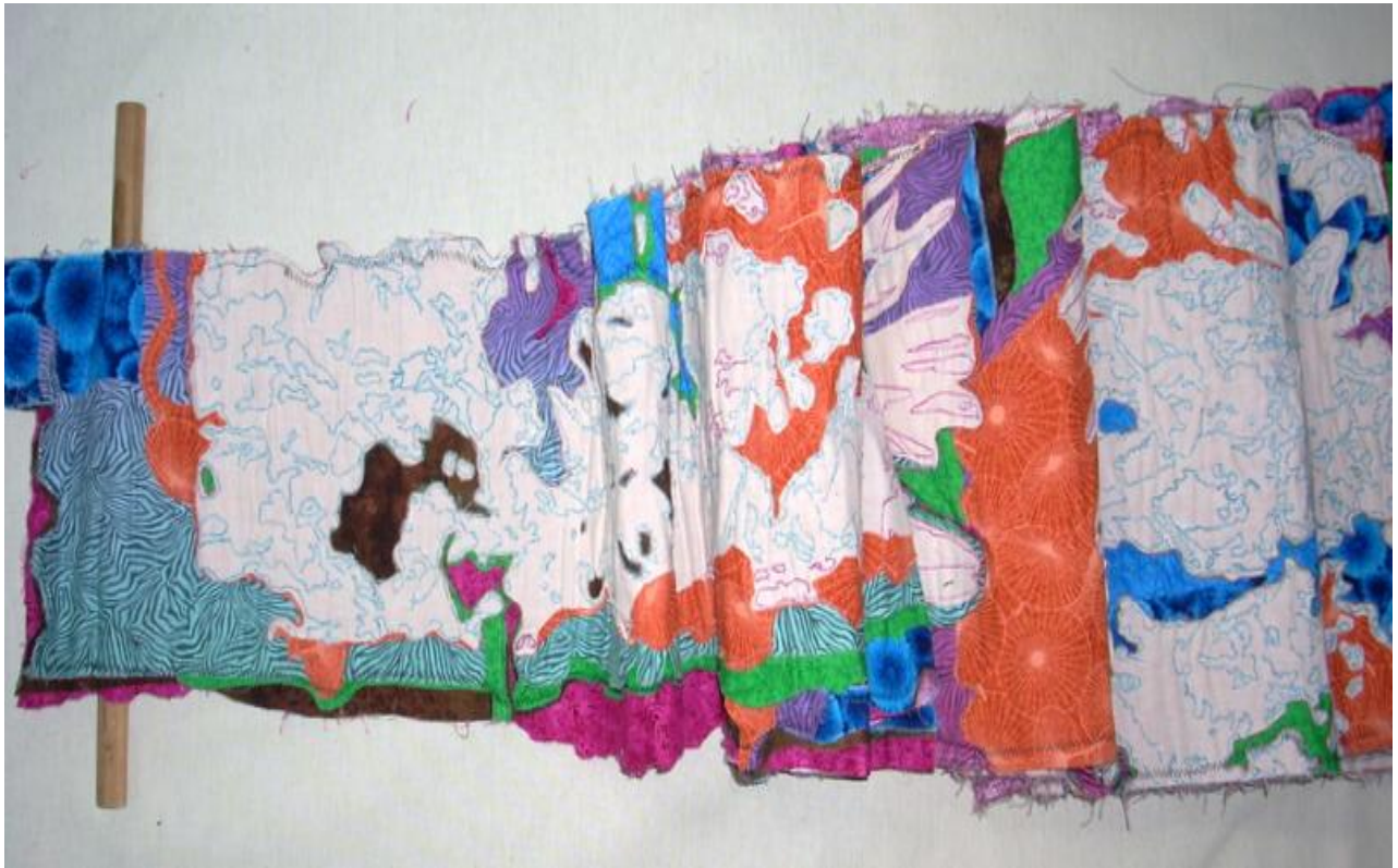
Figure 7. Rolled Scroll , (detail), fabric, indelible marker, stitched line, 14"x158" (entire piece), 2010.