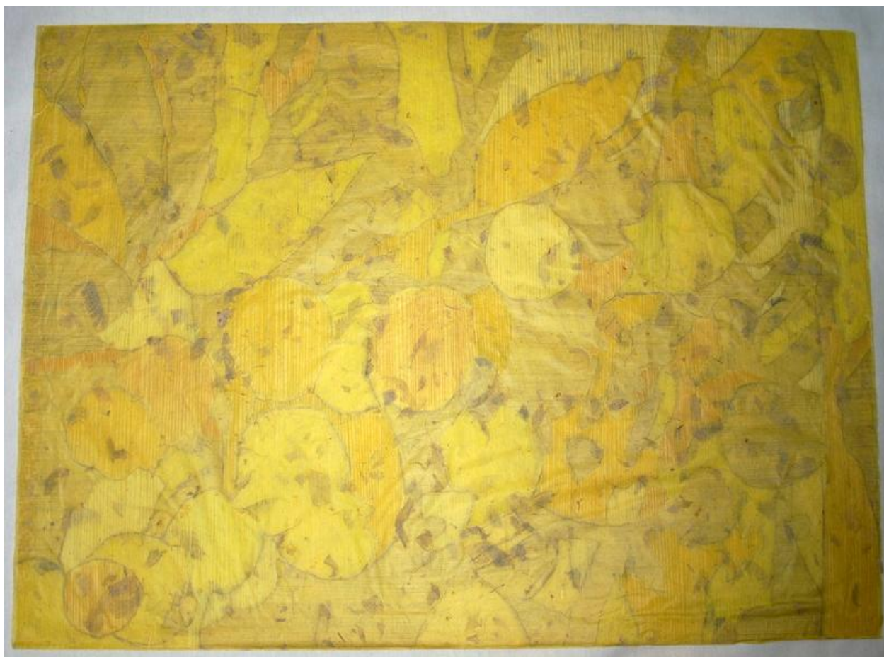
Figure 3. Drawing Series on Yellow , colored pencil, yellow paper, 22"x28", 2009.