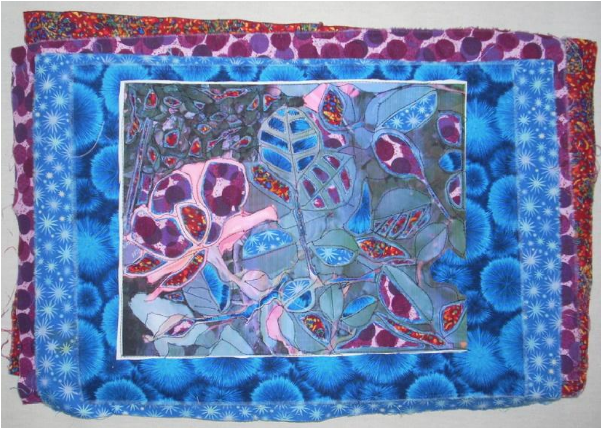
Figure 5. Small Cut Pieces Blue , fabric, mixed media, stitched line, 11"x16", 2007.