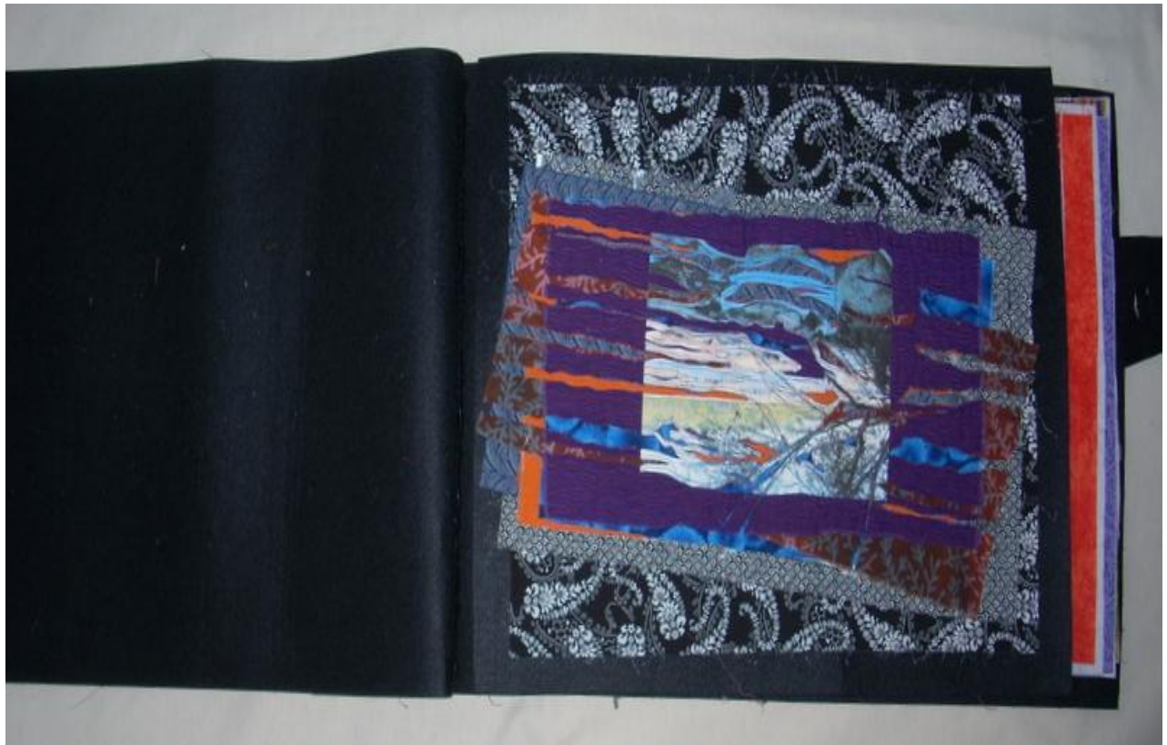
Figure 1. The Fabric Book, Page 3 (open), fabric, pellaon, stitched line, 15"x24", 2010.