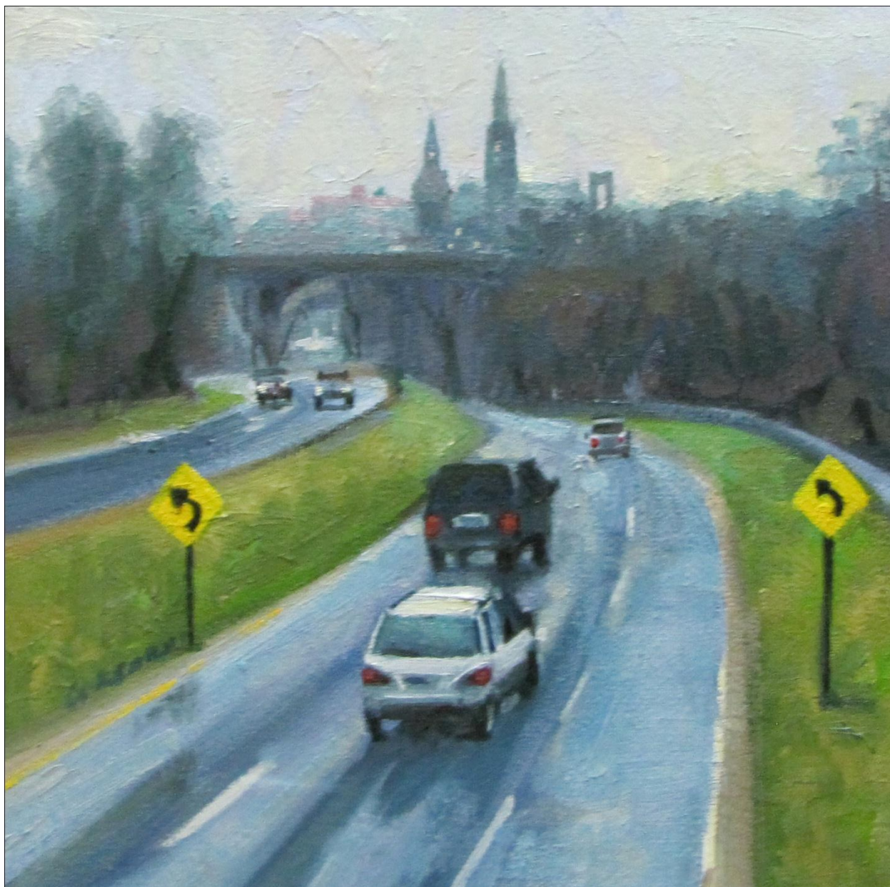
Figure 1. Slick Commute , oil on canvas, 8"x8", 2011.