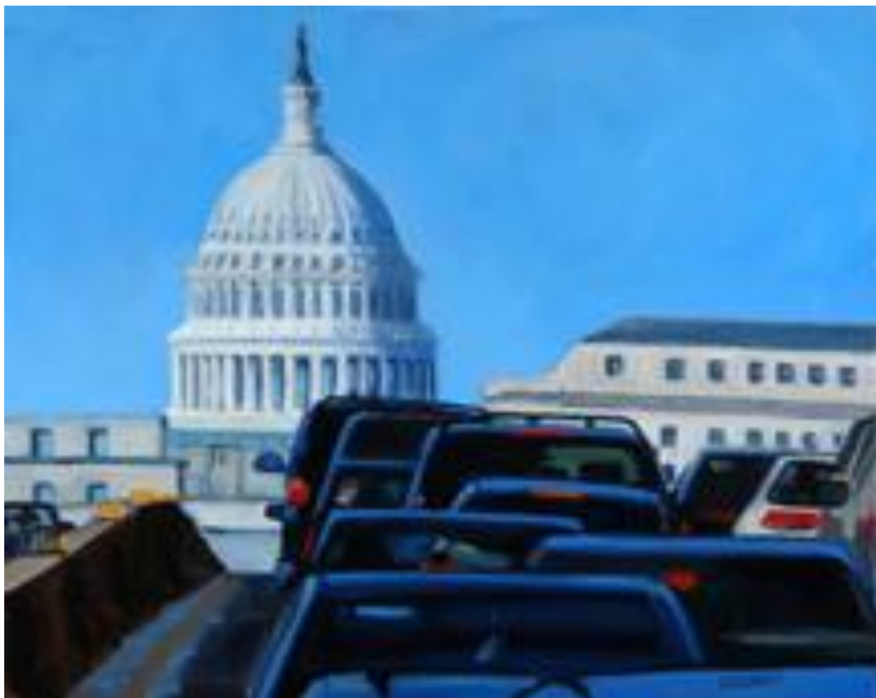
Figure 3. Stuck in Traffic , oil on canvas, 16"x20", 2008.