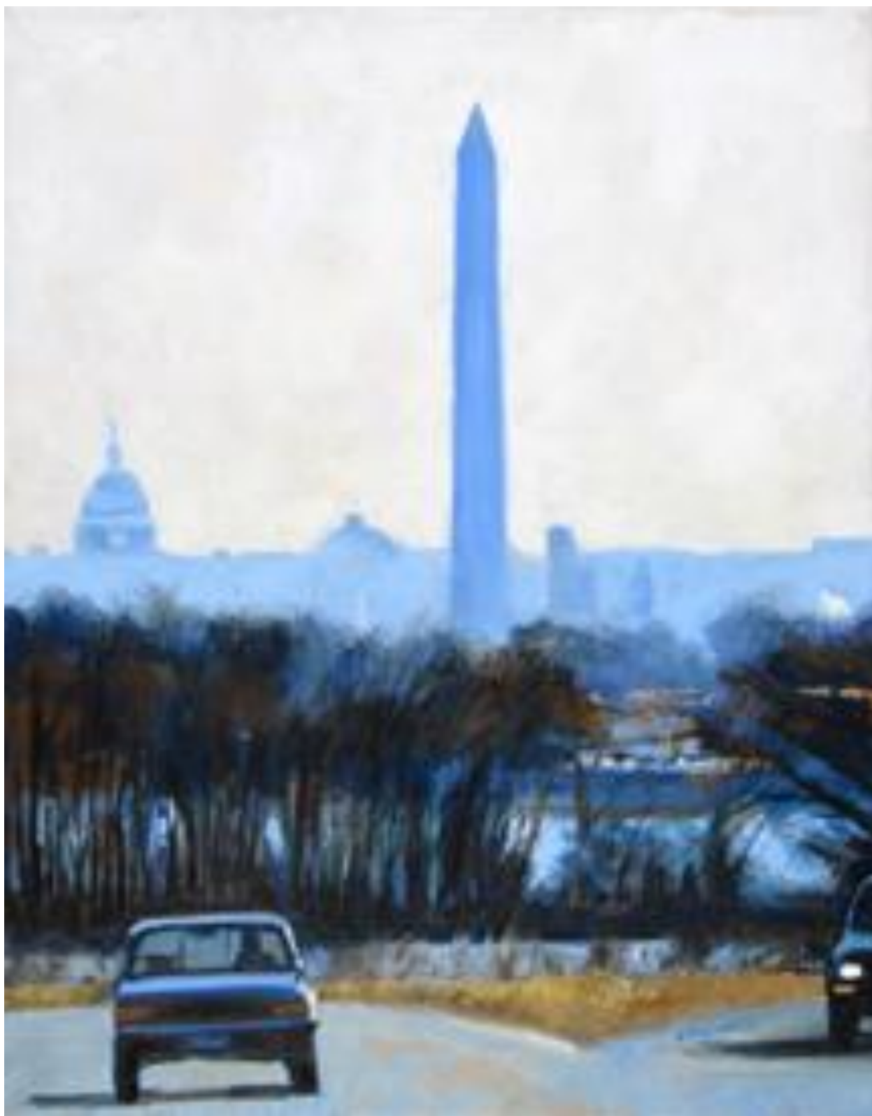
Figure 2. Early Commute , oil on canvas, 20"x16", 2009.