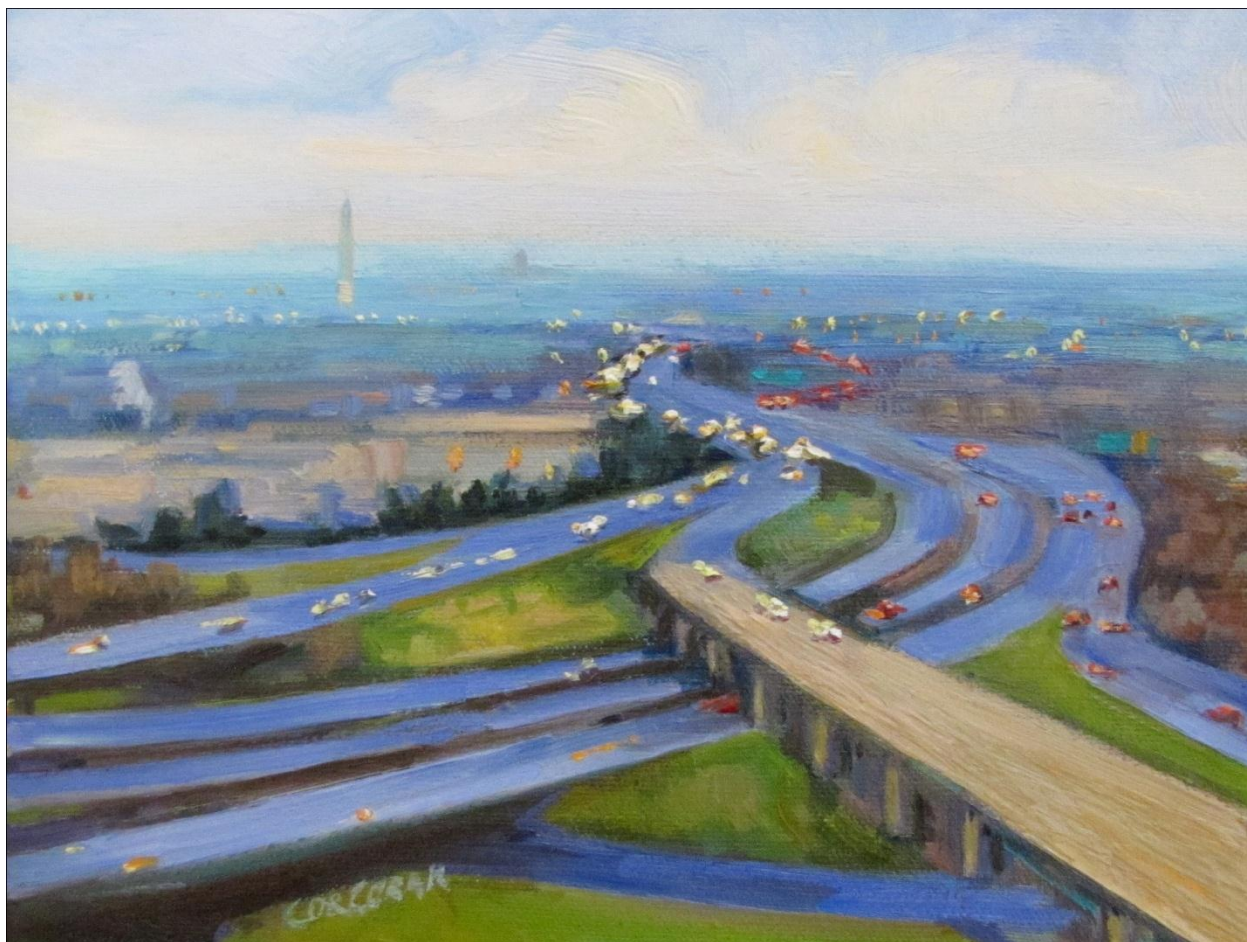
Figure 6. A Brilliant Commute , oil on canvas, 8"x10", 2010.