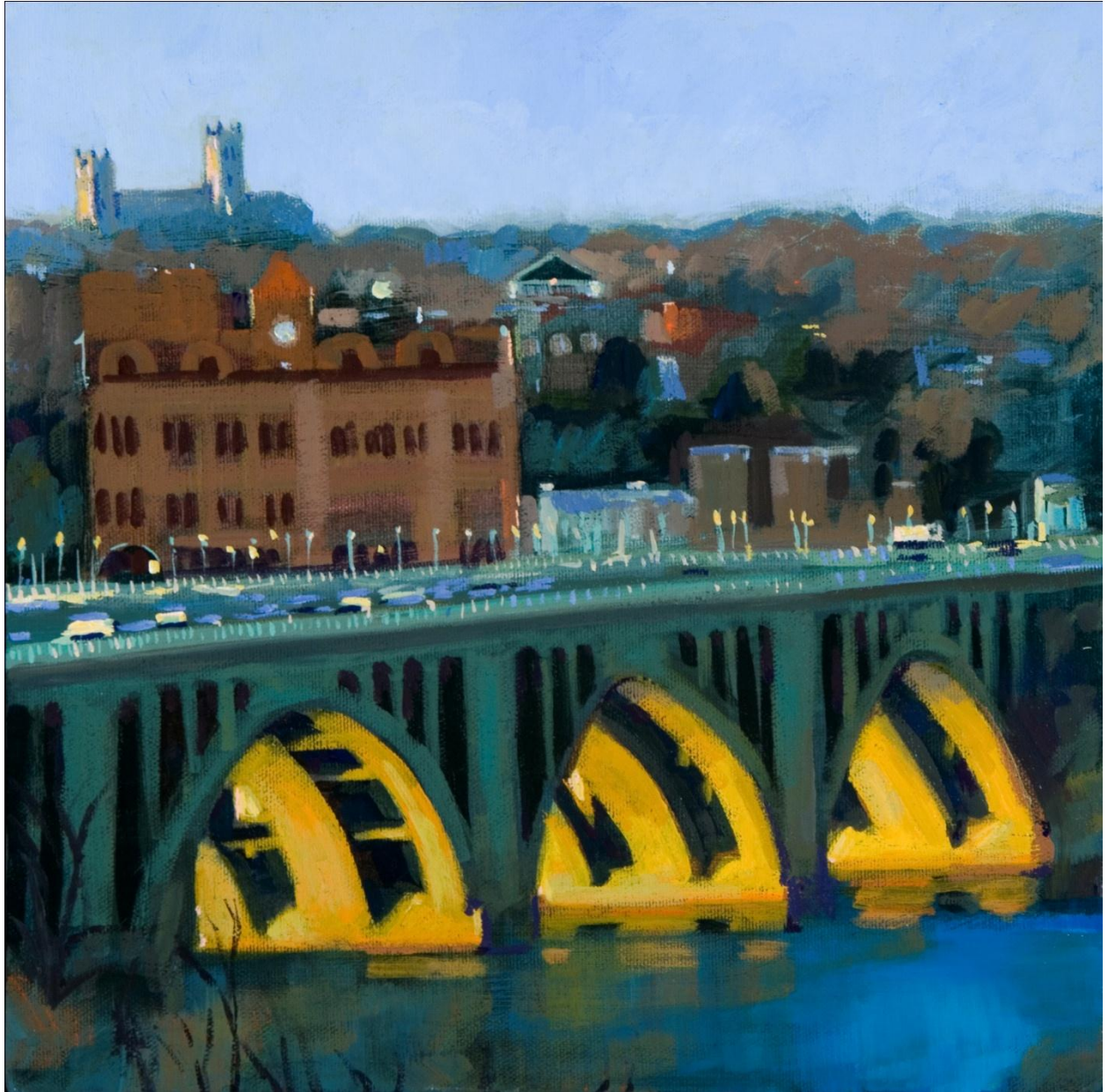
Figure 5. Golden Hour , acrylic on canvas, 8"x8", 2010.