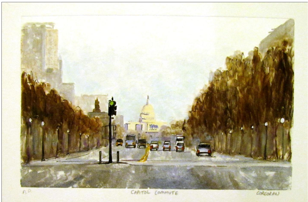
Figure 9. Capitol Commute , monotype, 8"x11", 2011.