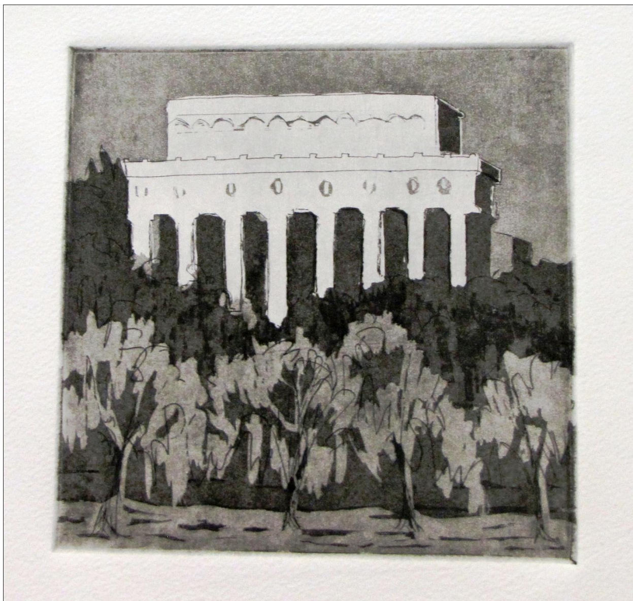
Figure 7. Lincoln's Thoughts , aquatint, 5"x5", 2011.