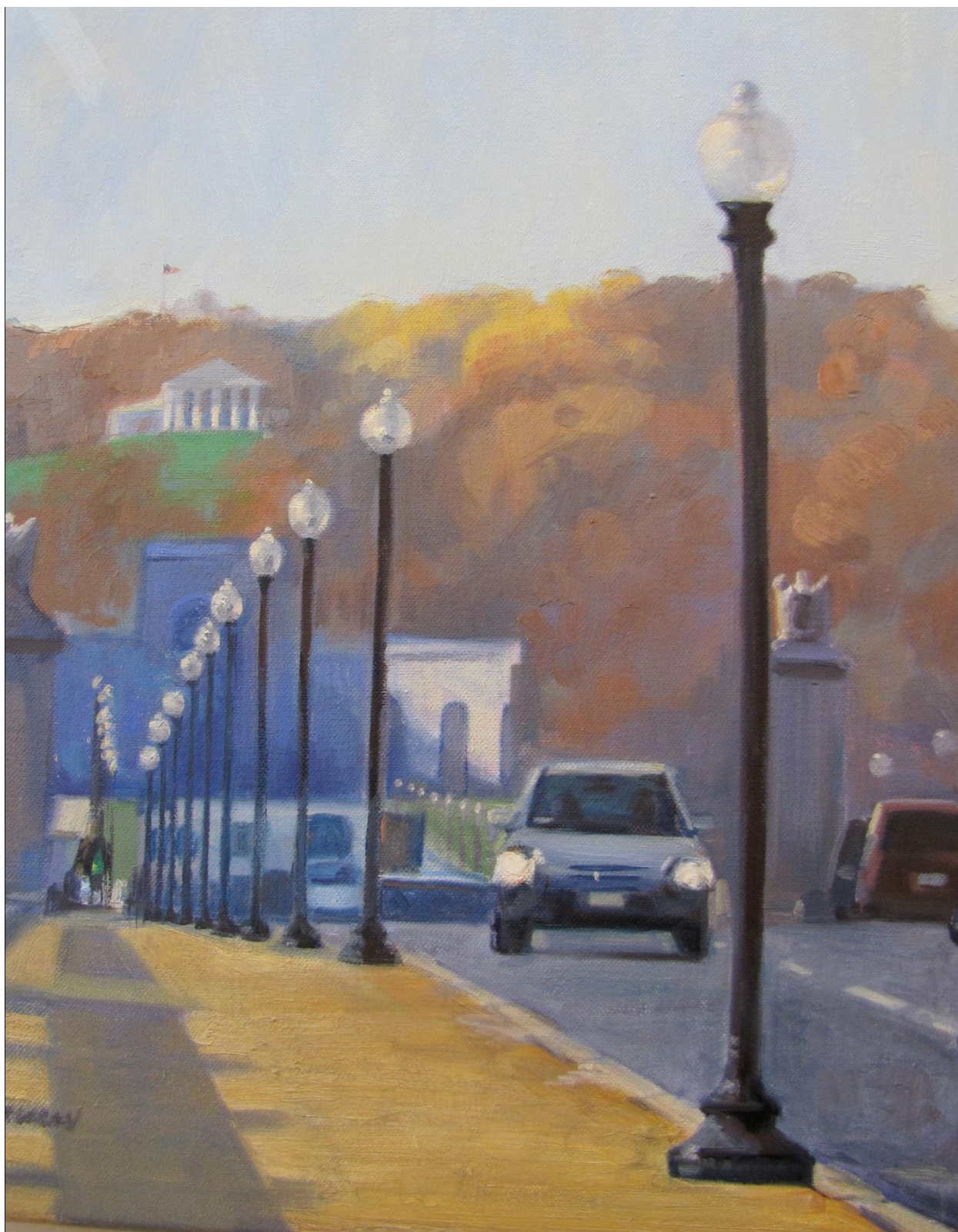
Figure 4. Lee's Thoughts , oil on canvas, 20"x16", 2011.