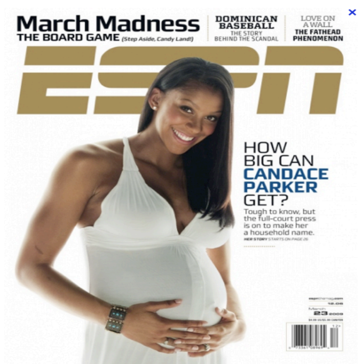
Candace Parker: Spring 2009