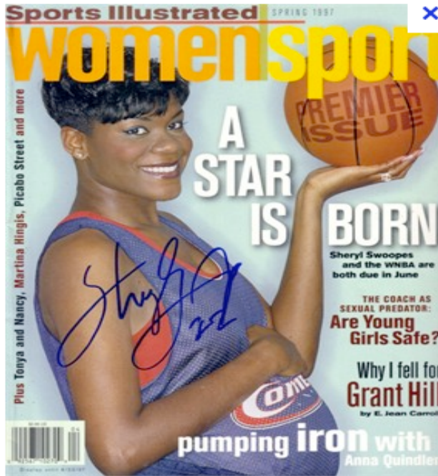
Sheryl Swoopes: Spring 1997

Honoring Motherhood or Marginalizing Female Athleticism?