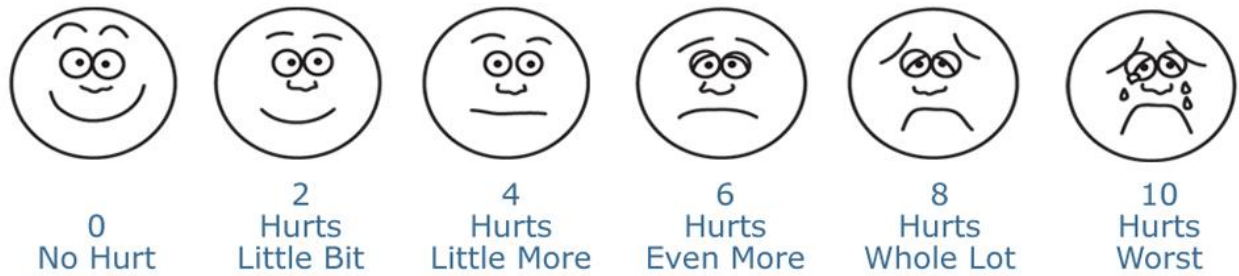
Figure 1. Pain rating scale recommended for children 3 years and older developed by Donna Wong and Connie Baker