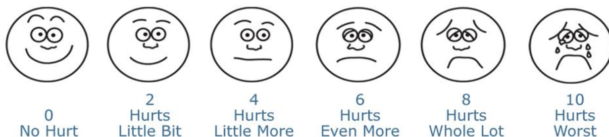
Figure 1. Pain rating scale recommended for children 3 years and older developed by Donna Wong and Connie Baker