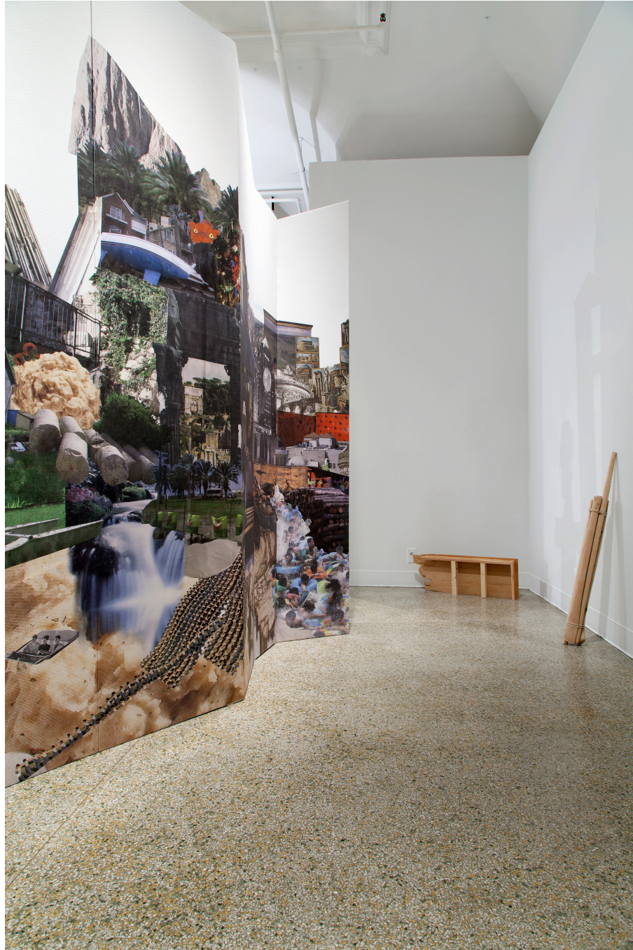
Fig. 9. Erratic Boulders , ink jet prints on canvas, ceramic, granite, foam, wood, video, un-used tool handles, plaster column, cabinet, play sand, 10'x 21'x 10', 2014