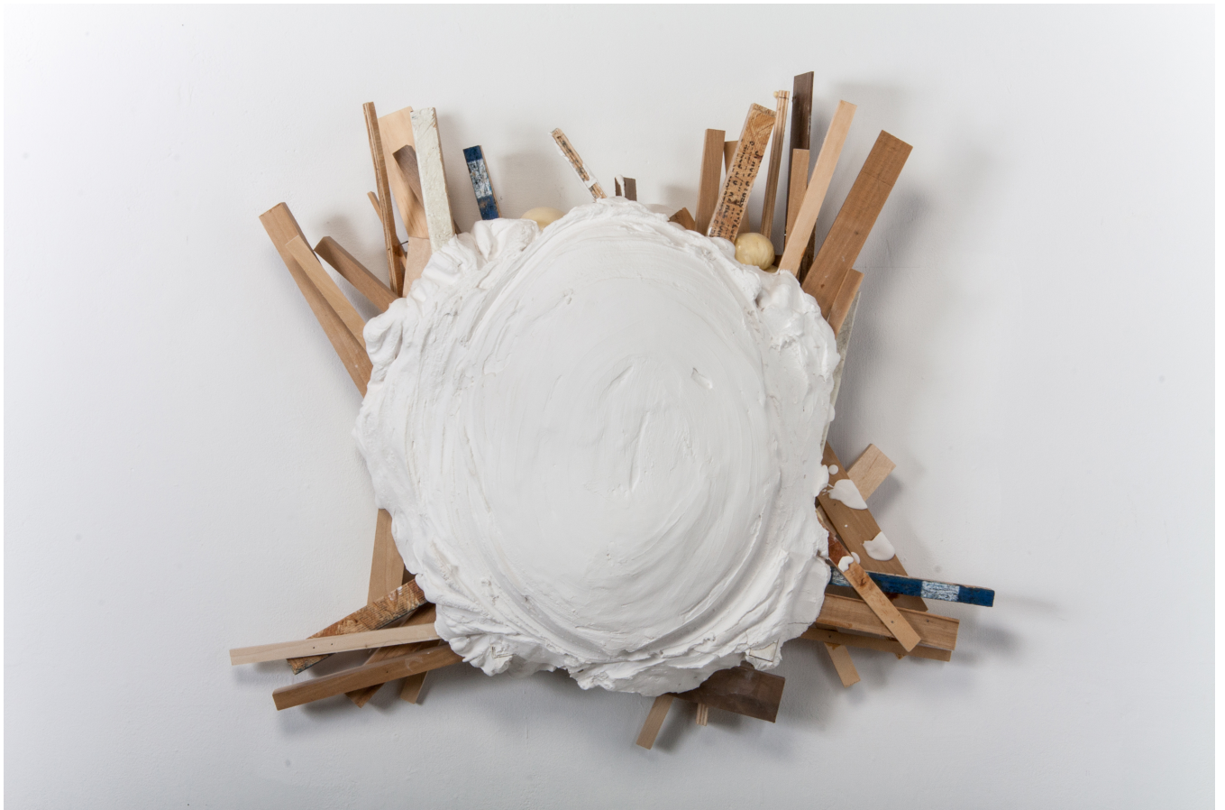
Fig. 7. Crest , plaster, wood, foam, 24"x33"x11", 2012

to the ongoing investigation of mine in the studio to understand the physicality of many types of materials. A lot of this process during graduate school has been trial and error.