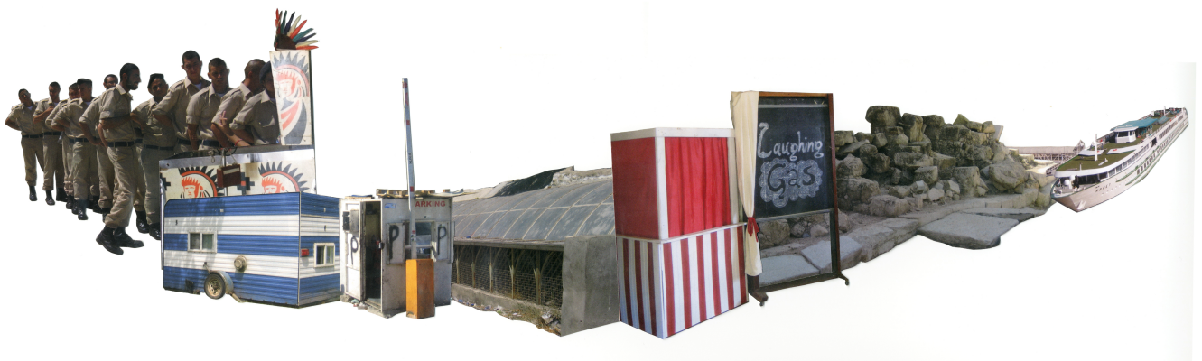
Fig. 6. Space Study 5 , color laser prints on paper, 9"x 22", 2013

In the fall semester of my second year at VCU I had a magazine printed that consisted of photographs I took over the past five to six years. I collaged my images with images from magazines, post cards, pamphlets, and books from a range of time periods (mostly the last hundred years) to create the large collaged landscape in my thesis exhibition and other smaller studies (see fig. 6). In this process of creating an expansive landscape of imagery, I look for parallel experiences between my life and the past. In reflection, the found imagery I have collected so far could go back further historically, but the cultural sampling seemed eclectic enough for my initial investigation. The resultant work feels like a cultural spewing– having a bold chaotic quality. Through this method of collaging, I create the dizzying feeling of traveling through many spaces and histories at once– compositions that then become a way to exist in multiple places and time periods simultaneously.