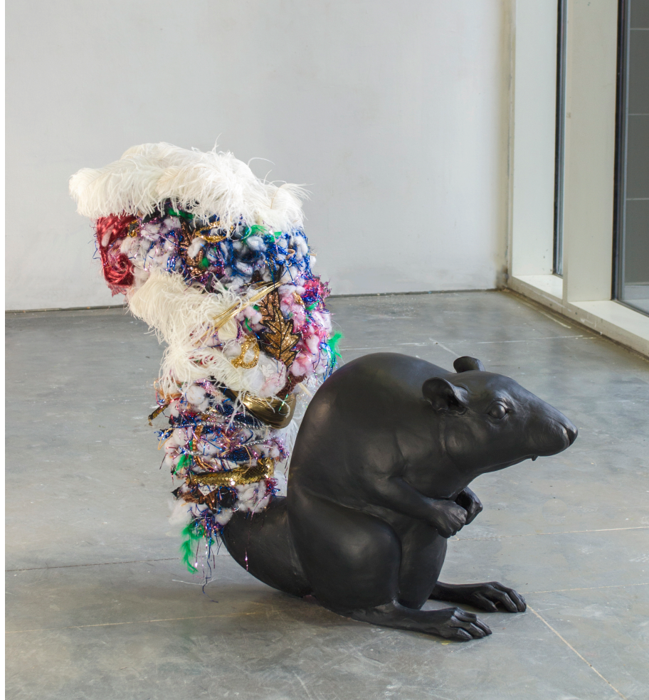
Fig. 12. Rat Queen , ceramic, foam, feathers, synthetic hair, deconstructed prom dresses, Easter grass, polyester fiber, 45"x48"x12", 2012

Rat Queen , depicts a human scale rat sporting a prosthetic squirrel tail in an attempt to elevate the rat's status among the human community (see fig. 12). There is a saying that squirrels are basically rats with fluffy tails meaning that squirrels are pests to the same degree as rats, but we accept them more because of their cute fluffy tails. The trick is seeing through that illusion. I