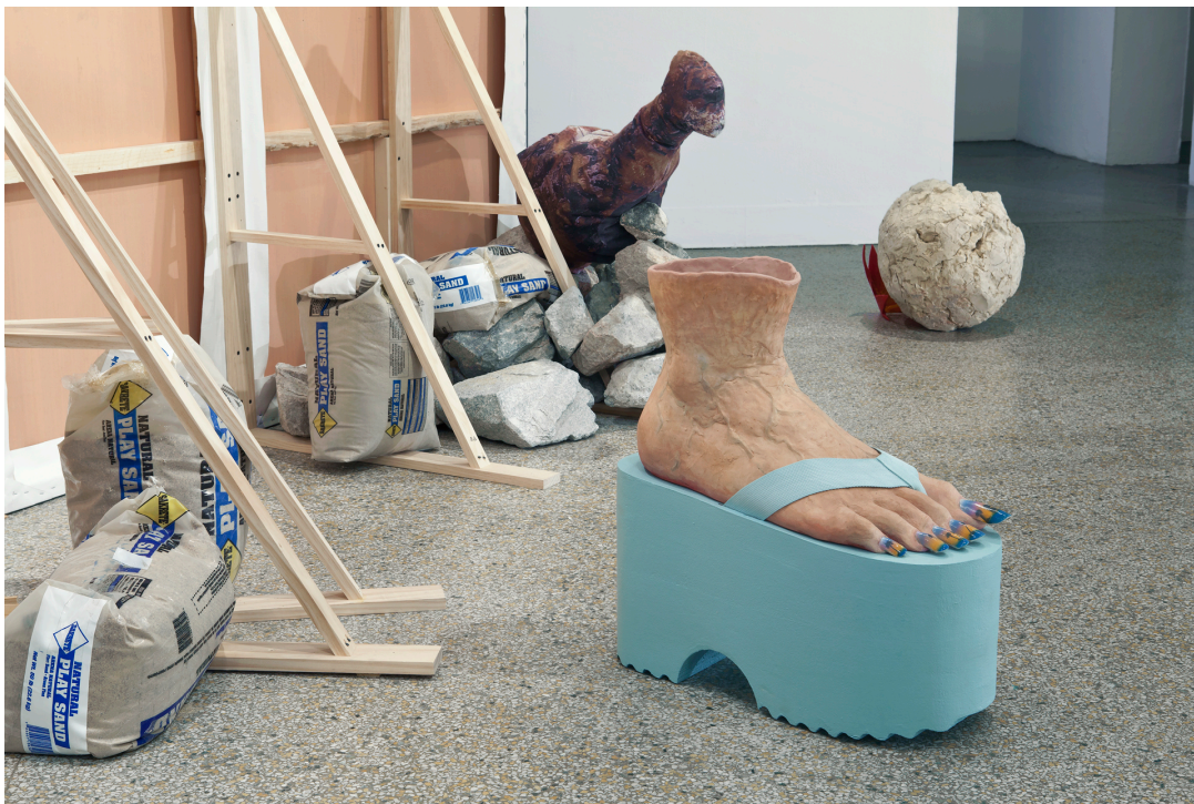
Fig. 10. Erratic Boulders , ink jet prints on canvas, ceramic, granite, foam, wood, video, un-used tool handles, plaster column, cabinet, play sand, 10'x 21'x 10', 2014

The three dimensional and figurative works in Erratic Boulders that interact with the large canvas print also draw connections between landscape, matter, convention, exaggeration, and cultural overlap (see fig. 10). In the next two sections I will discuss how many of the sculptural works fit within these various forms of inquiry, and will again refer to my ongoing investigation of compression, flattening, and space.