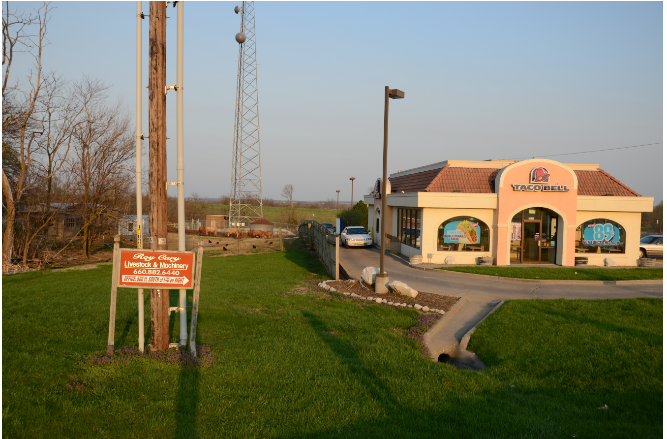
Fig. 4. digital photograph, 2010

Histories and cultures overlap constantly and in close proximity within our daily experience. I work from this philosophy in the studio in various ways, but I also see examples of historical interweaving in real space and time. The above image depicts a property line shared by a livestock farmer and a Taco Bell in rural Missouri. I frequented this particular location on trips