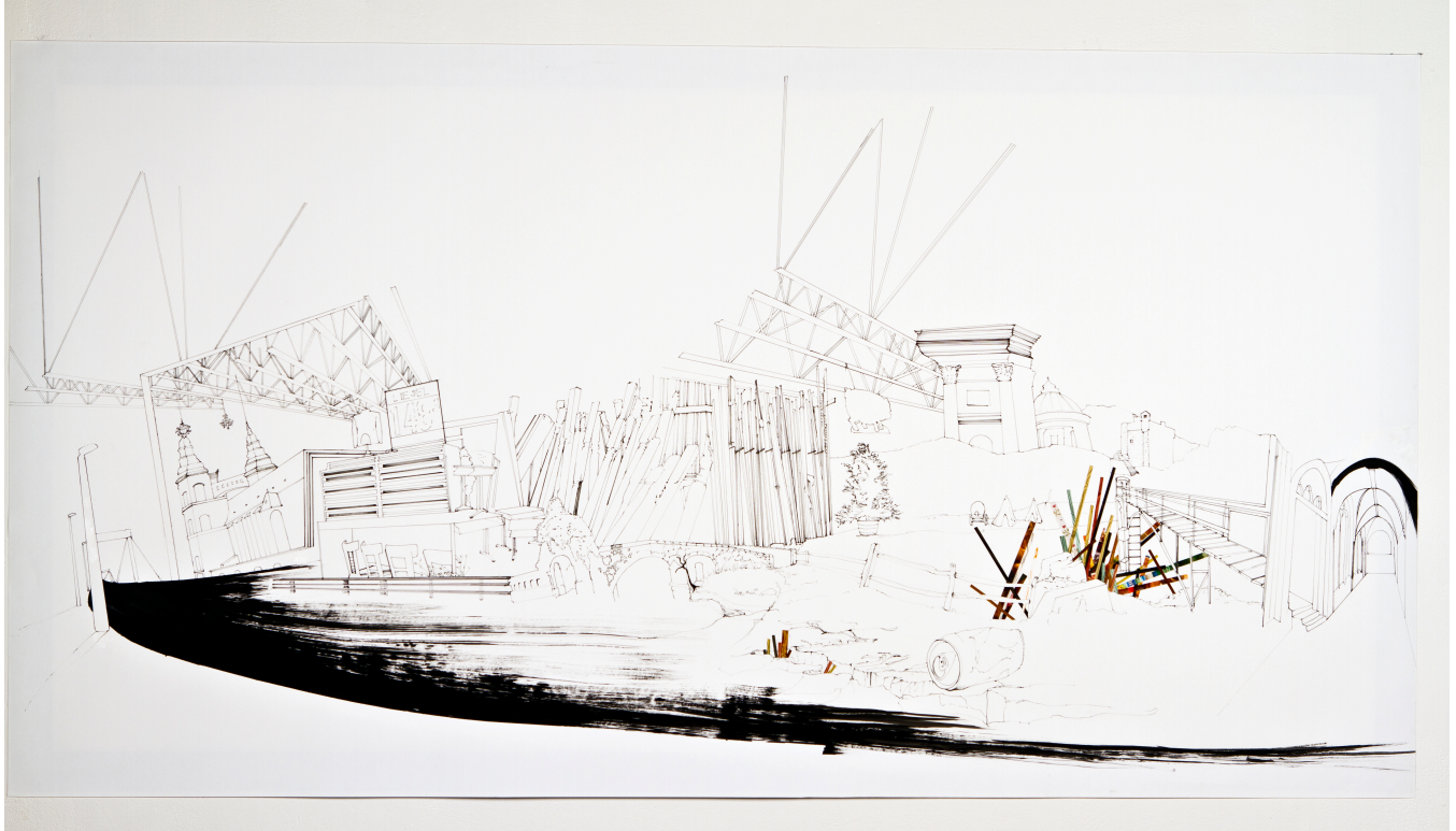
Fig. 5. Untitled Landscape , collage and ink on paper, 36"x62", 2012

I feel it is important to make connections between my life and the past. I feel inherently connected to the past and my ancestry through the material cultural objects that I live with and my genetics. With this in mind I interweave my current experiences with imagery from the past, often looking for parallel experiences. As a studio process, collaging allows me to quickly sift through an immense amount of visual information, and is often the first step in conceiving many of my sculptural works.