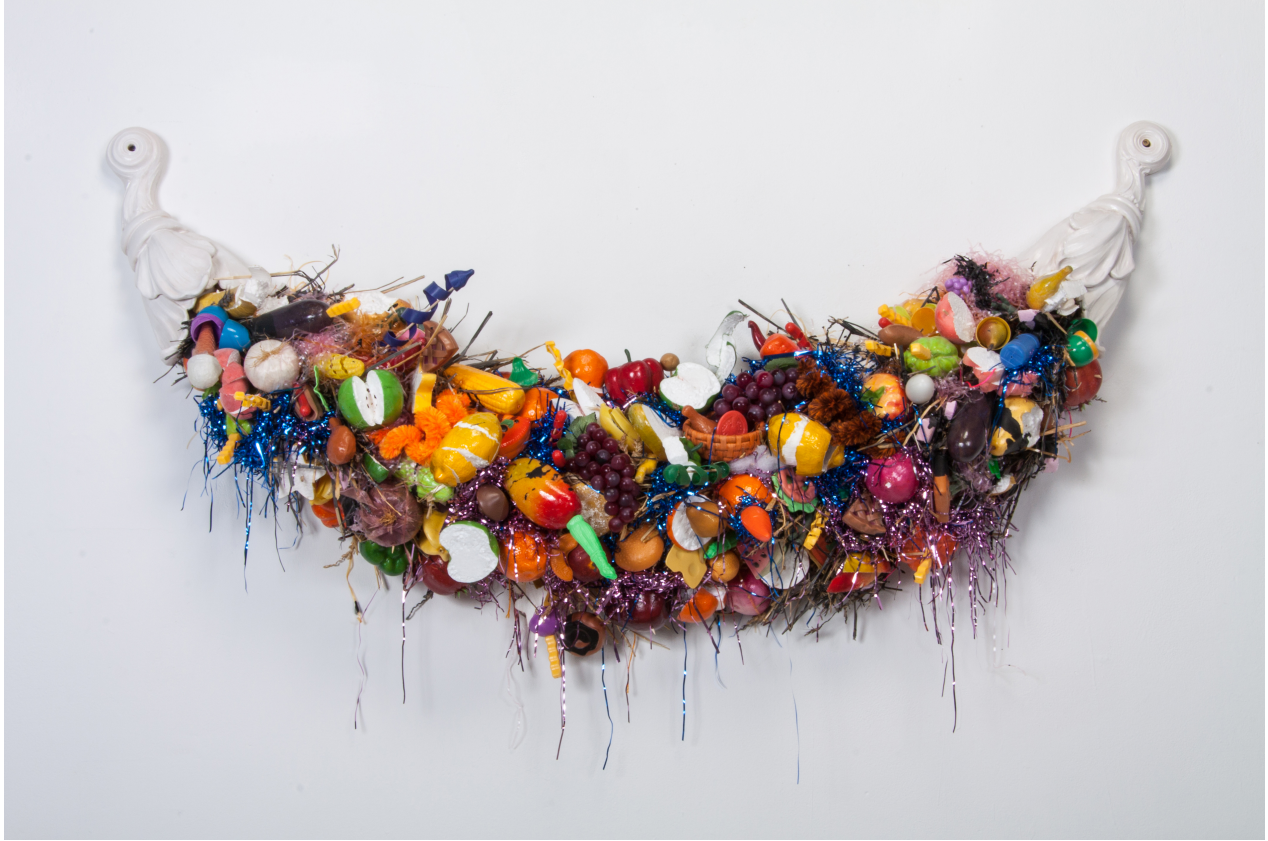
Fig. 2. Swag , plastic fruit, Easter grass, foam, hay, ceramic, paint, 50"x24"x15", 2013

Swag depicts an abundant amassing of goods and creates a relationship between low and high forms of art, craft, and architecture (see fig. 2). I am using primarily plastic and Styrofoam fruits to create a cornucopia-like composition. The gesture of “peeling” the foam lemon and other fruits suggest a mastery of these cheap materials, and an attempt to elevate the status of both the foam lemon and myself as an artist working with foam lemons. I am also pointing to a shift and degradation of materials that occurs in current production and construction methods.