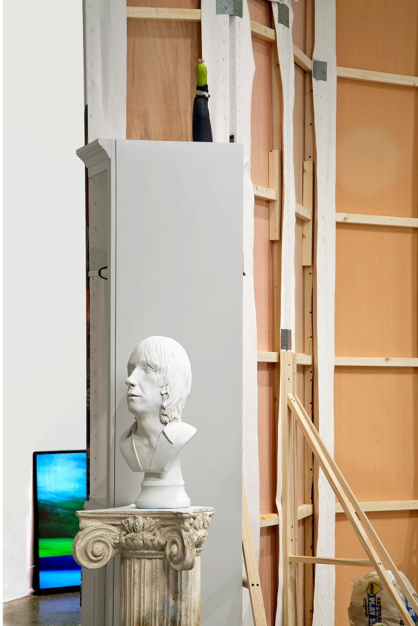
Fig. 13. Erratic Boulders , ink jet prints on canvas, ceramic, granite, foam, wood, video, un-used tool handles, plaster column, cabinet, play sand, 10'x 21'x 10', 2014

I also made reproductions of found objects, and masked and modified found objects. In this process I realized that reproductions have a monument quality, and an anonymity that separates them from found objects. The reproductions lack a certain “patina” or build up of grime and history. Reproductions are therefore anonymous, sometimes only pointing to the maker who has somehow translated the original thing through their psyche. In the case of my