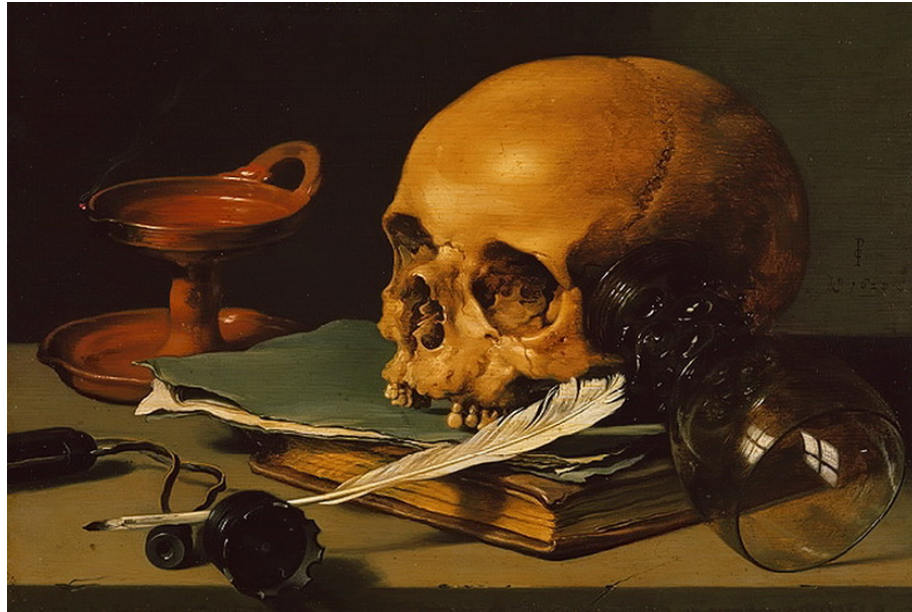
Fig 1. Still Life with a Skull and a Writing Quill , Oil on Wood, 9" x 14", Pieter Claesz, 1628

The still-life genre of vanitas is distinguished by motifs associated with memento mori, meaning essentially "remember your death," and functions in vanitas paintings as a reminder of death as well as a reminder of life (see fig. 1). Motifs of memento mori include bones (typically a skull), hourglasses, watches, candles/oil lamps, soap bubbles, and flowers. These motifs usually appear in juxtaposition to items associated with existence on earth in the context of primarily riches and knowledge. These items of earthly existence include instruments of science and the arts, valuables, collectables, pipes, tobacco, musical instruments, weapons, armor, articles of food and drink, and games. Juxtaposing these items with symbols of memento mori indicates the passing of time and emphasizes the foolishness of collecting such items in the face of an eternal afterlife (in the religious sense). These motifs remain at the core of still-life painting but