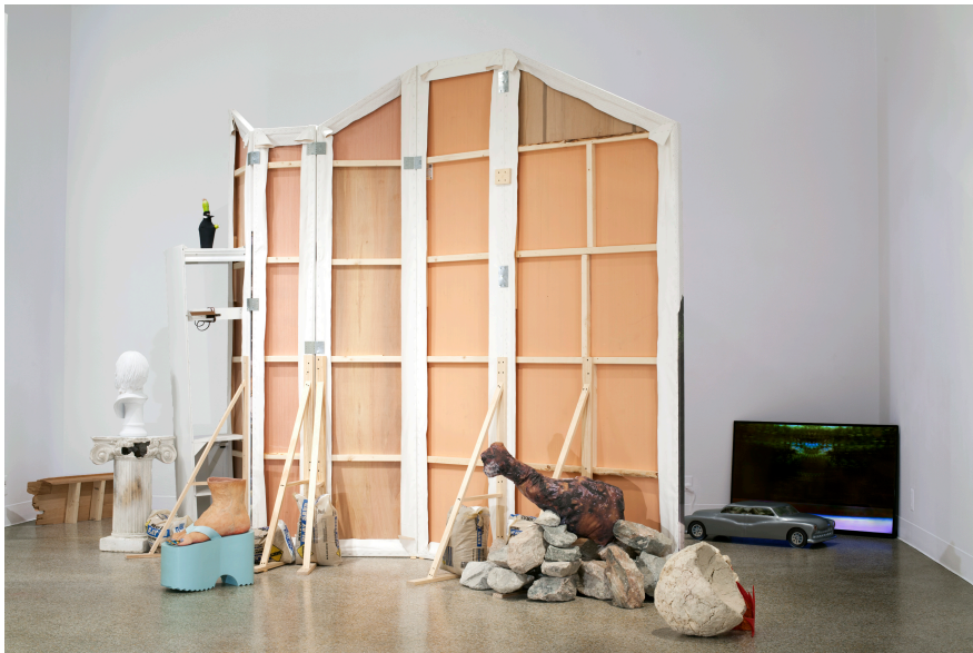
Fig. 8. Erratic Boulders , ink jet prints on canvas, ceramic, granite, foam, wood, video, un-used tool handles, plaster column, cabinet, play sand, 10'x 21'x 10', 2014

presence of modern visual imagery. In a music video, for instance, or the layered contemporary urban transparency, we cannot halt the flow of images for analytic observation; instead we have to appreciate it as an enhanced haptic sensation, rather like a swimmer senses the flow of water against his/her skin” (Pallasmaa 36). In my piece, Erratic Boulders , the dense and chaotic installation aims to mimic the sensation of traveling through highly layered contemporary landscapes. As Pallasmaa describes, walking through compact urban areas, or watching television, the dense flow of visual information is so rapid that it is difficult to stop and analyze each image separately- rather one can allow the images to flow over them. I want to stimulate, not alleviate this sensation. My thesis installation, Erratic Boulders , comprises dense amounts of visual information in an effort to rouse this sensation on many levels.