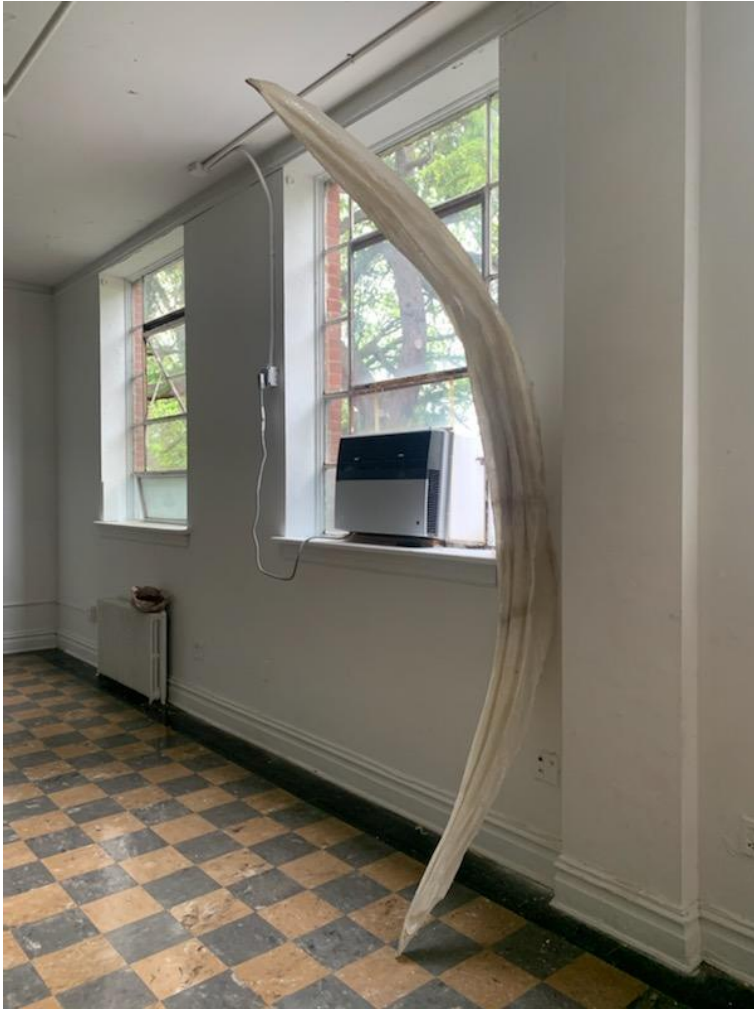
Yellowed (two forms) Urethane resin, mattress fabric 2022