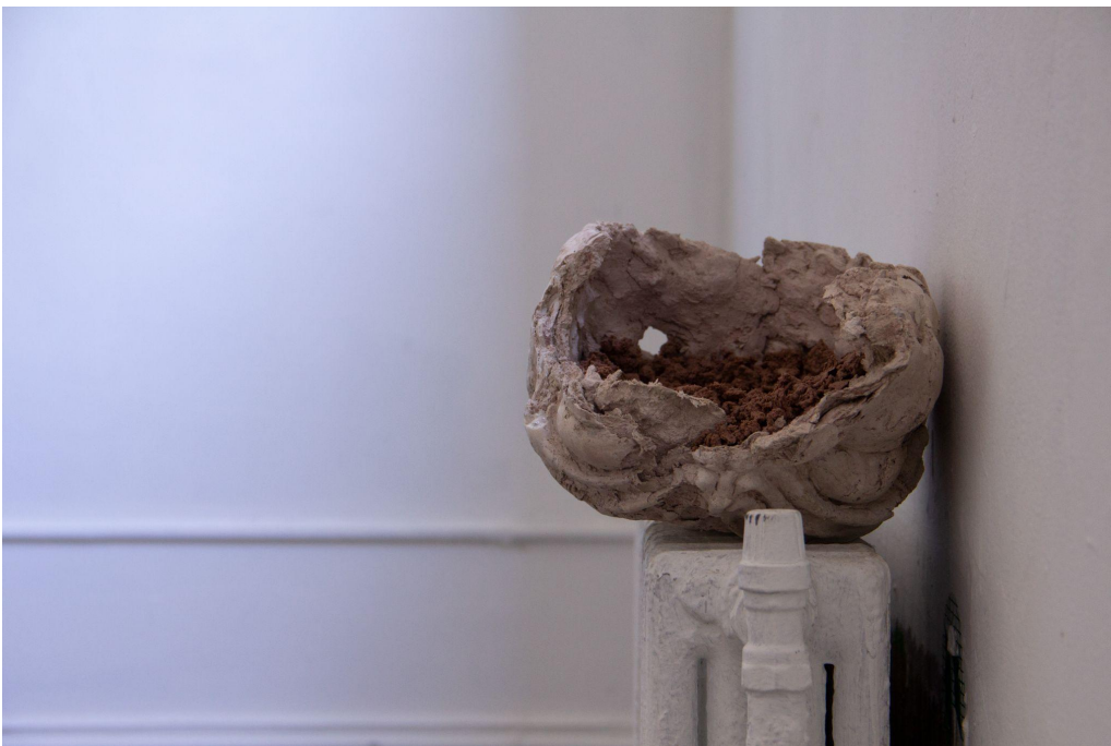
Pull your teeth up Urethane resin and clay mixture 2022