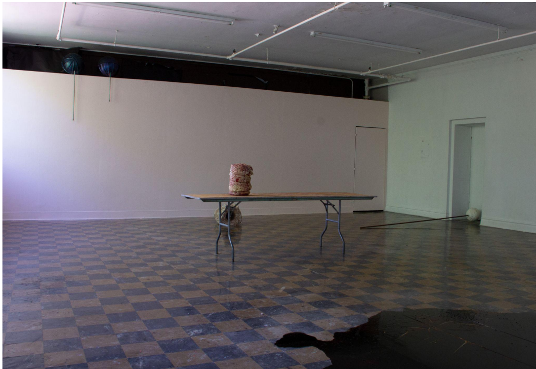
Installation view of Puddlefist