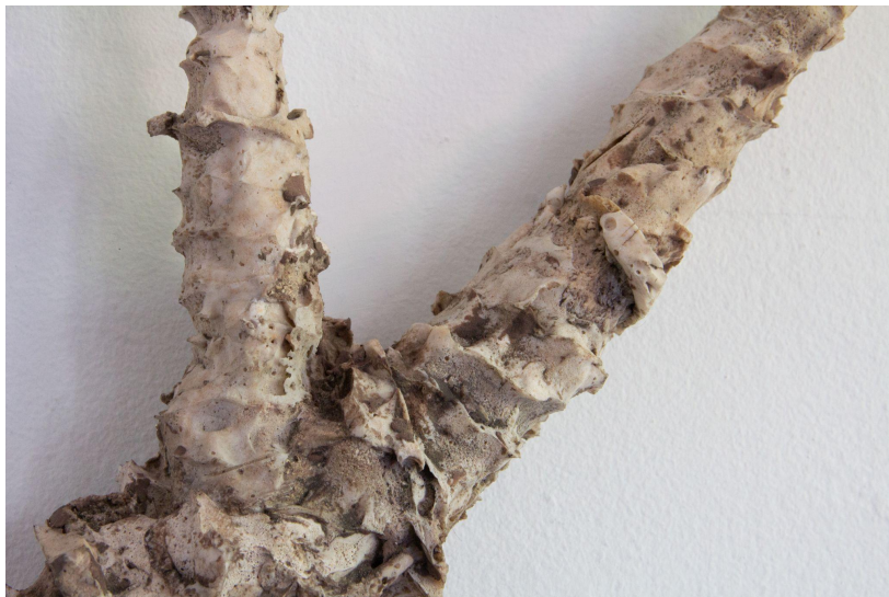
Dragged into sunlight Cast urethane resin, clay residue 2022