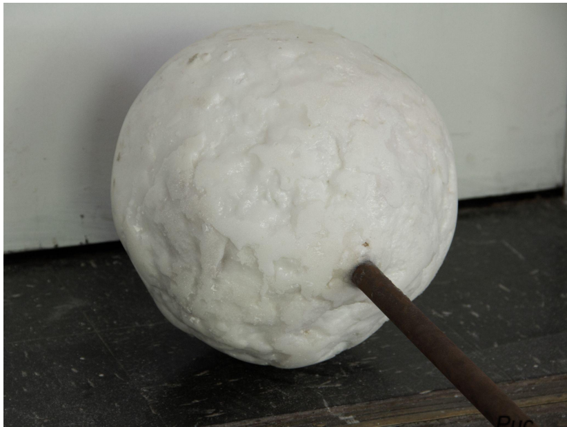
Puc Salt and urethane resin mixture 2022