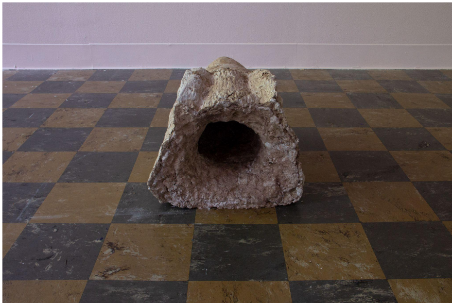
Apostate Urethane resin and clay cast 2022