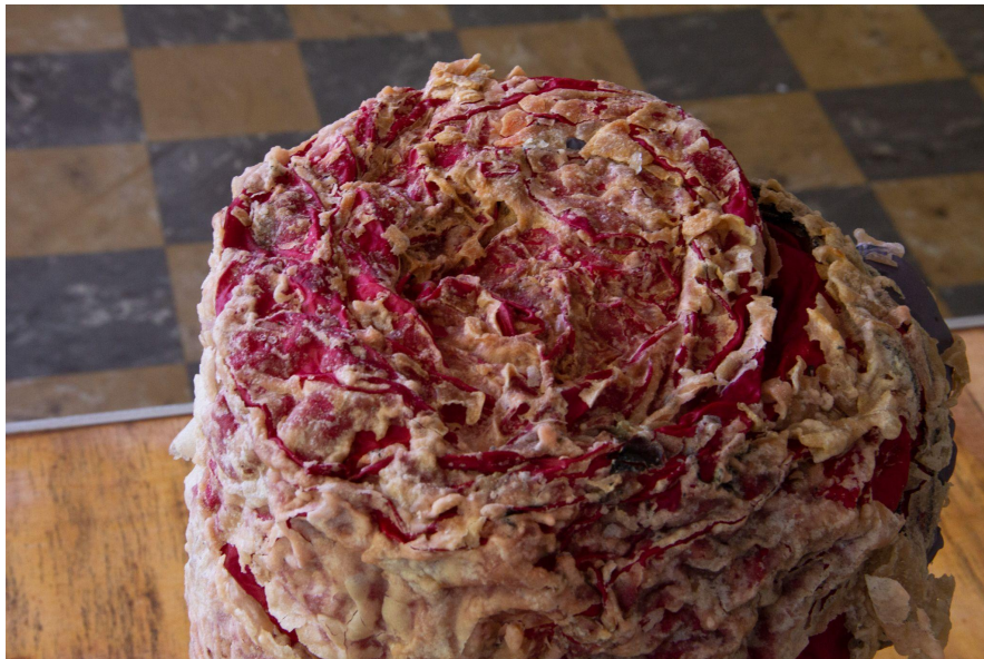
Angel Deep fried sleeping bag 2022