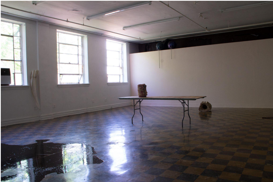
Installation view of Puddlefist