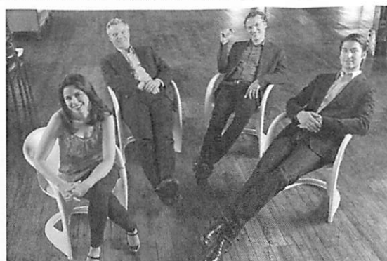
PACIFICA QUARTET — 09.13.2014