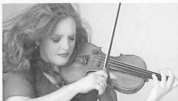
RACHEL BARTON PINE, violin — 01.24.2015