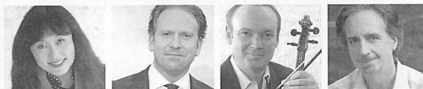
CHAMBER MUSIC SOCIETY OF LINCOLN CENTER — 02.28.2015