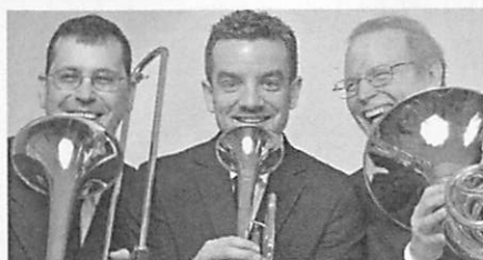
NEW YORK BRASS ARTS TRIO — 10.25.2014