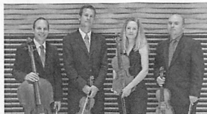
ST. LAWRENCE STRING QUARTET — 11.15.2014