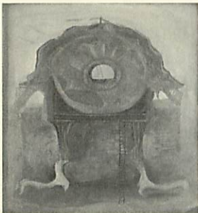
The Hut on Hen's Legs (Baba-Yaga), a nightmarish portrayal of the cackling witch Baba-Yaga living in a clock shaped hut supported by chicken legs, always on the hunt for her prey