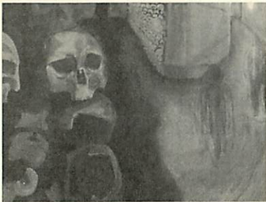
Catacombs, an eerie depiction of a visit to the ancient Catacombs in Paris