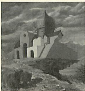
The Great Gate of Kiev, a depiction of Hartmann's sketch of a proposed city gate for Kiev, grandioso architecture topped by cupolas in which carillons ring