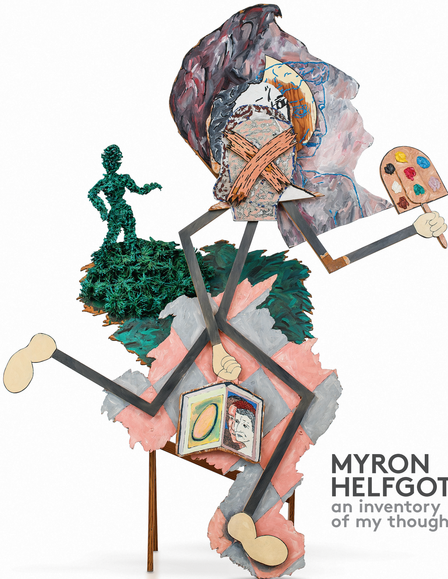
MYRON HELFGOTT an inventory of my thoughts