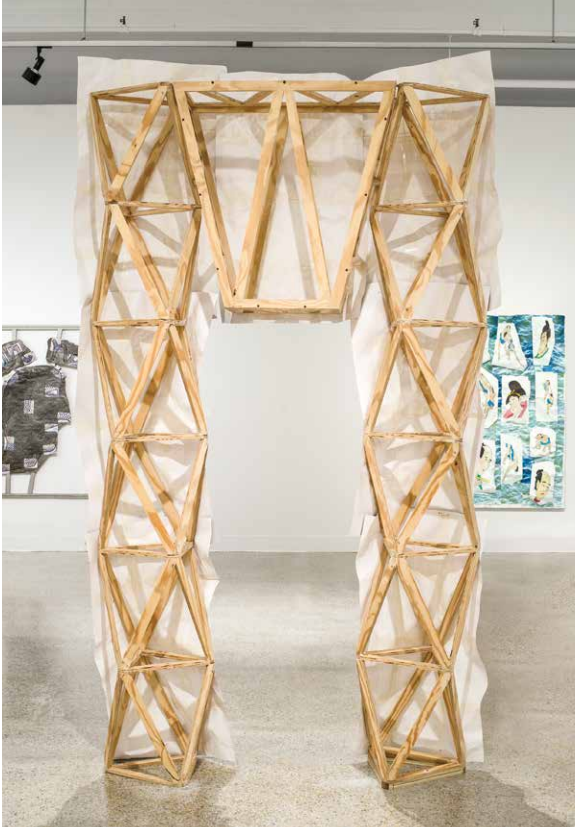
Doorway , 2011