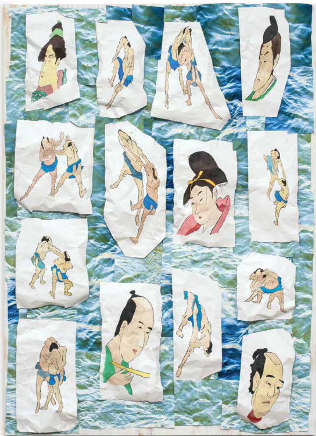
Under the Rose, 1987 Opposite: Japanese Wrestlers, 2014