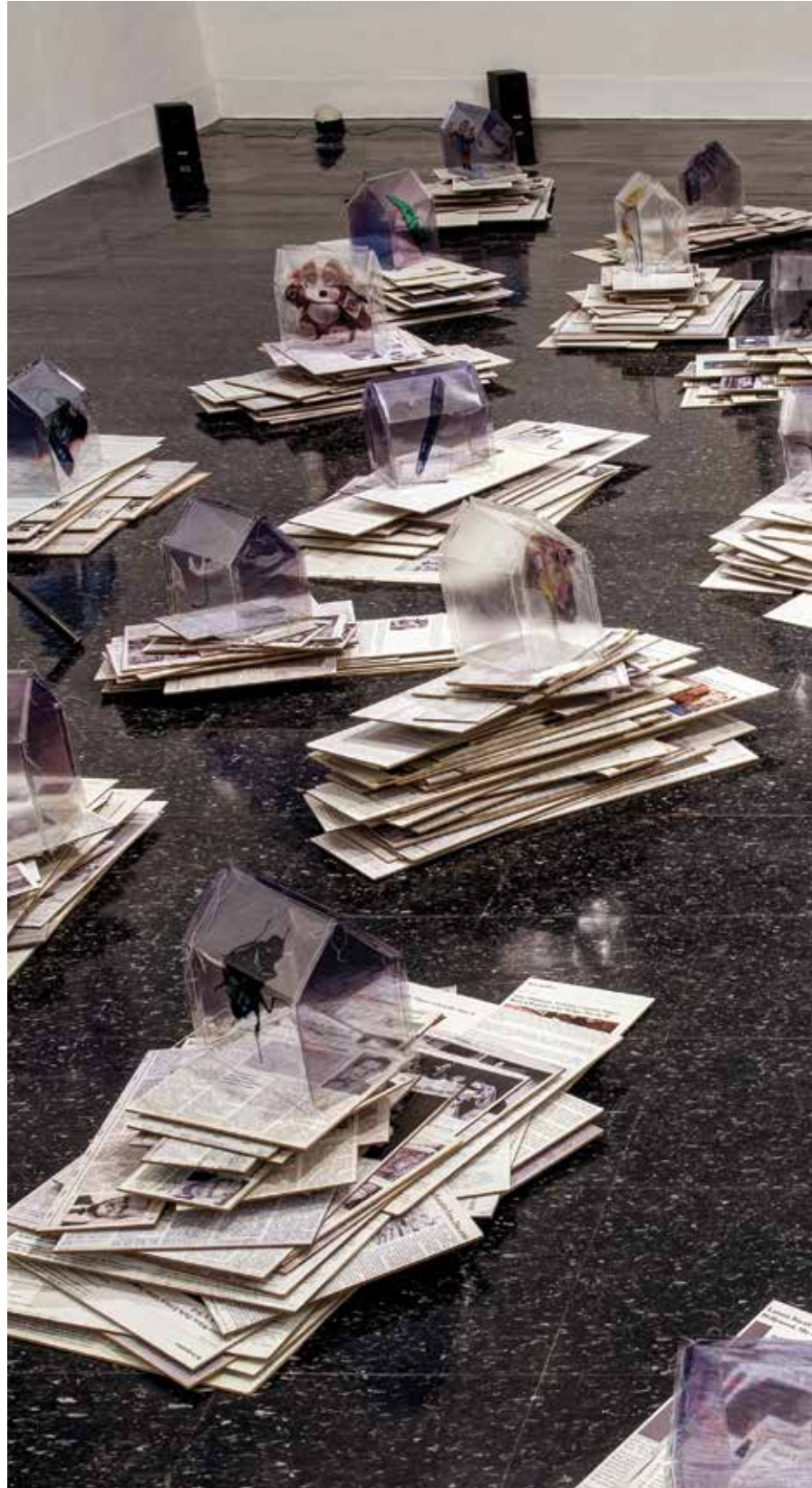
Here and There, 2001–ongoing