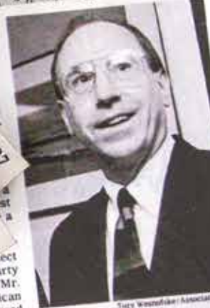
Gerry Studds in 1995.