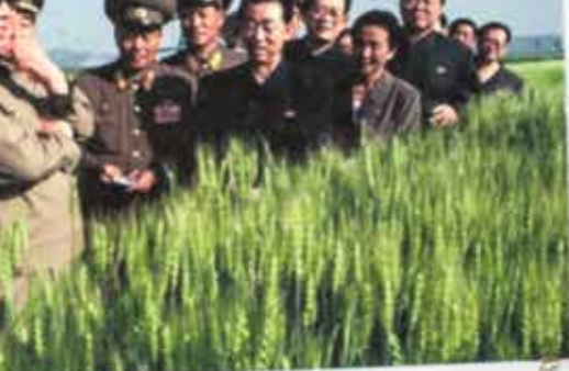
people, Kim Jong-il presided with an iron hand over a... and collapse, fostering perhaps the last...