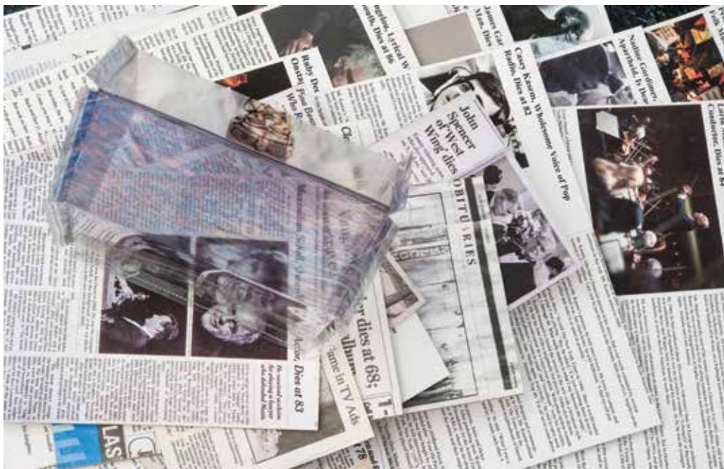
Here and There (details), 2001–ongoing