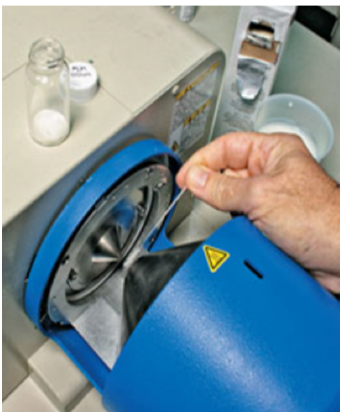
Figure 2: Real time sampling using DART-MS.

After completing her independent study, Childrey was presented with a 2015 Undergraduate Research Opportunities Program (UROP) fellowship. With the fellowship, she expanded on her independent study by focusing on the analysis of fatty acids found on the exosporium of the bacterial cell. Childrey stated that forensic analysis of the bacterial exosporium allows for the lipid profiles to be analyzed without destructing the cell sample.